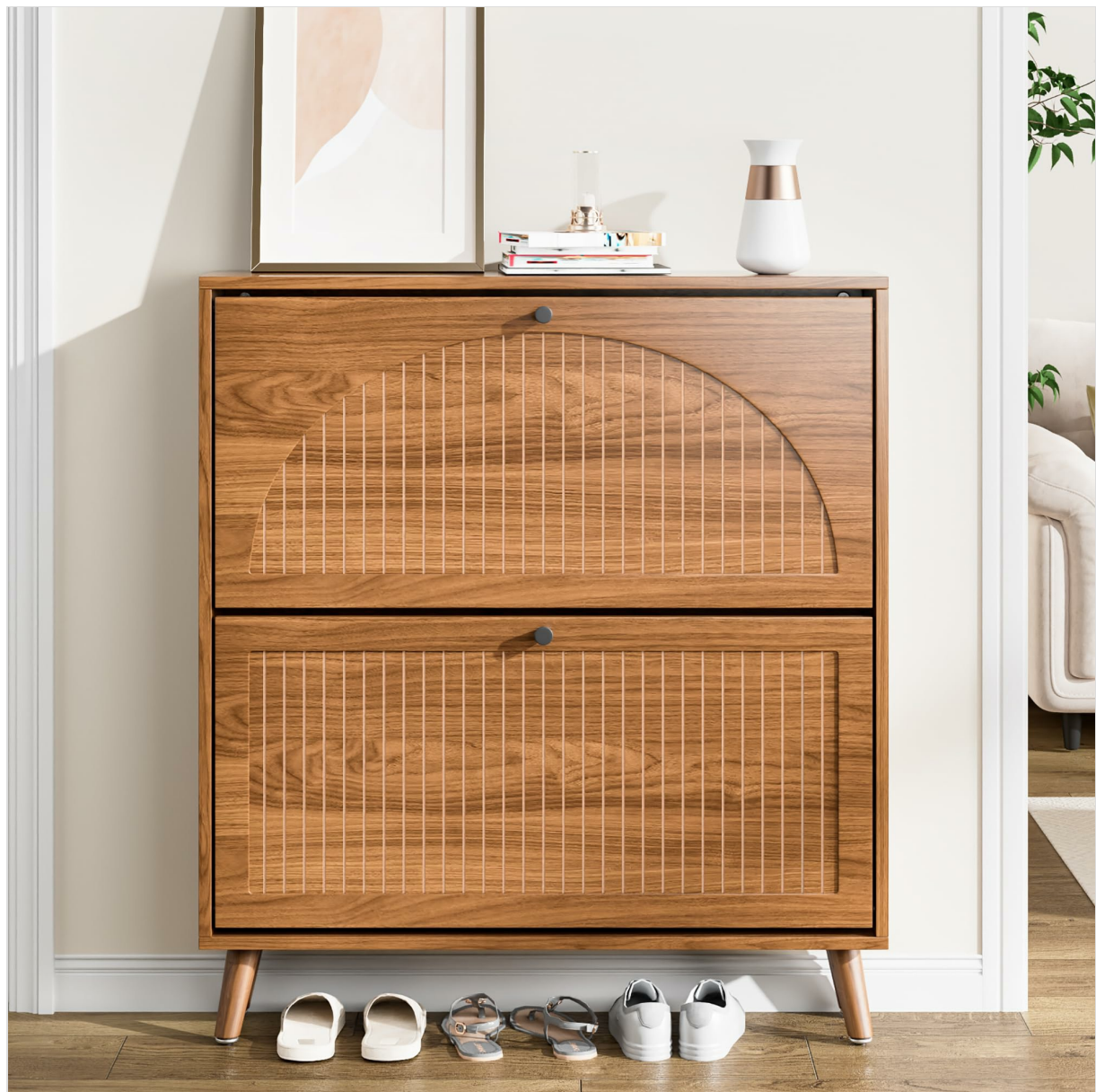
Figure 2: Front view of the Fsbecl Shoe Storage Cabinet, showcasing its modern design.