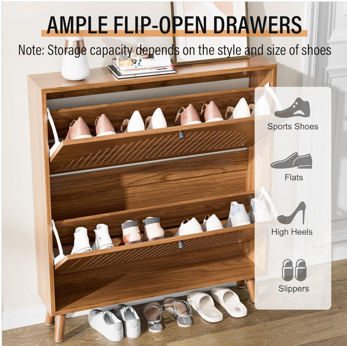
Figure 4: Detail of the flip-open drawers, demonstrating storage capacity and mechanism.

Note: Storage capacity depends on the style and size of shoes