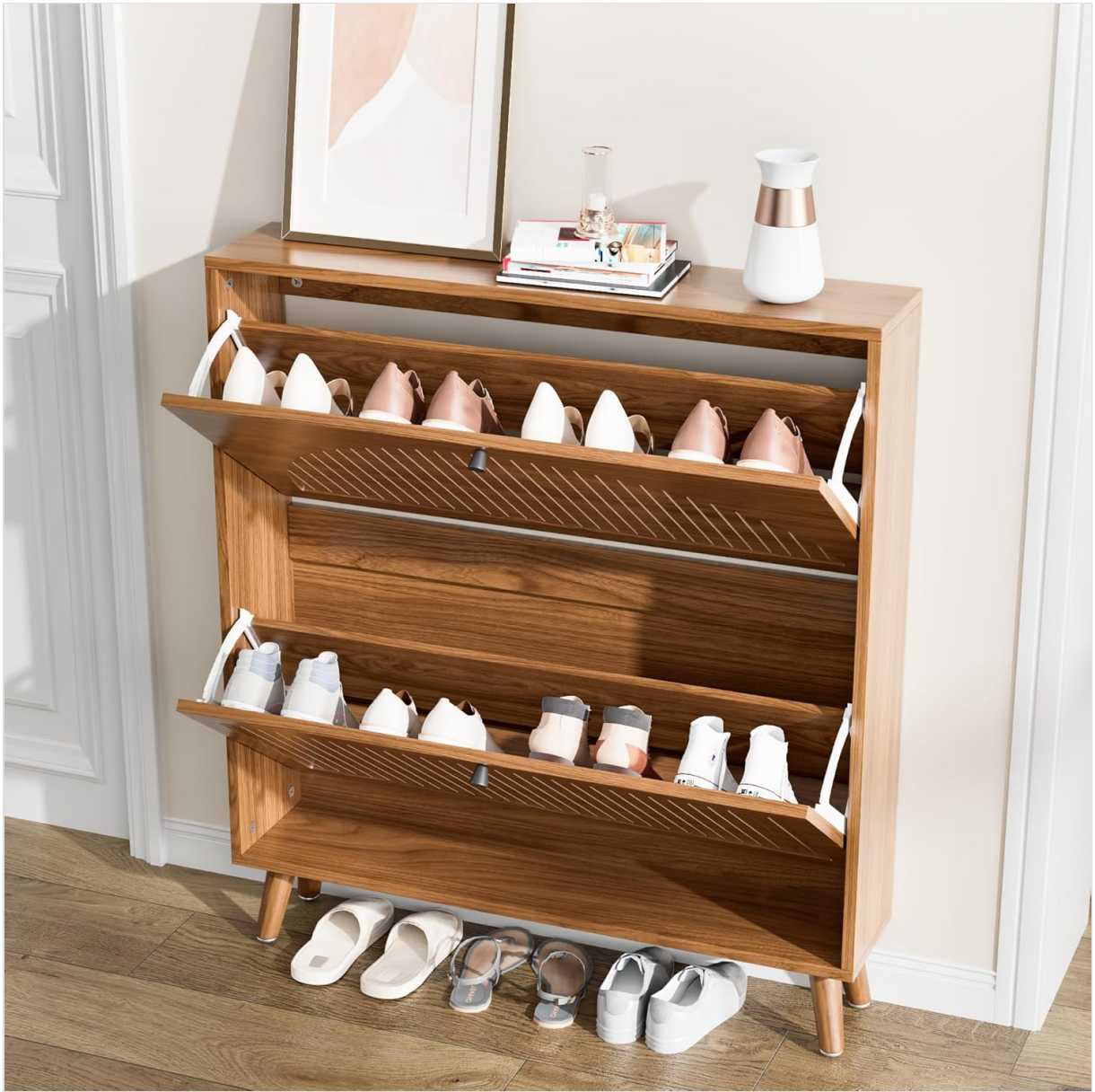
Figure 5: View of the cabinet with drawers open, showing organized shoes.