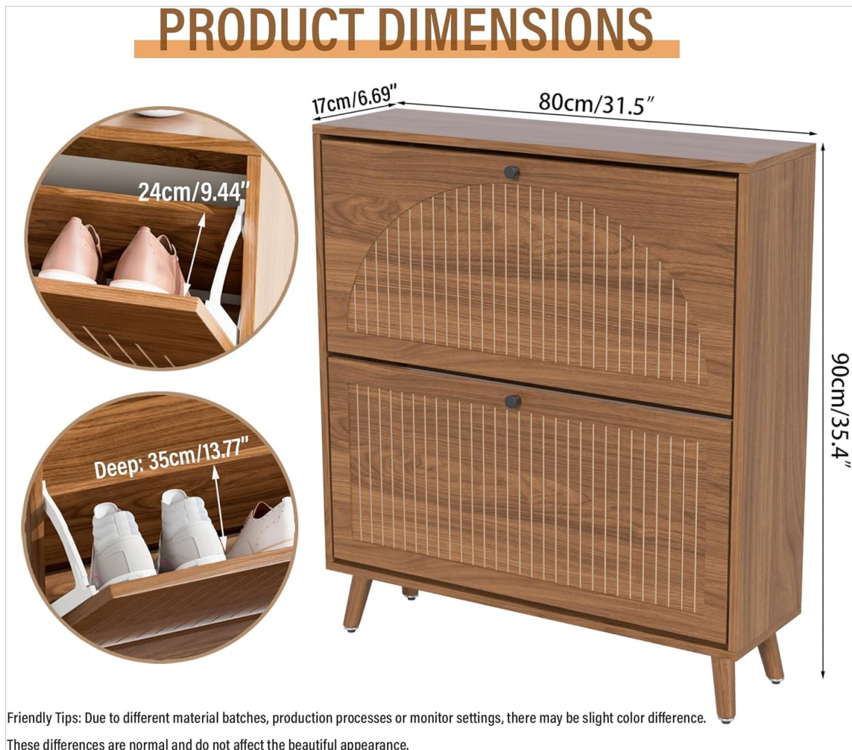
Figure 3: Product dimensions for planning placement and assembly.