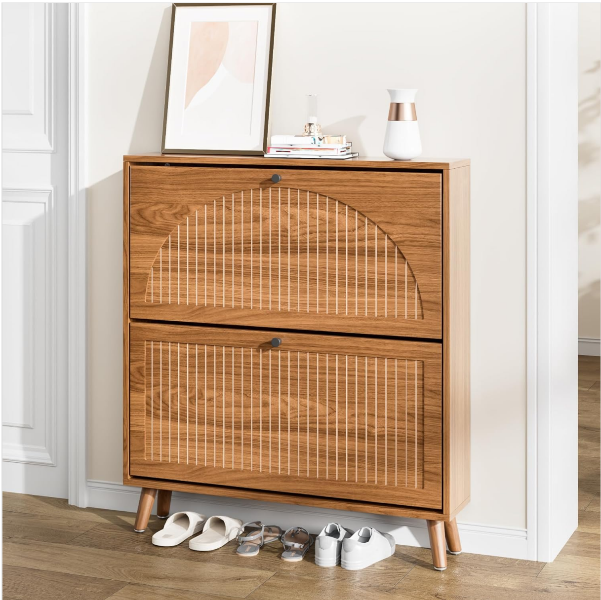
Figure 6: The cabinet in an entryway, illustrating its space-saving design.

Your browser does not support the video tag.