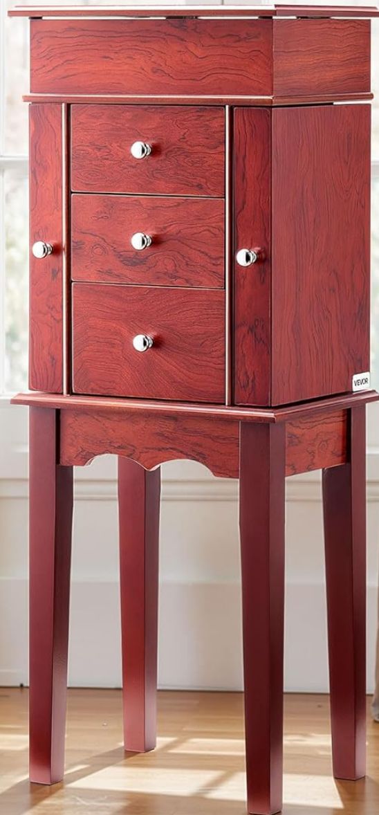
Image: The three spacious drawers for various jewelry storage.