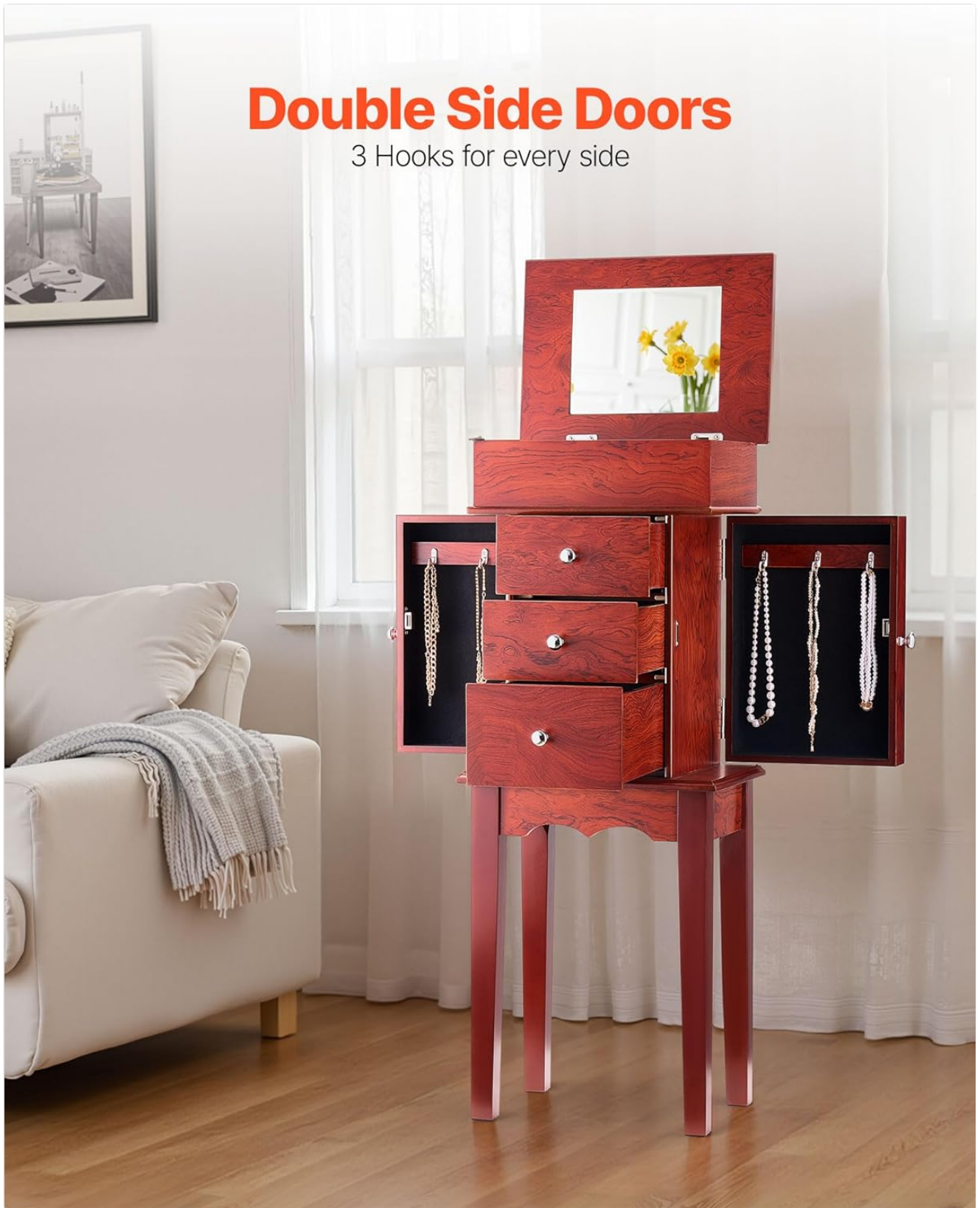
Image: Side doors with necklace hooks for tangle-free storage.

Your browser does not support the video tag.