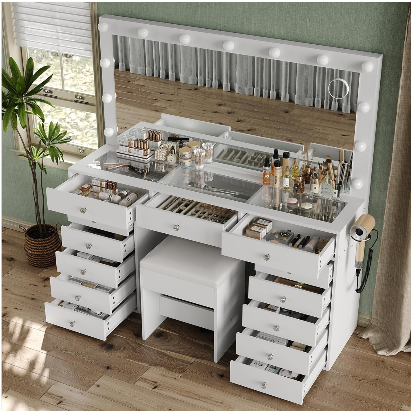
Figure 4.2: Overview of the vanity's storage, with drawers open.