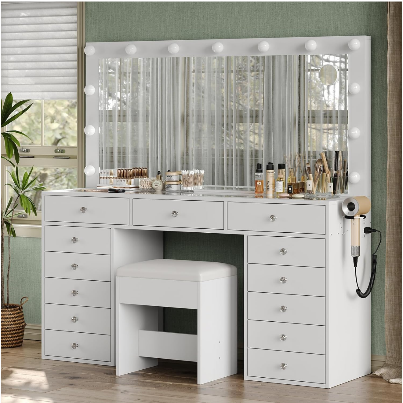
Figure 4.1: The FUSOU 55-inch Makeup Vanity fully assembled.