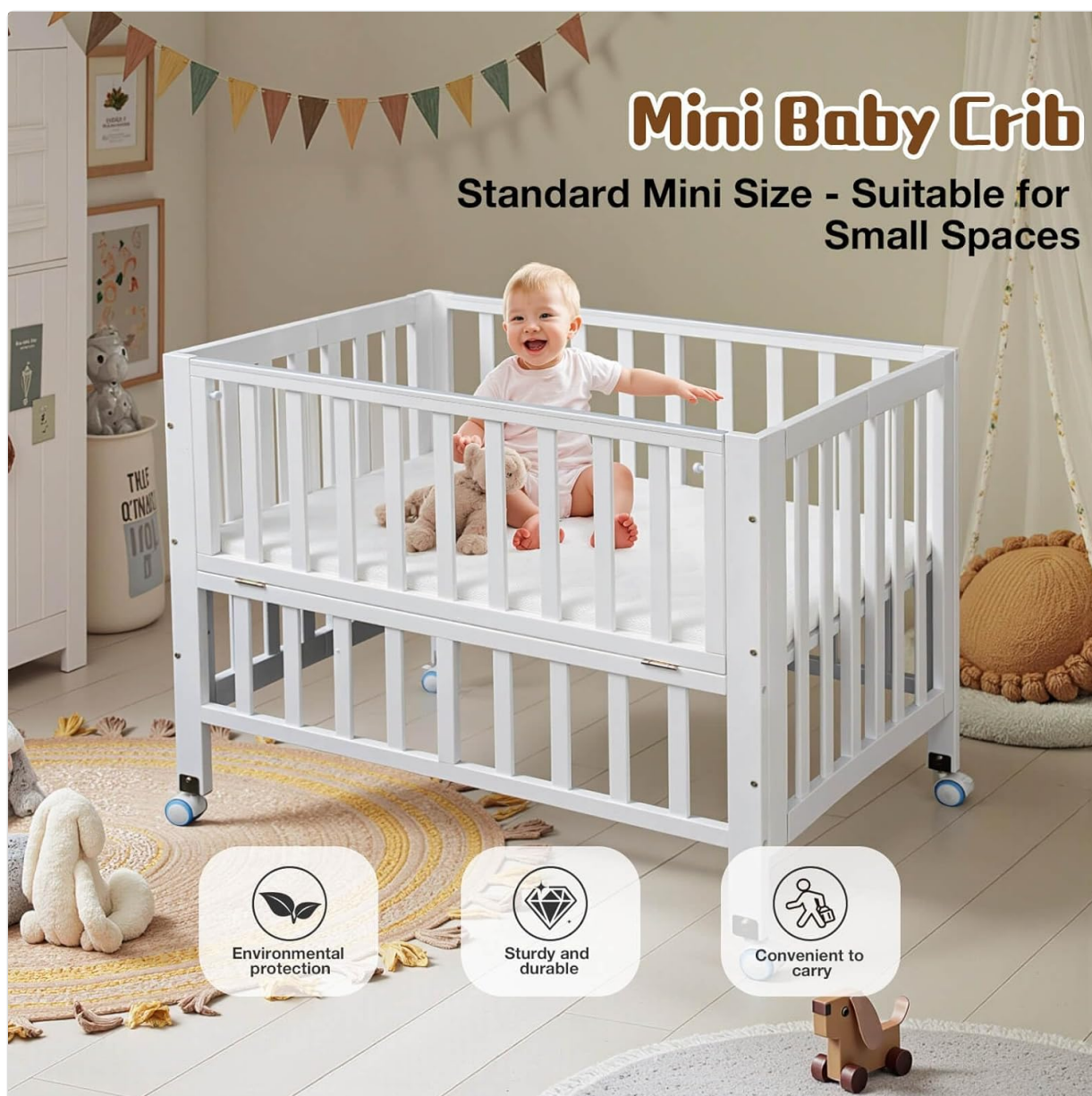
Image: The assembled Flwrgirl Mini Baby Crib, highlighting its standard mini size suitable for small spaces, environmental protection, sturdy and durable construction, and convenient portability.

6. Place Mattress: Lay the soft sponge mattress (38 x 24 inches) onto the mattress support board.