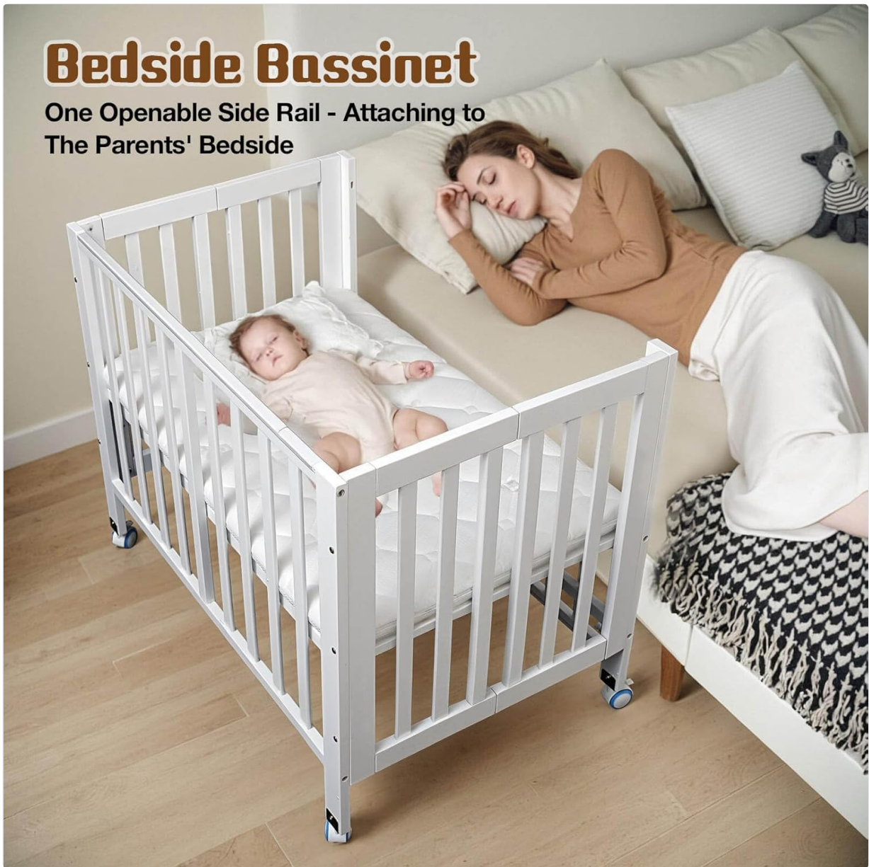
Image: The crib configured as a bedside bassinet, with one side rail lowered to attach to the parents' bed, allowing close proximity to the baby.

One Openable Side Rail - Attaching to The Parents' Bedside