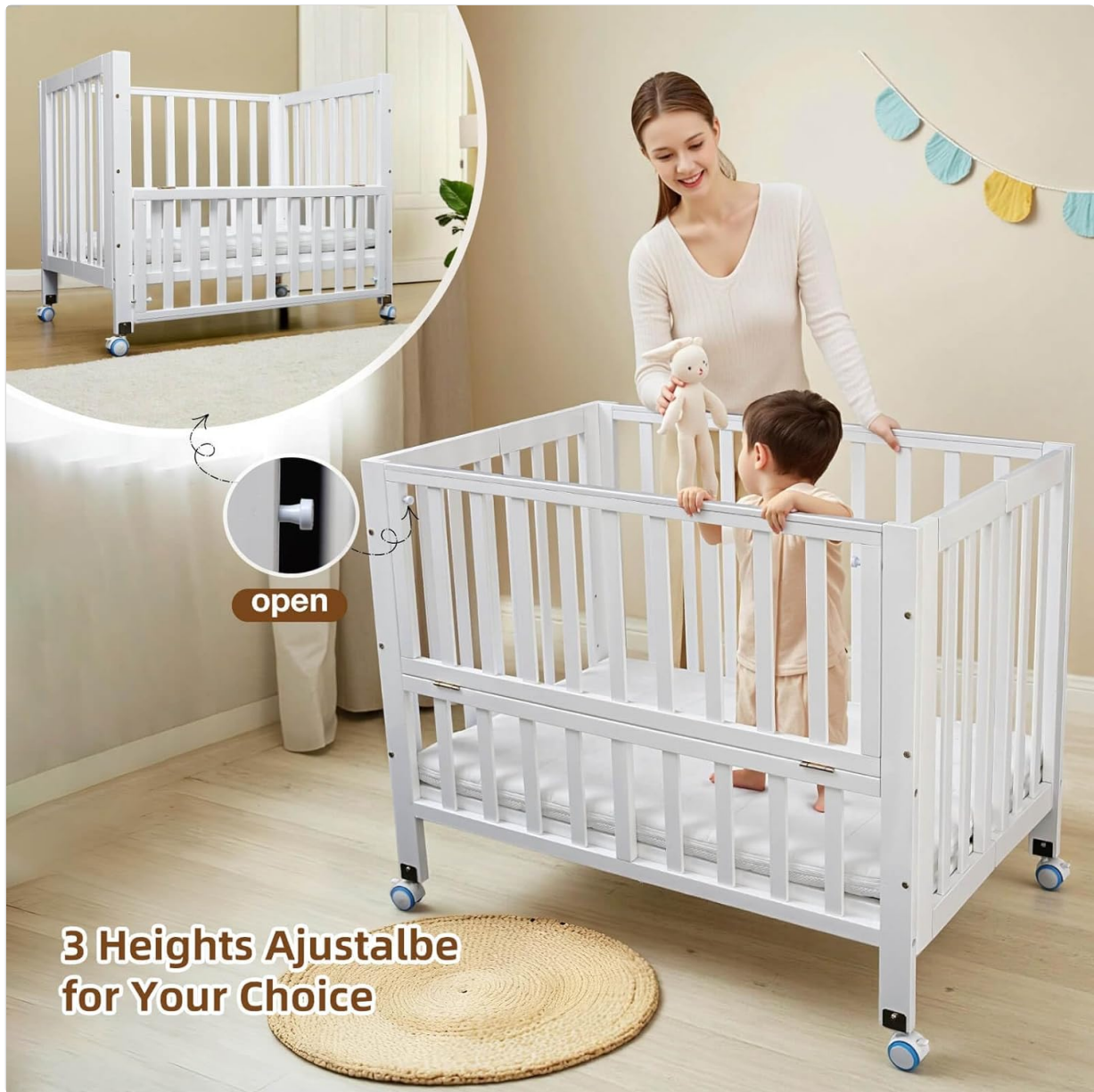
Image: Visual representation of the three adjustable mattress height levels: 20 inches, 16 inches, and 12 inches from the ground.