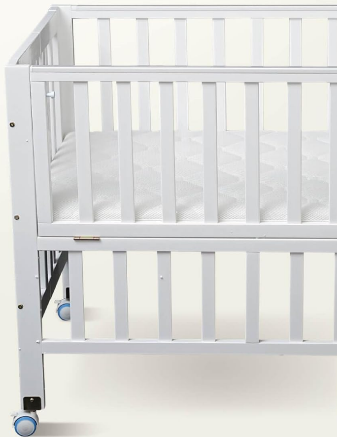
Image: Overview of the crib dimensions (40"L x 25"W x 32"H) and mattress size (38" x 24").