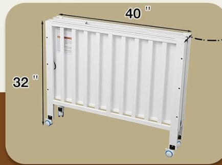
Image: Detailed view of the crib's features, including New Zealand pine wood construction, anti-grazing barbs (anti-bite strips), the soft mattress, and the 360-degree swivel wheels with brake pedals.