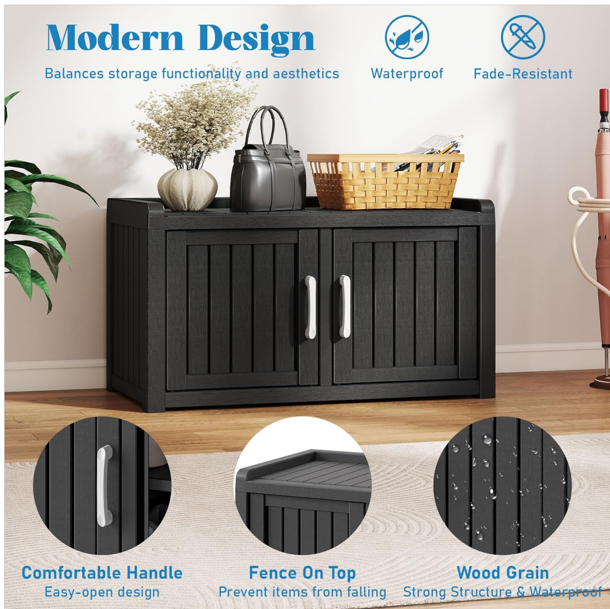
Image 3.2: Detailed view of design elements including handles, top fence, and wood grain finish.