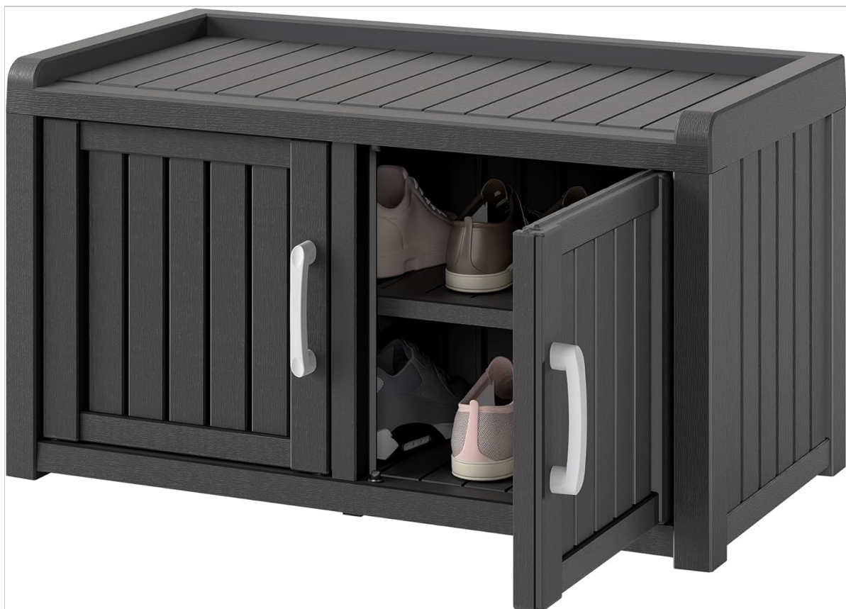
Image 1.1: The KAMABOKO Outdoor Shoe Storage Cabinet, featuring two barn-style doors and internal shelving for shoes.

Thank you for choosing the KAMABOKO Outdoor Shoe Storage Cabinet. This manual provides essential information for the safe assembly, operation, and maintenance of your new storage cabinet. Please read these instructions thoroughly before use and retain them for future reference.