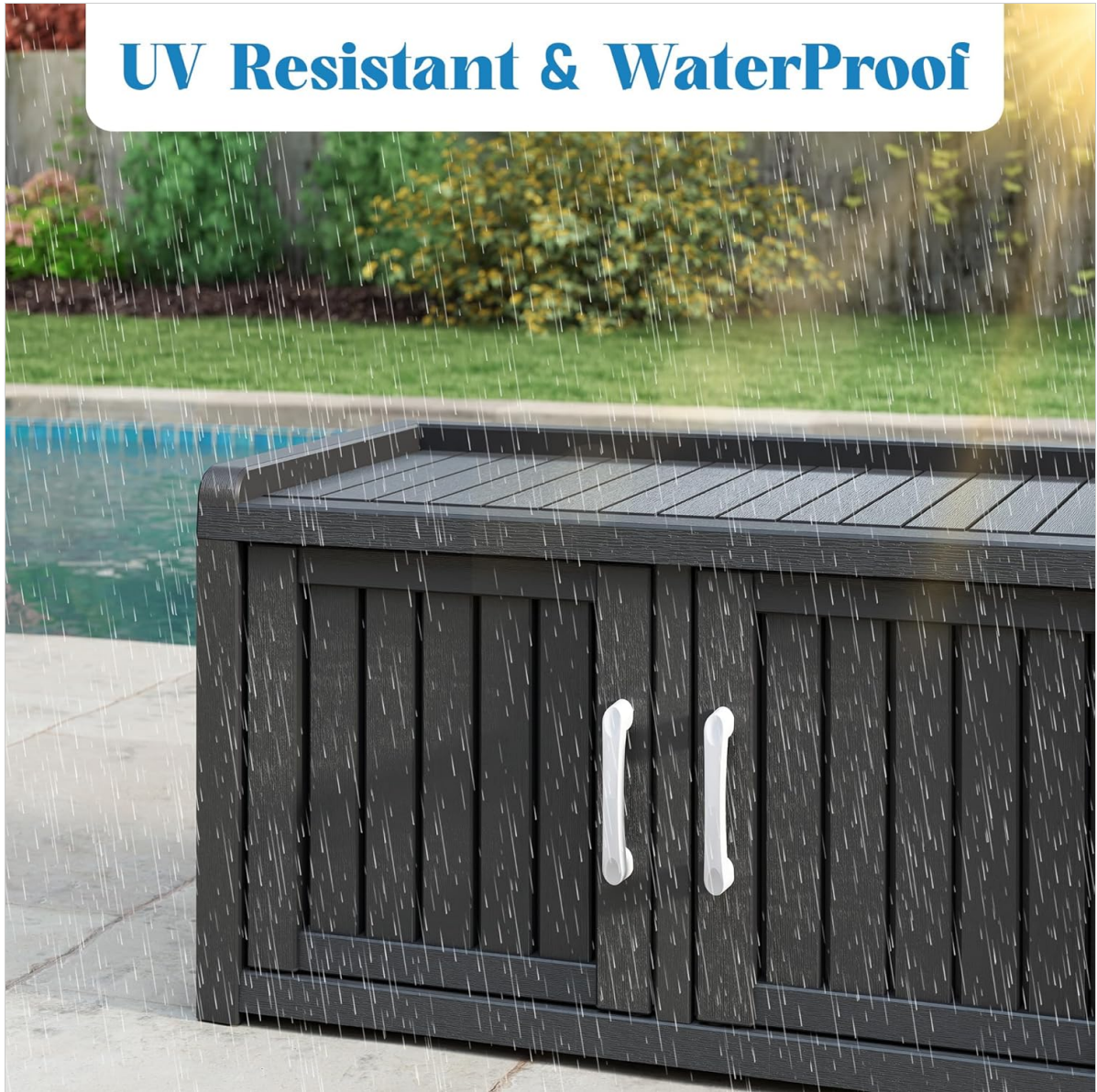
Image 6.1: Cabinet demonstrating its waterproof design in an outdoor setting.