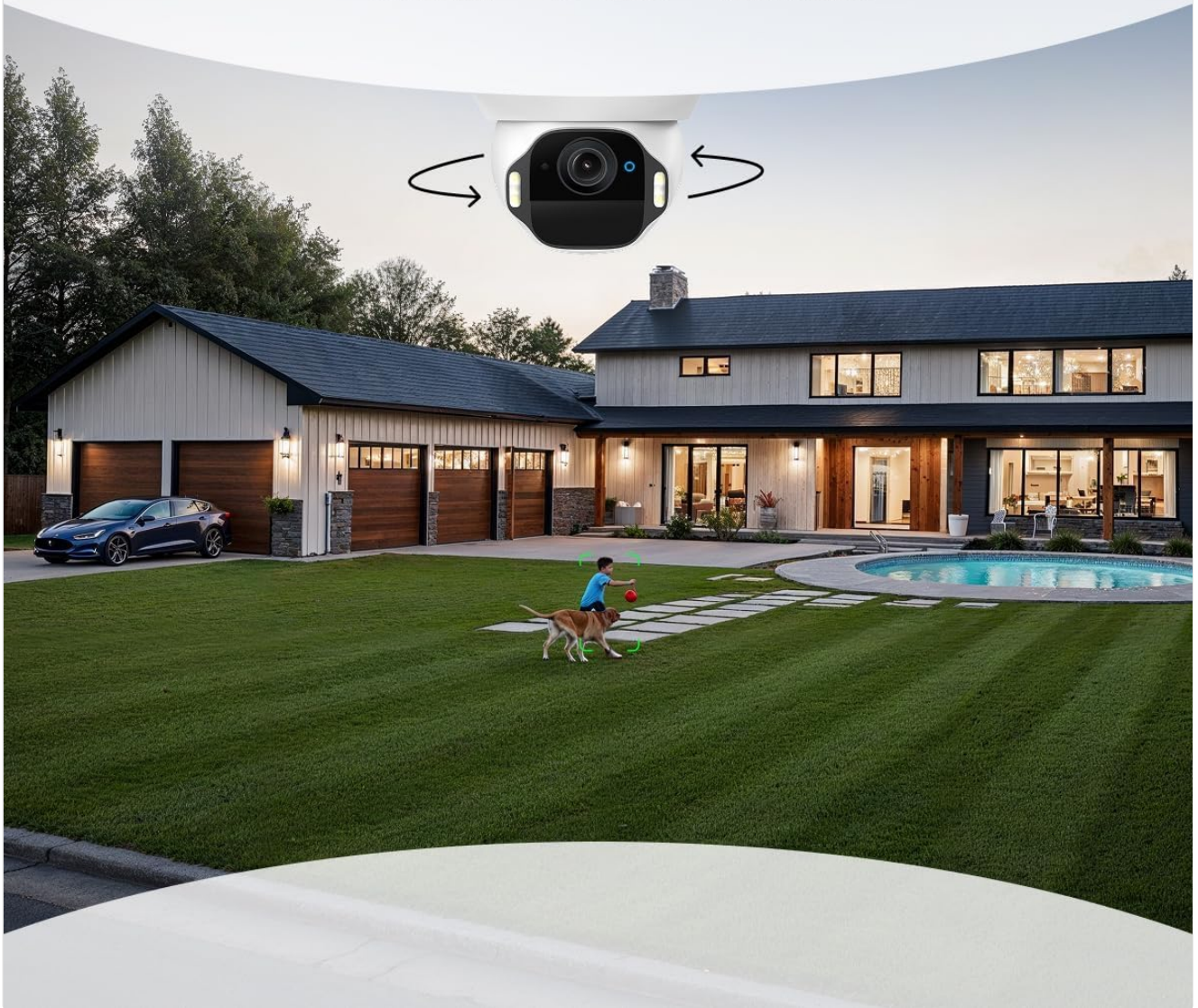
Image: SoloCam E42 mounted on an exterior wall.

Video: Installation guide for a eufy Security SoloCam (S220 model shown, but installation steps are similar).