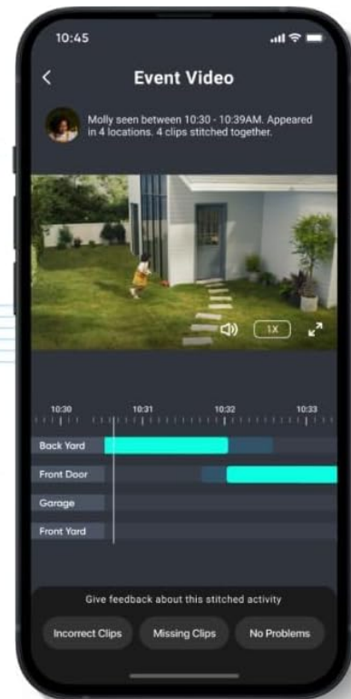
Image: Cross-Camera Tracking with HomeBase S380.