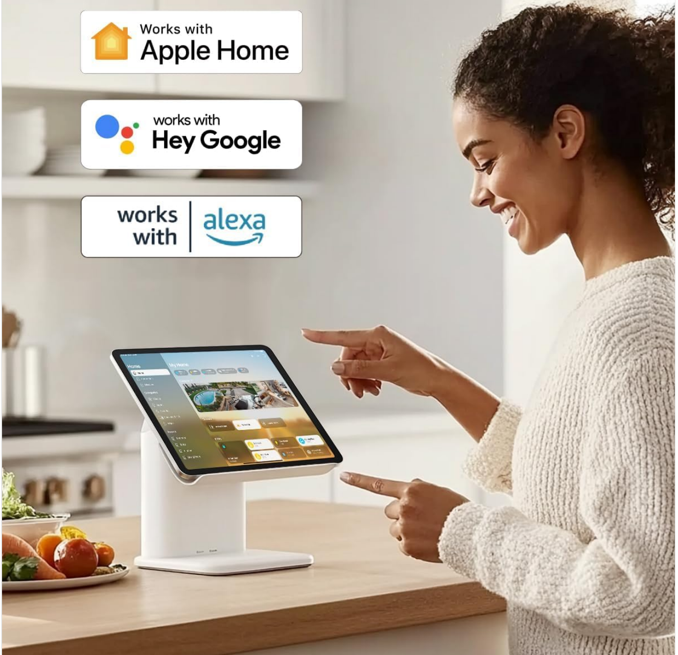
Image: Smart Home Compatible.