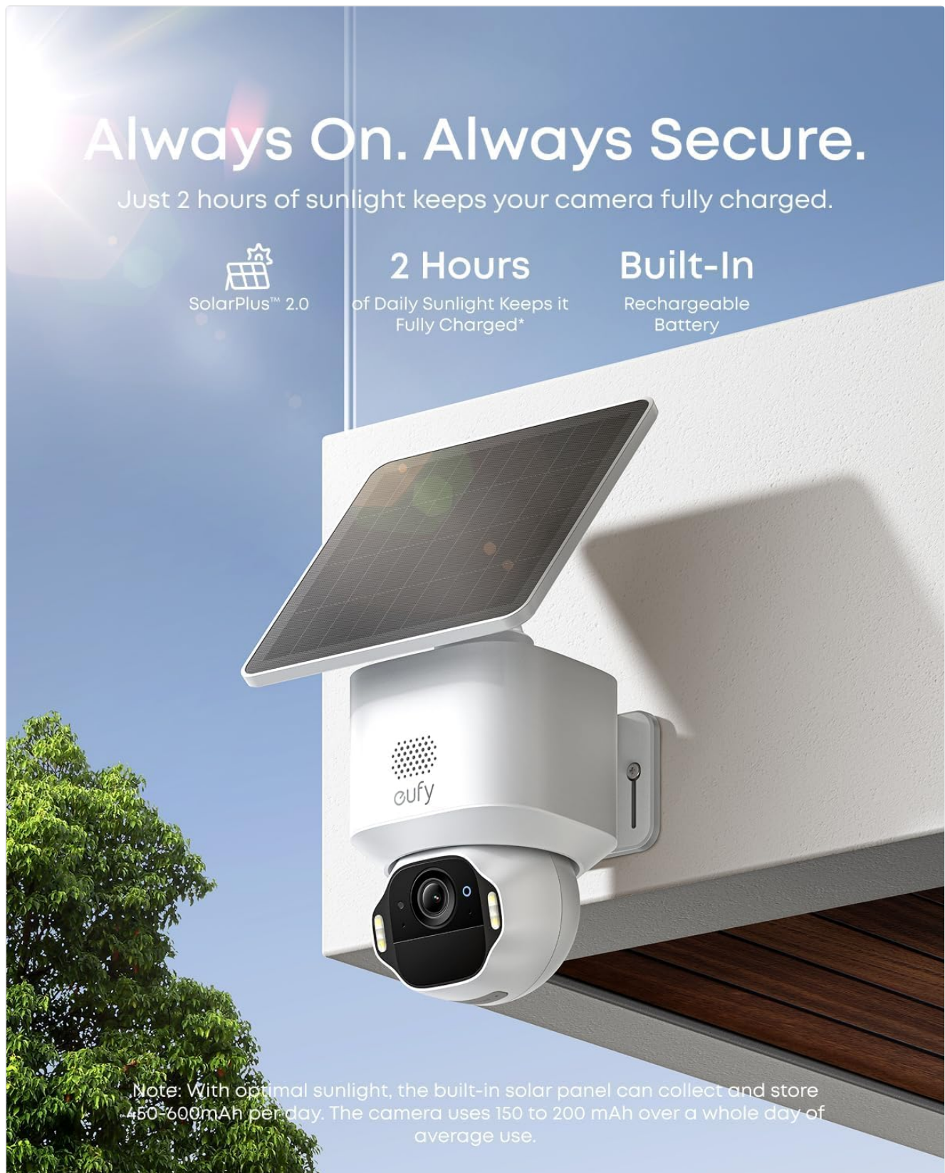
Image: SoloCam E42 with its solar panel for continuous power.

provided USB cable. The camera features a built-in solar panel for continuous charging after installation, requiring approximately 2 hours of direct sunlight daily for sustained operation.