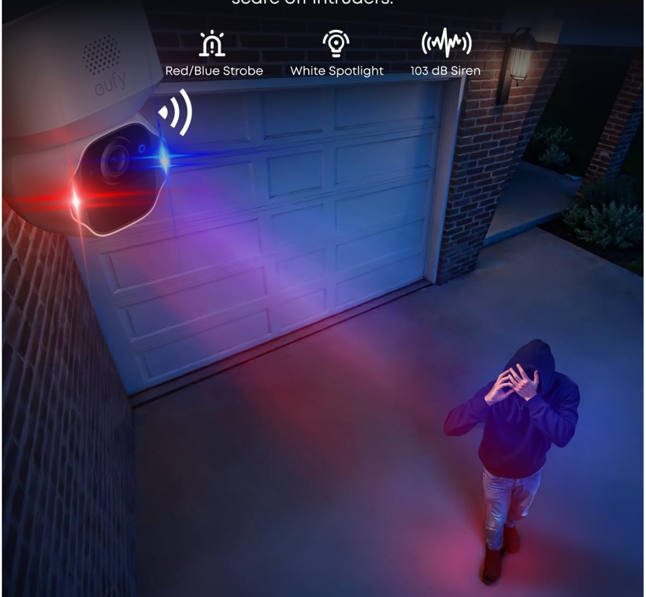
Image: Triple protection to deter intruders.

Instantly trigger warning lights and powerful sirens to scare off intruders.