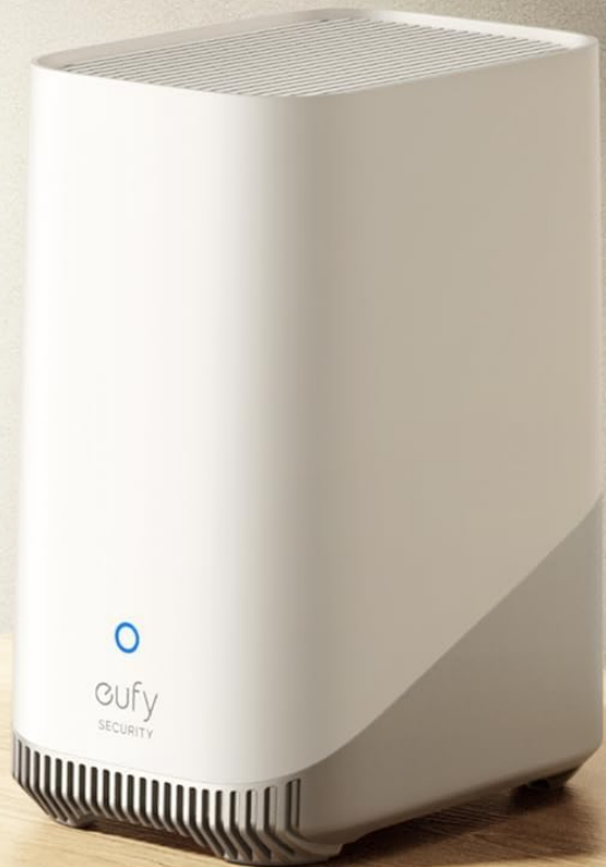
Image: HomeBase S380 with its advanced features.

BionicMind™ Differentiates Family and Strangers