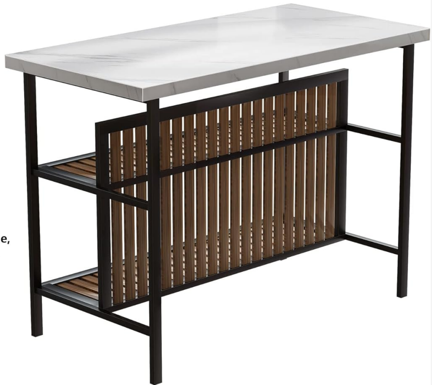
Image: Detailed views of the bar table's construction, illustrating the high-quality desktop, the stable wide slat design of the storage shelves, and the robust metal frame.