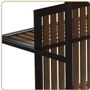
Wide slat design, the bearing capacity is more stable, and it is not easy to drop items