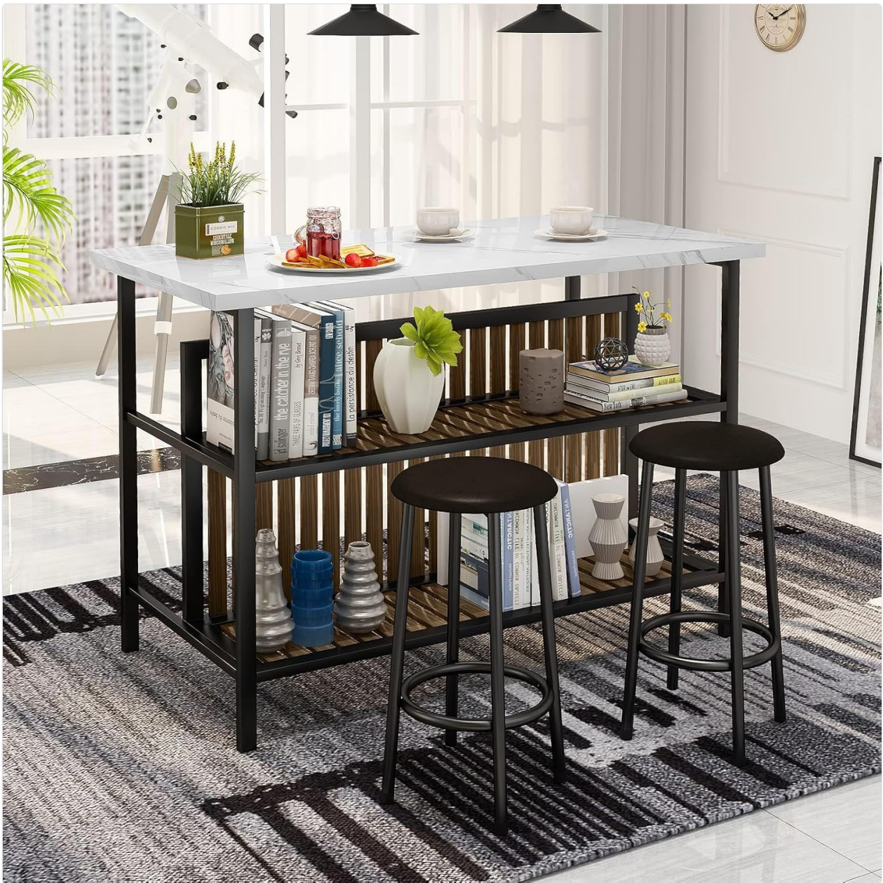
Image: The bar table and chairs set positioned in a bright room, demonstrating its use as a dining or casual seating area, with books and decorative items stored on its shelves.