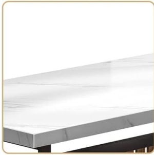
High-quality desktop, easier to maintain in daily life