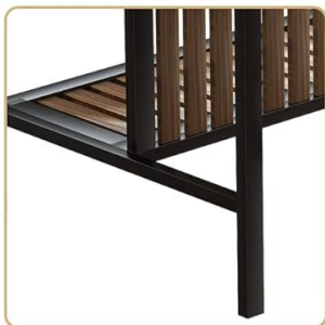
Rugged metal structure, not easy to shake