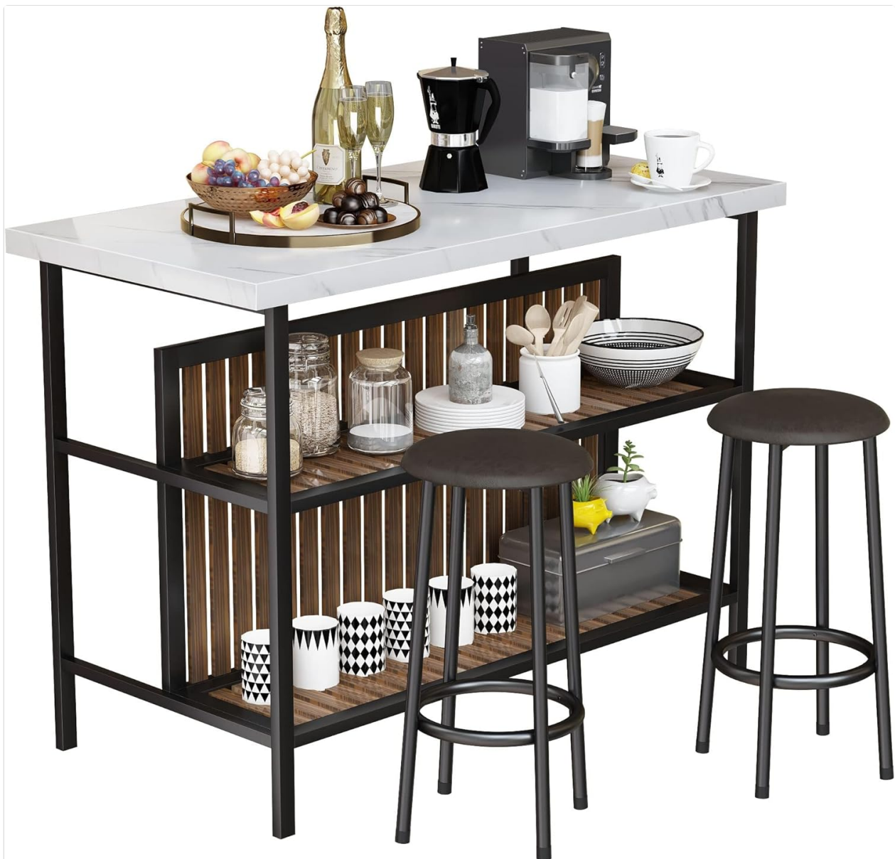
Image: The bar table and chairs set configured as a coffee bar, featuring a coffee machine, fresh fruit, and various kitchen essentials, showcasing its functional versatility.