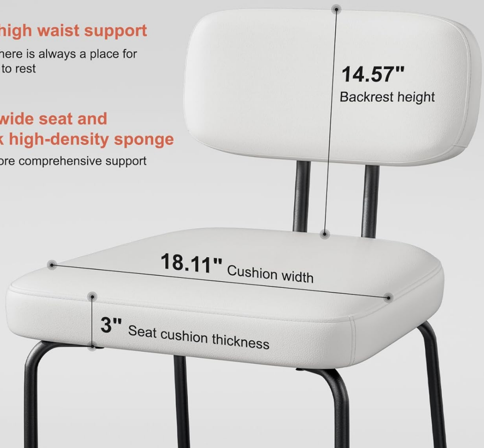
Image: Diagram detailing the comfortable seating experience, highlighting the 14.57-inch backrest height, 18.11-inch cushion width, and 3-inch seat cushion thickness.