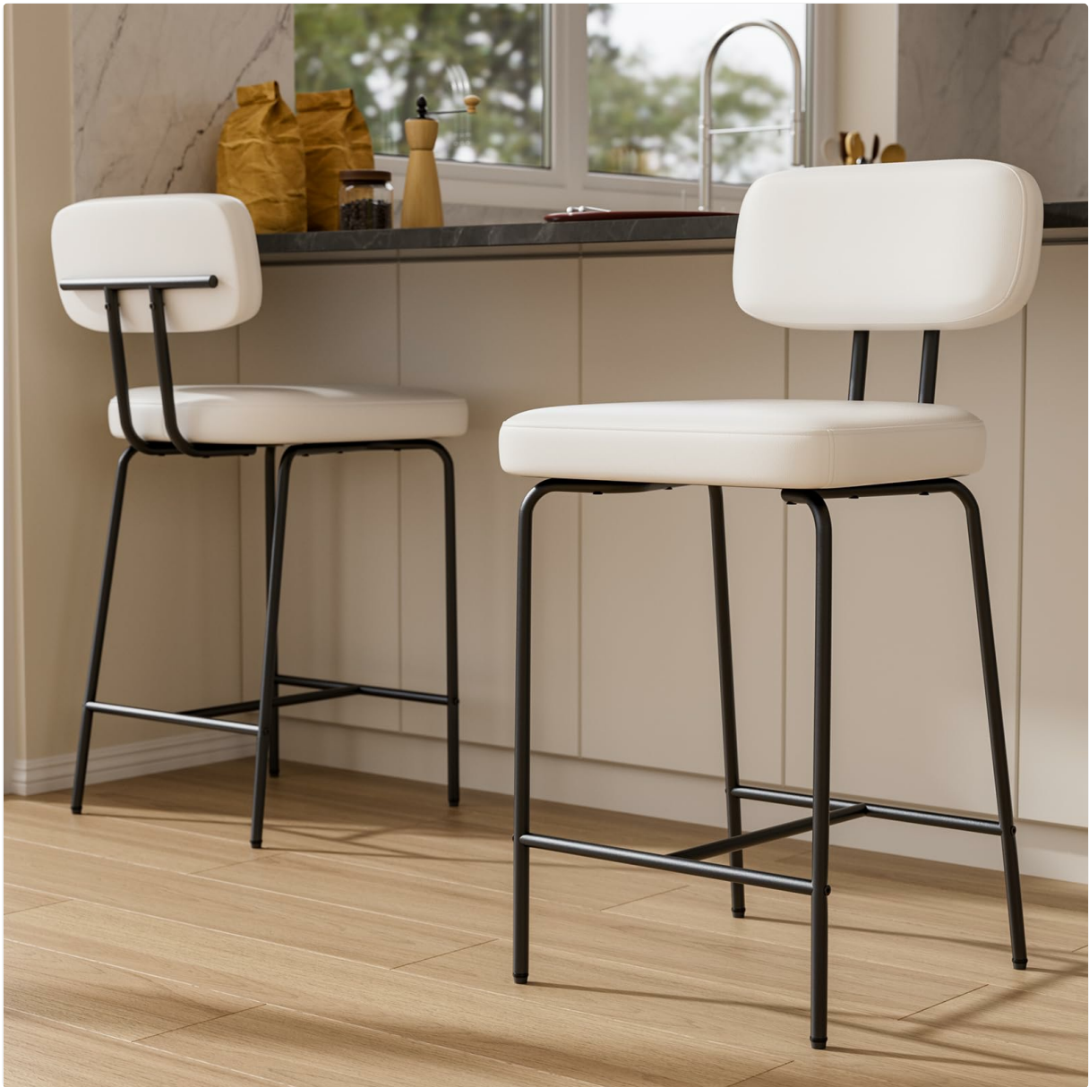
Image: GXJ 26-inch Counter Height Bar Stools (Set of 2) in a modern kitchen environment.