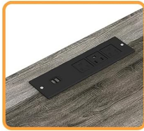
Built-in 2 AC Sockets 2 USB Ports