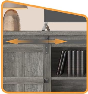
Sliding Bin Door Design