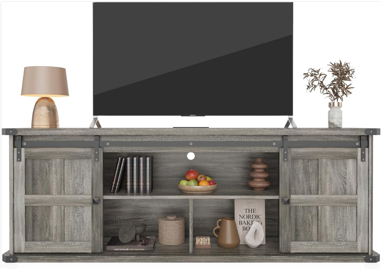
Figure 1: Front view of the Garvee 70" TV Stand with a television and decorative items.