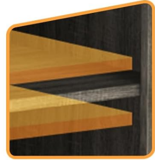
Position Adjustable Shelf