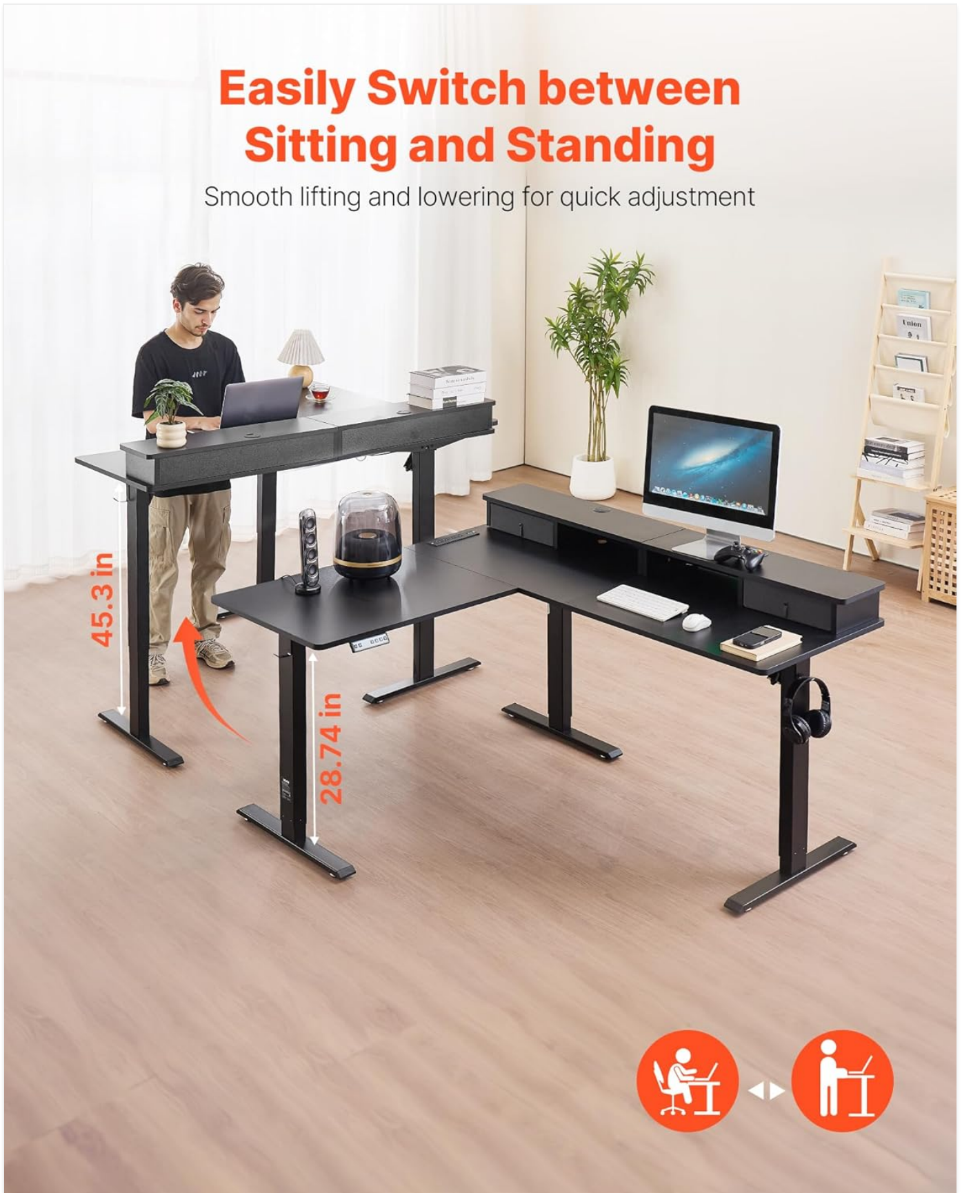
Image: A user demonstrating the smooth transition between sitting and standing heights, illustrating the desk's adjustable range.

Smooth lifting and lowering for quick adjustment