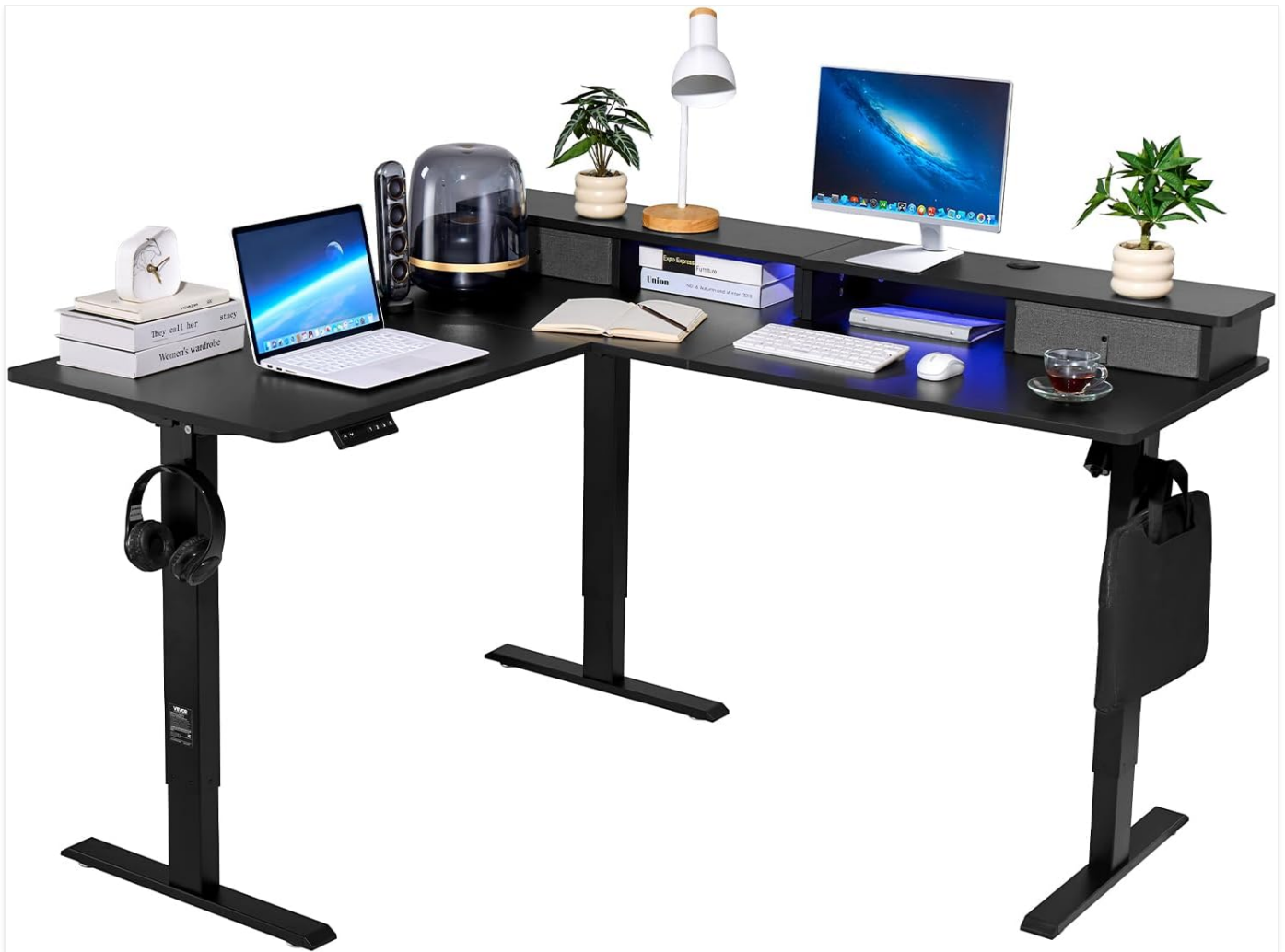
Image: The VEVOR L Shaped Electric Standing Desk, Model ZWE-03, showcasing its spacious design and integrated features like the monitor stand and power strip.