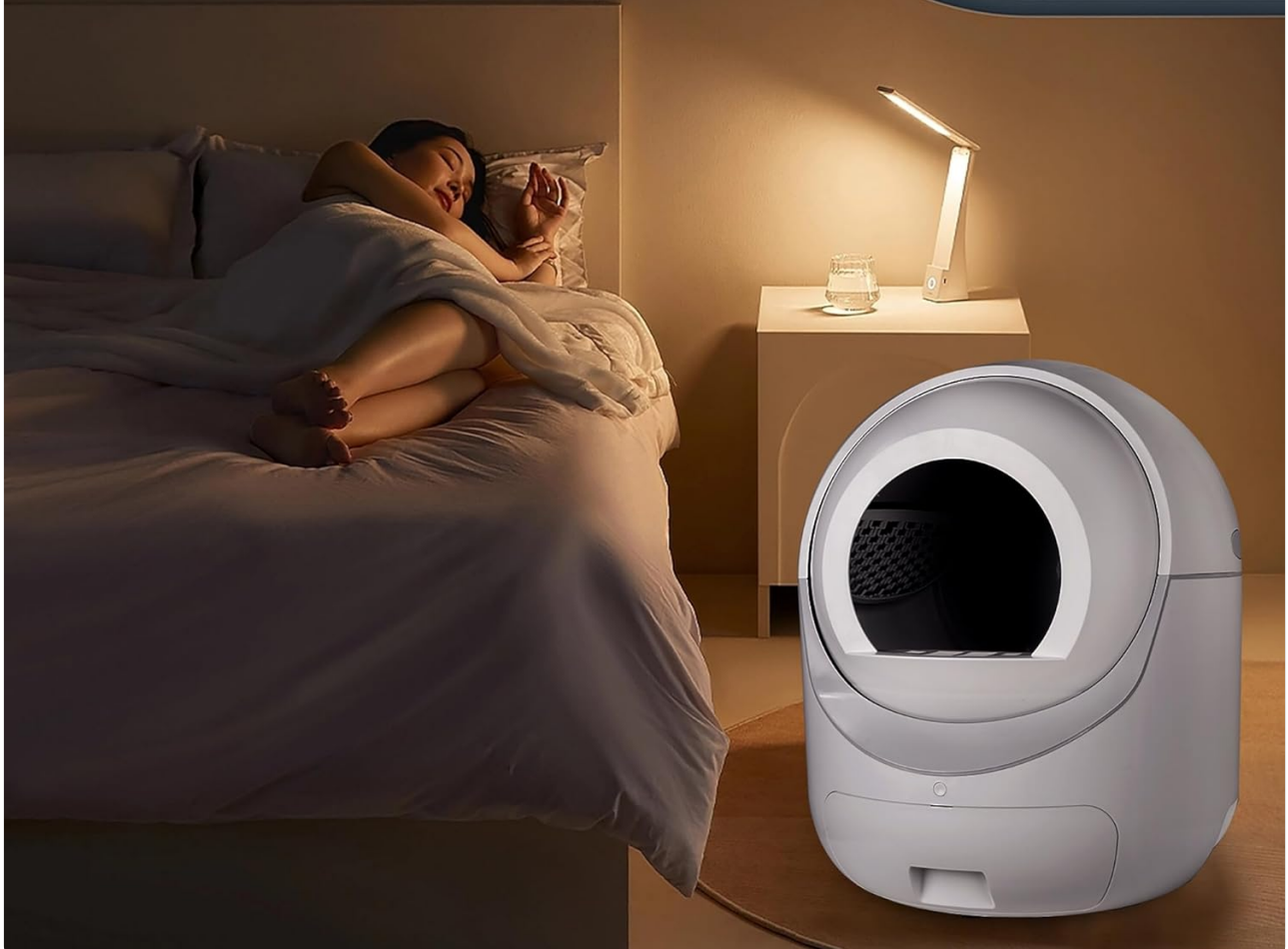
Figure 7: Quiet operation.