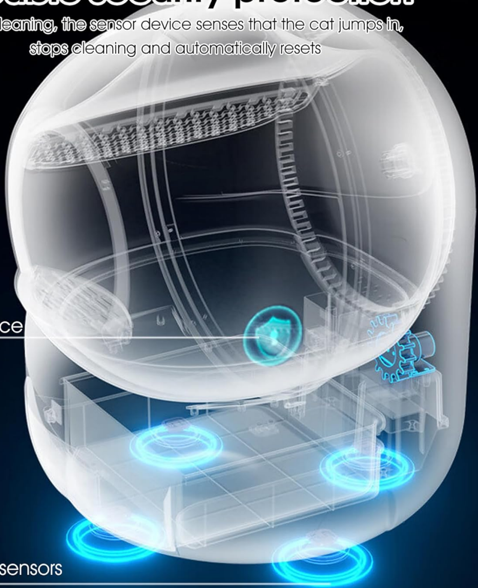
Figure 3: Internal safety mechanisms.