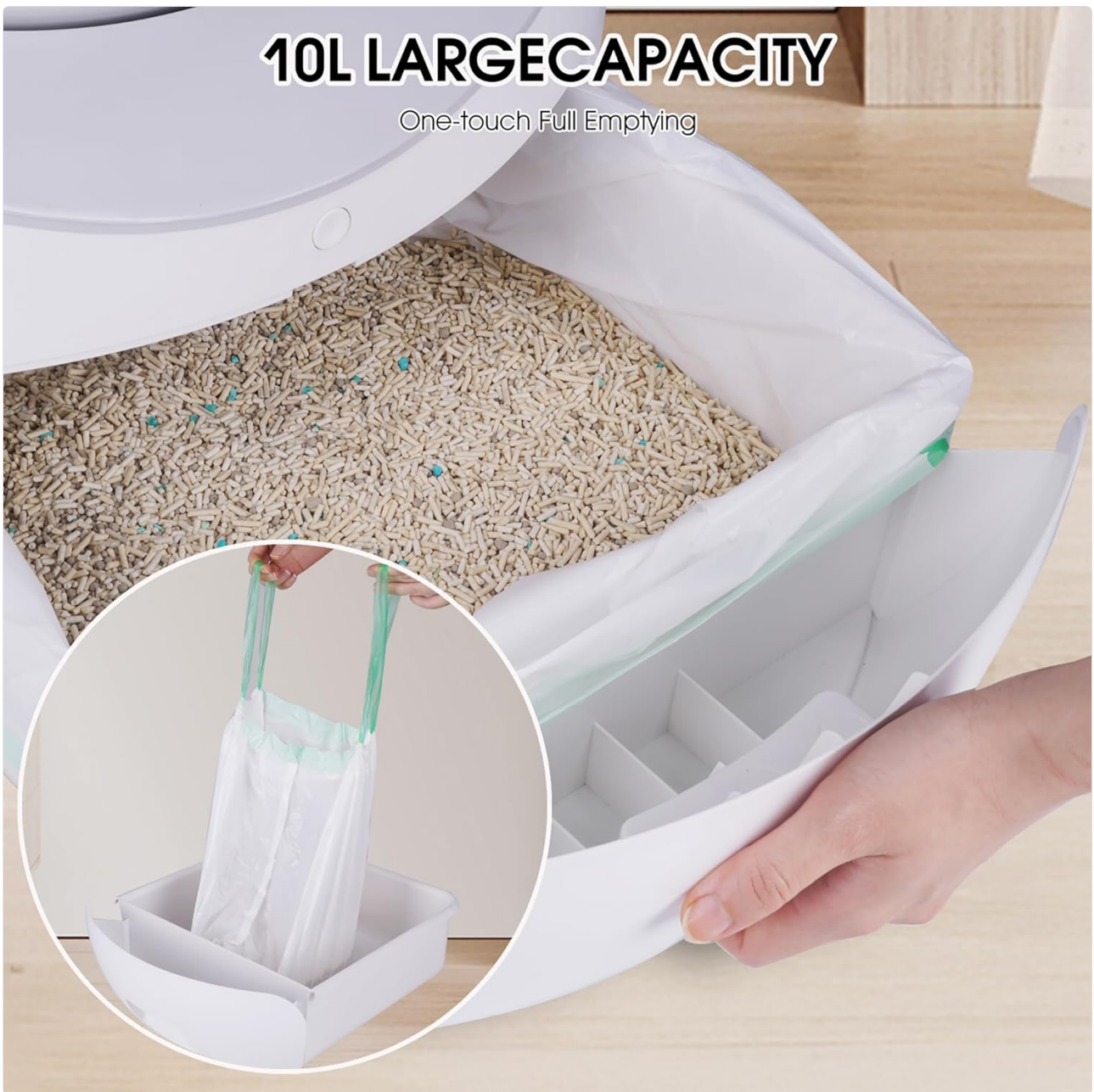
Figure 6: Easy waste disposal.