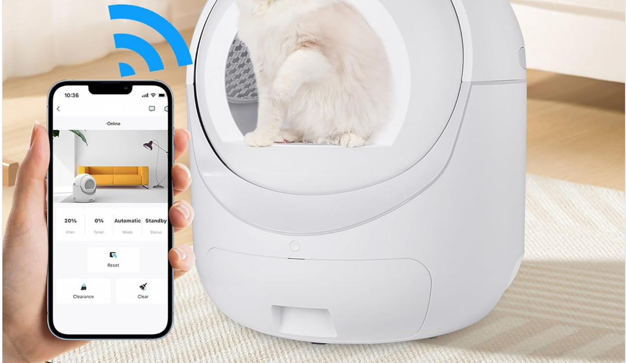
Figure 2: WiFi connectivity and app control.