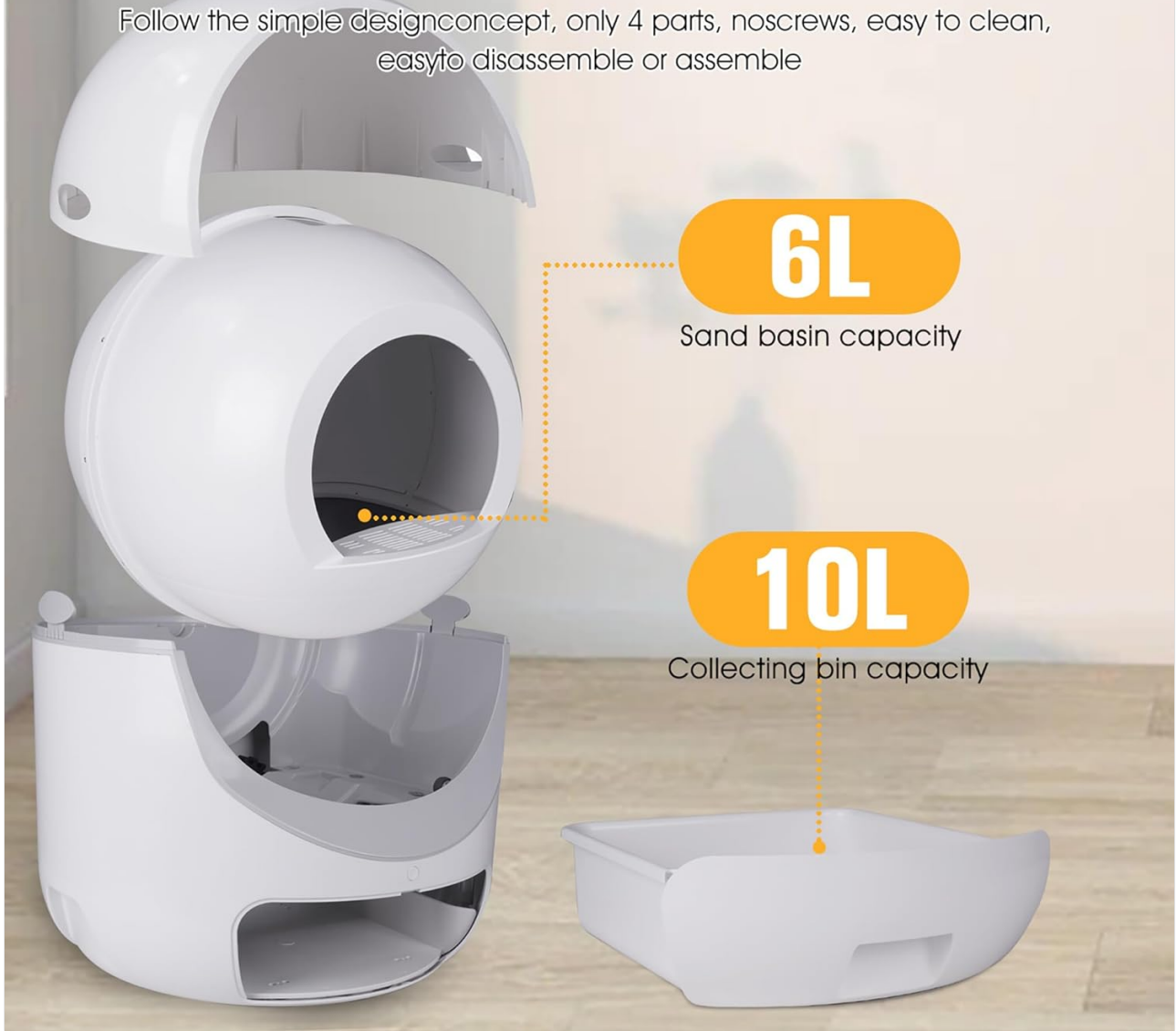
Figure 4: Litter and waste capacity.

Follow the simple design concept, only 4 parts, no screws, easy to clean, easy to disassemble or assemble