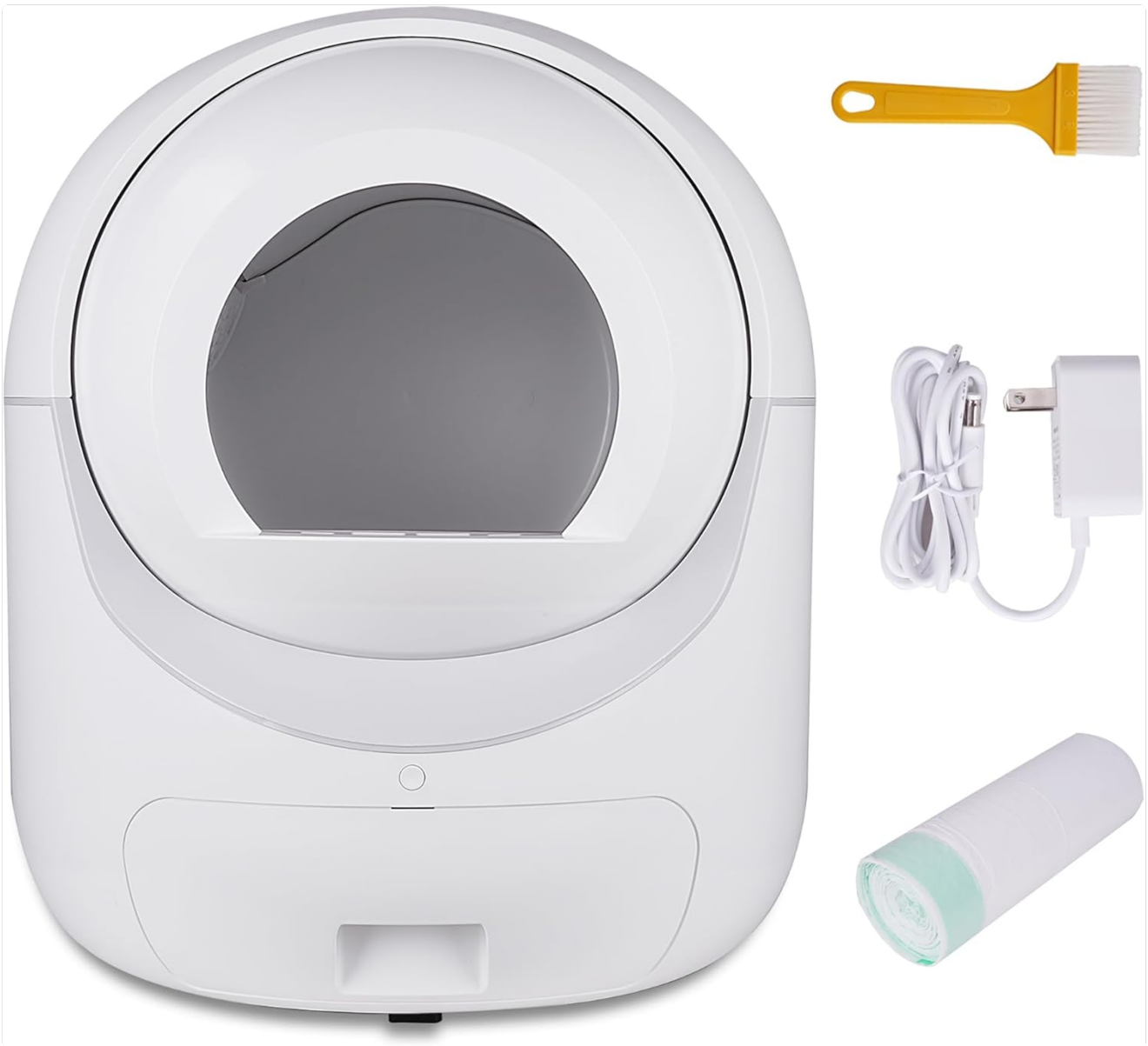
Figure 1: Smart Self-Cleaning Automatic Cat Litter Box and accessories.