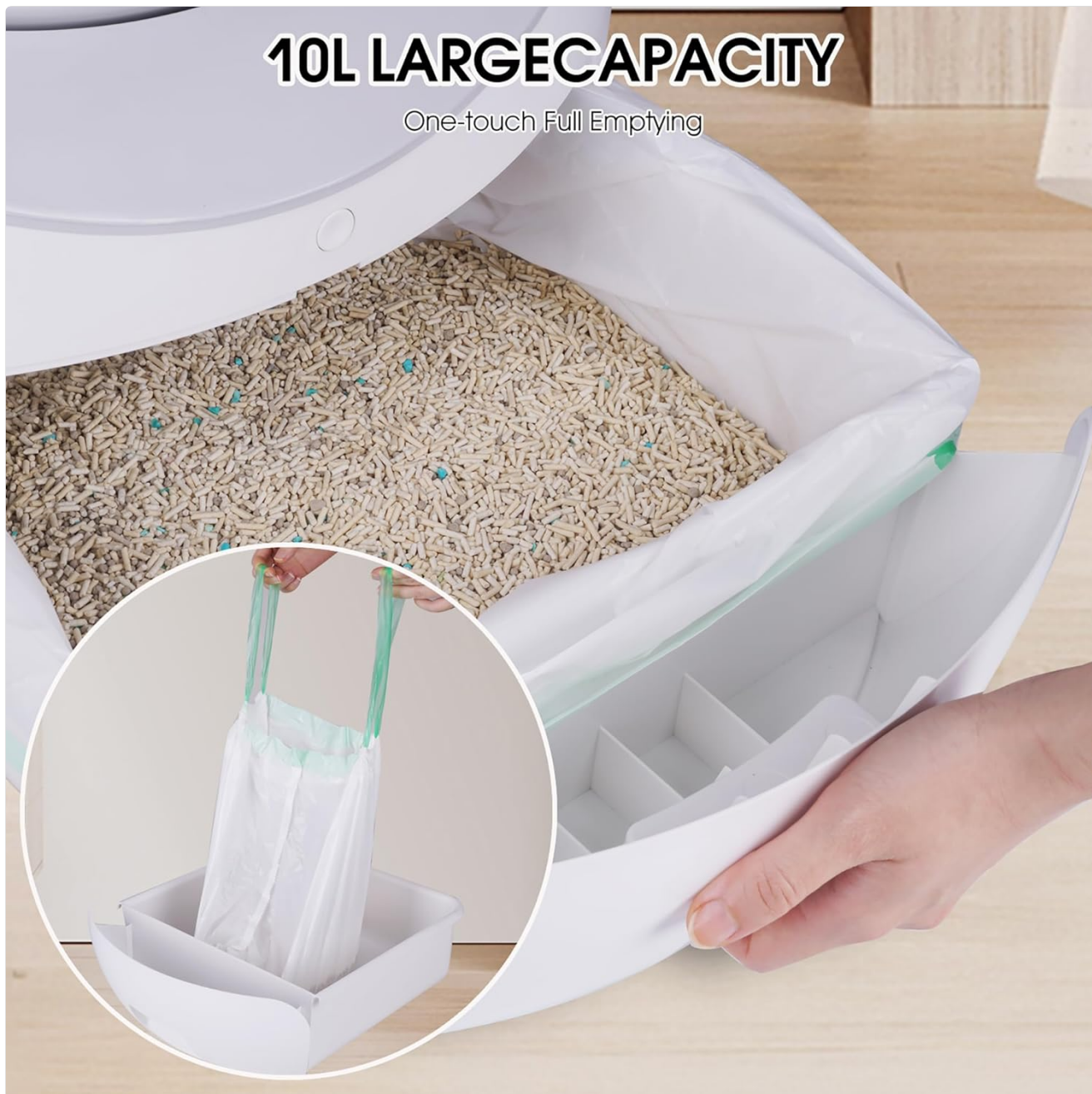
Figure 9: Emptying the waste drawer.