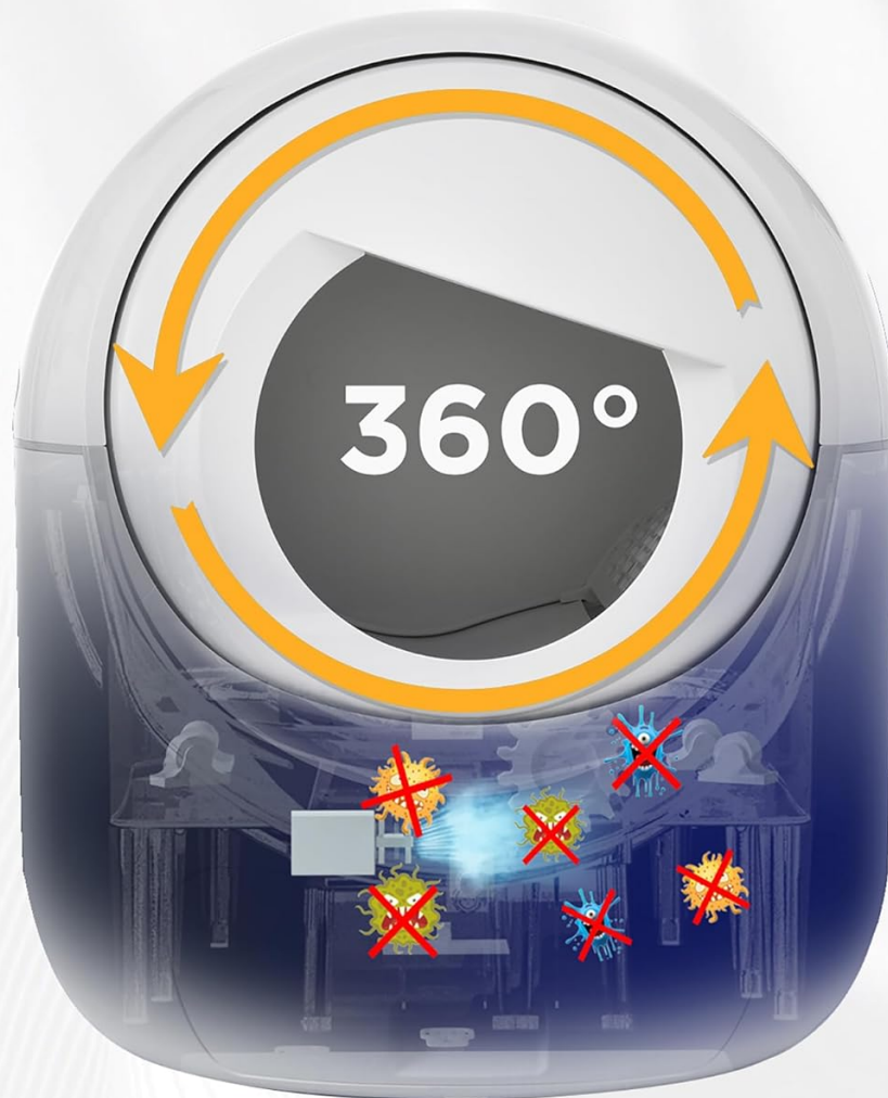
Figure 5: Automatic cleaning and odor removal process.

The cat is automatically cleaned up after it leaves