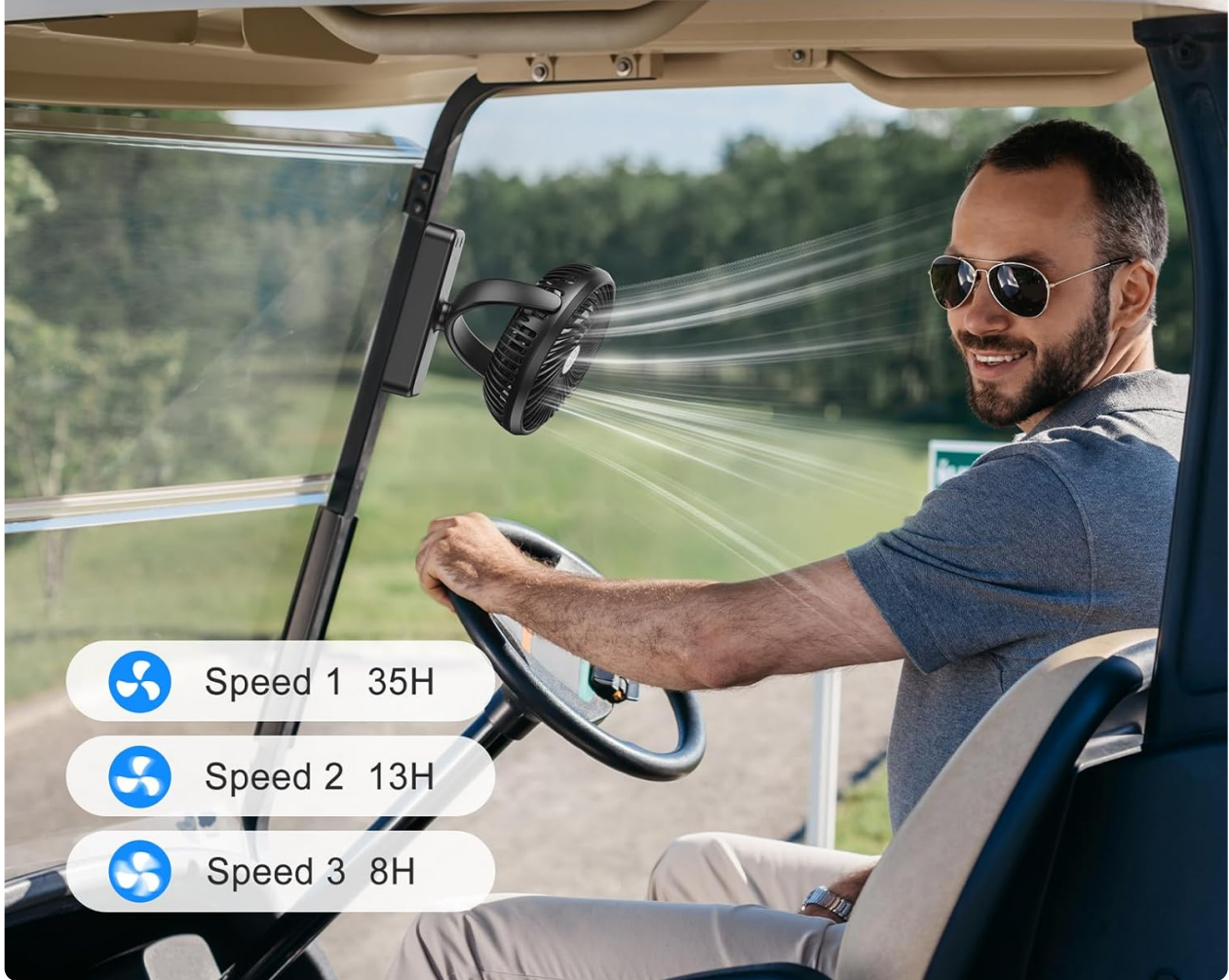
Image 3: The fan attached to a golf cart, highlighting its 10000mAh battery life across different speeds (35H on Speed 1, 13H on Speed 2, 8H on Speed 3).