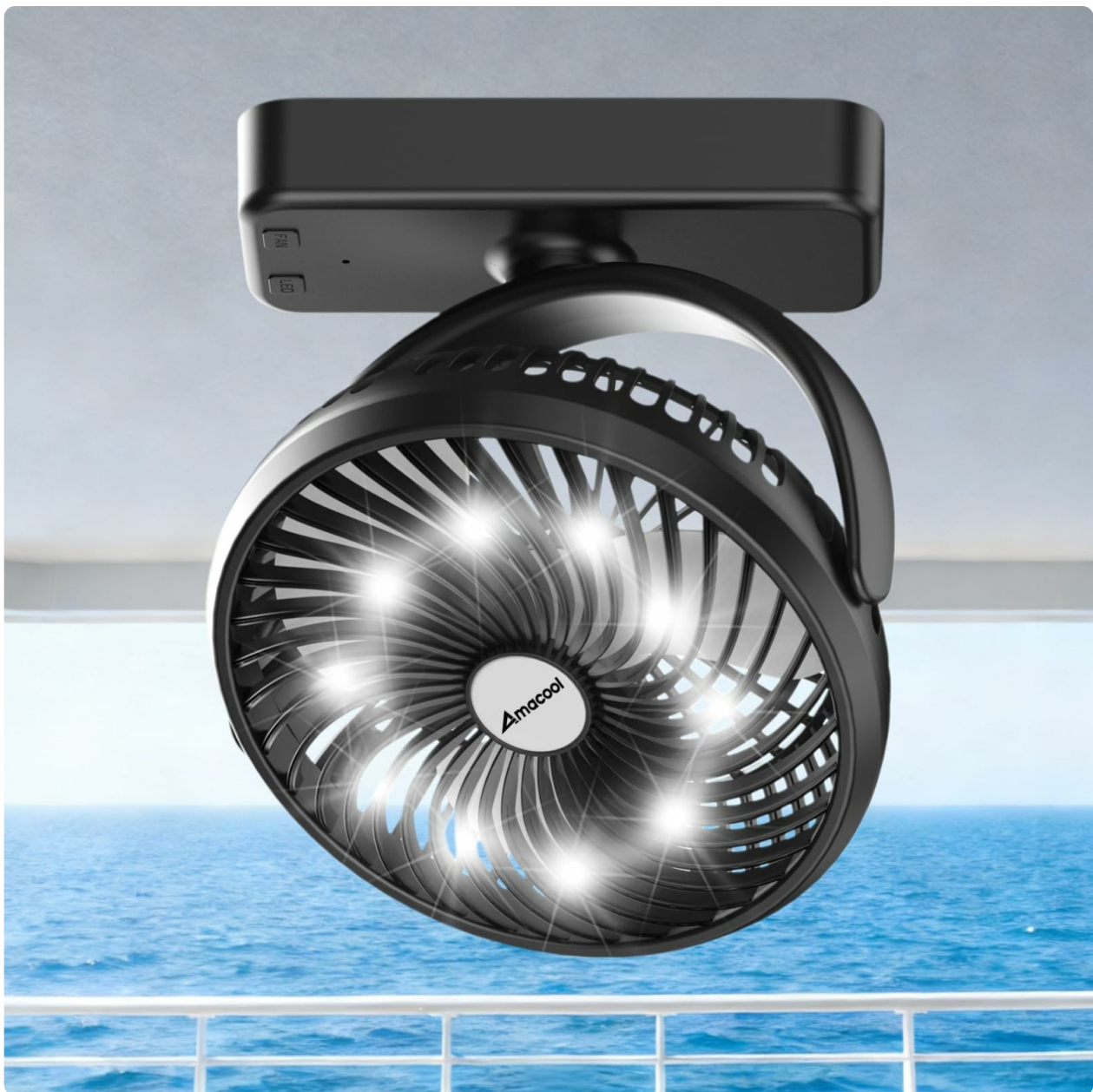
Image 1: The AMACOOOL F320S Magnetic Portable Fan in its compact form.