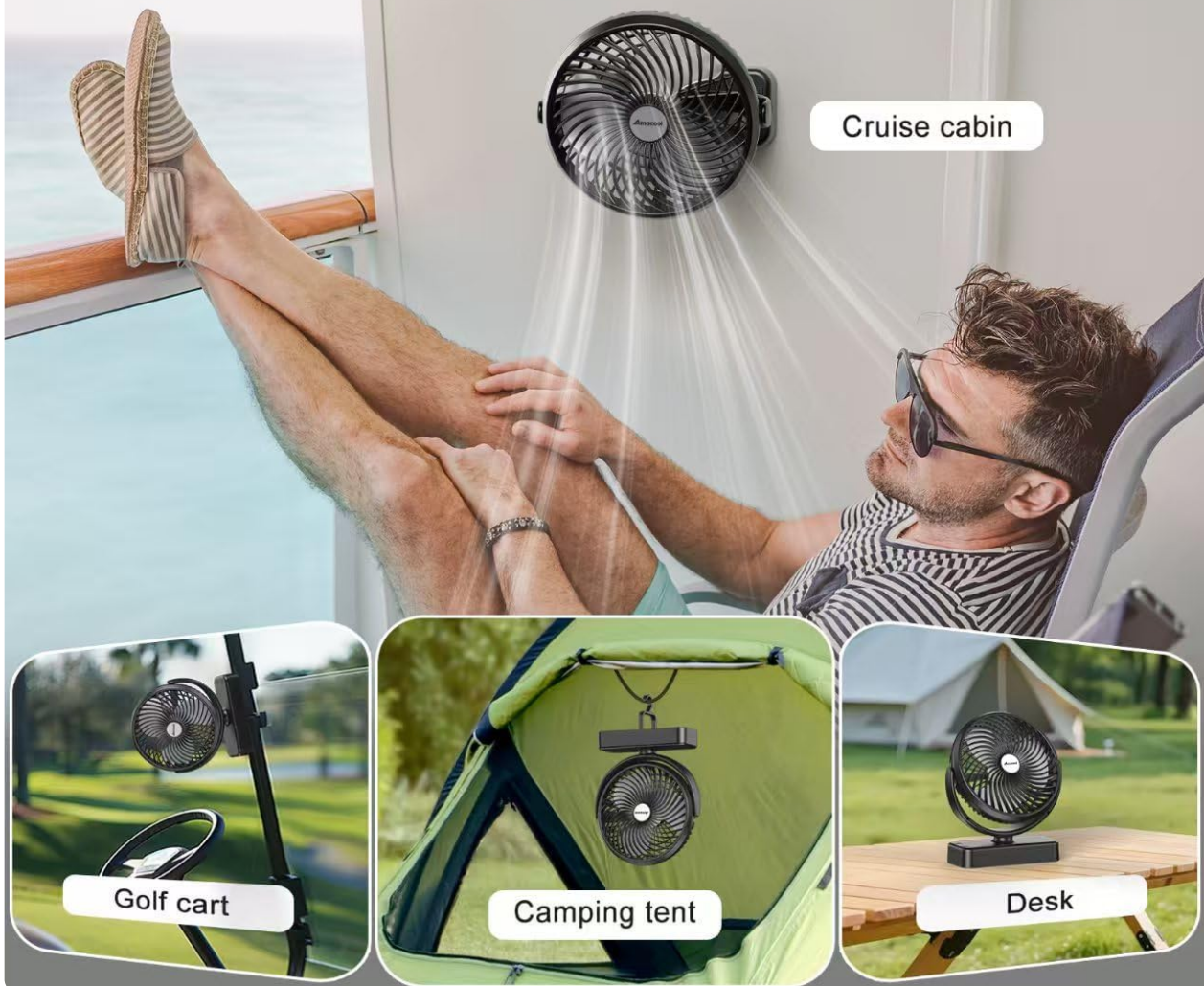
Image 6: The fan's versatile usage options: magnetically attached in a cruise cabin, on a golf cart, hanging in a camping tent, and standing on a desk.

Magnet, Hang, Stand. Fits any cooling needs