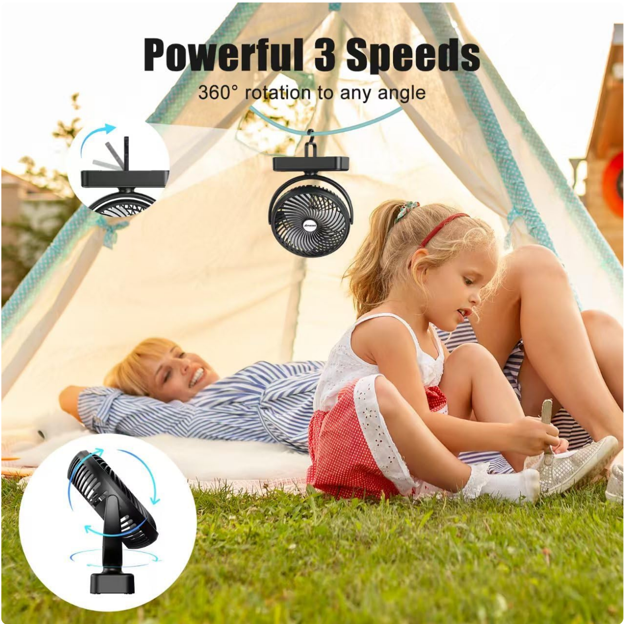
Image 4: The fan demonstrating its powerful 3 speeds and 360-degree rotation, shown standing and hanging inside a camping tent.