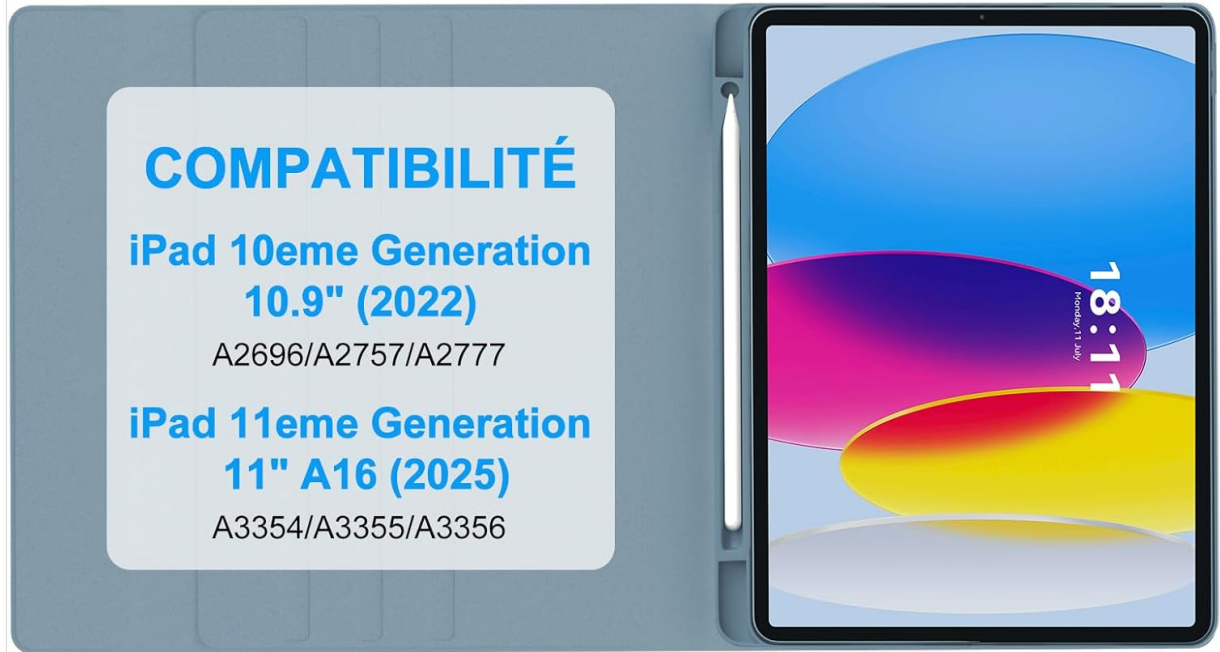
Image 1.1: Compatibility information for iPad 10th and 11th Generation models.