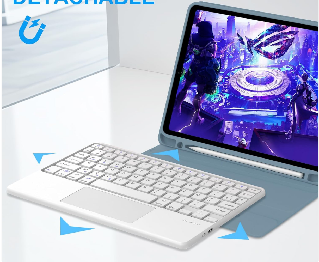
Image 2.1: The keyboard magnetically attaches to the case and can be detached for flexible use.