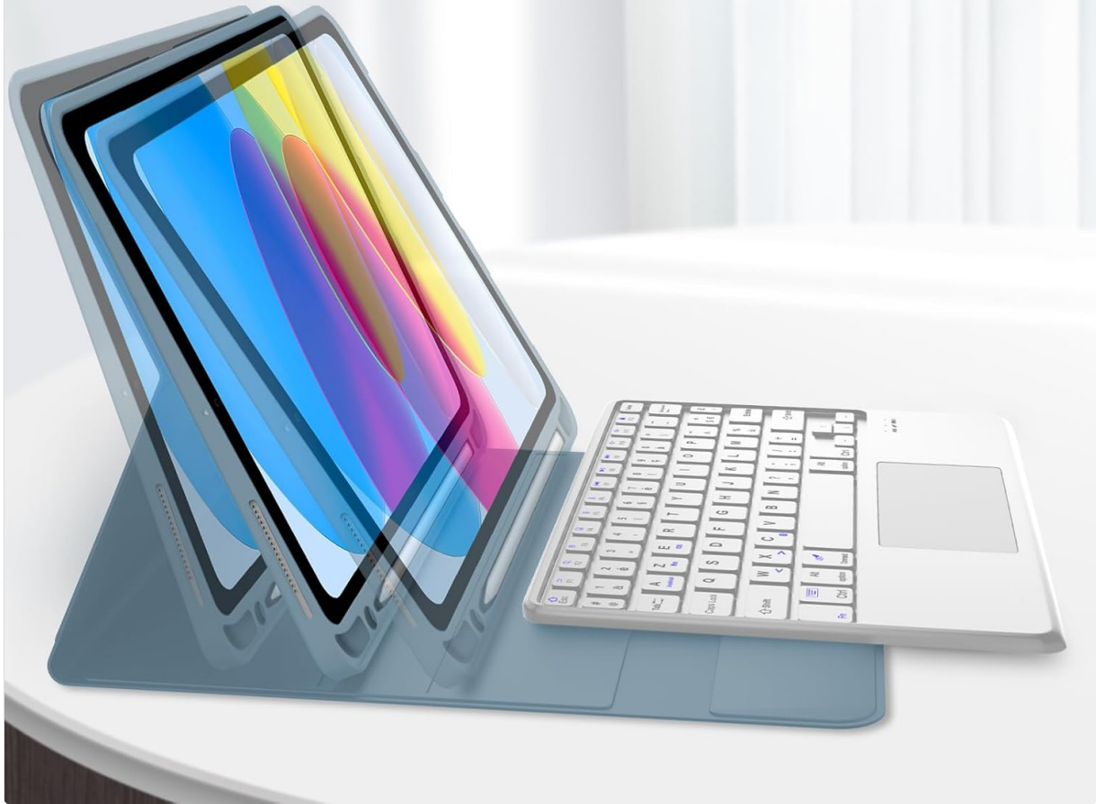
Image 3.2: Adjust the iPad to your preferred viewing angle using the built-in grooves.

Réglable sur trois angles de vision confortables