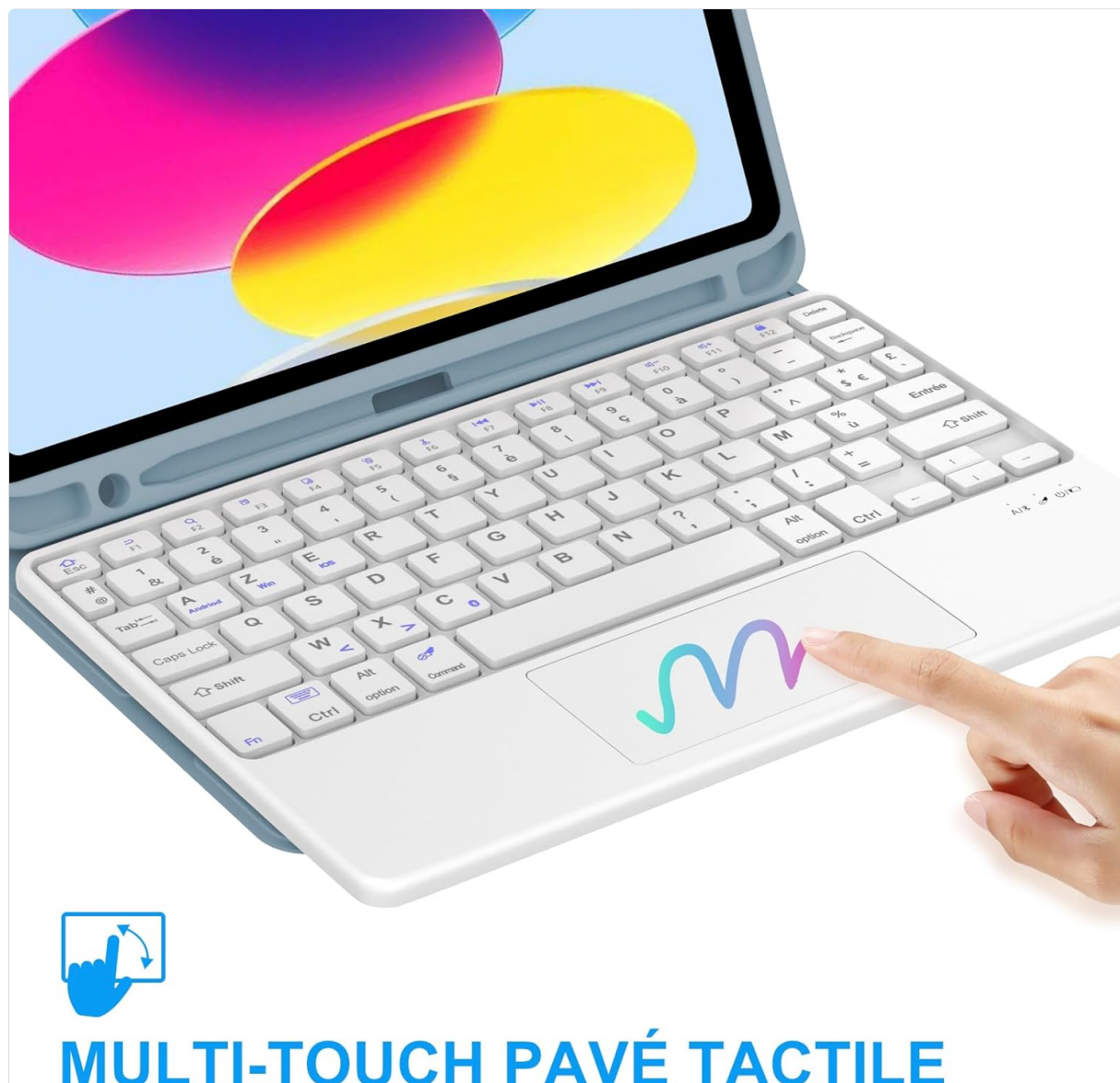
Image 3.1: The multi-touch trackpad allows for precise navigation and gesture control.