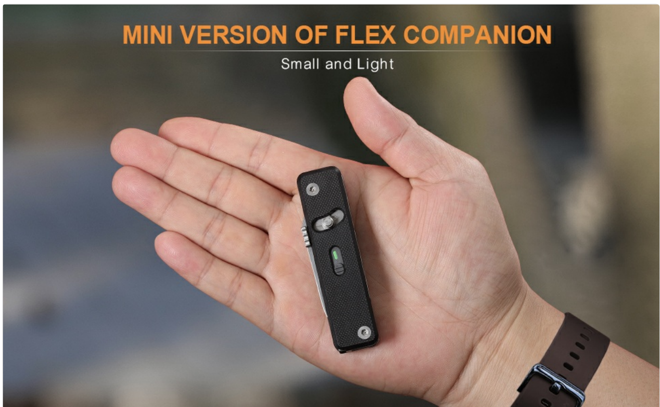
Figure 1: The ROXON S504G Mini Flex Companion in its closed, compact form.

The ROXON S504G Mini Flex Companion is a compact and versatile 7-in-1 multitool designed for everyday carry. It features a modular design allowing for tool customization to suit various needs. This manual provides essential information for the safe and effective use, maintenance, and care of your multitool.