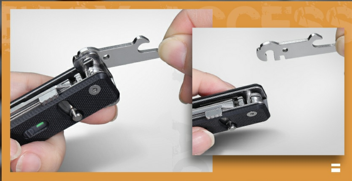
Figure 8: Simple tool swapping process.

Customization has never been easier – swap out or replace implements with ease to suit your specific needs.