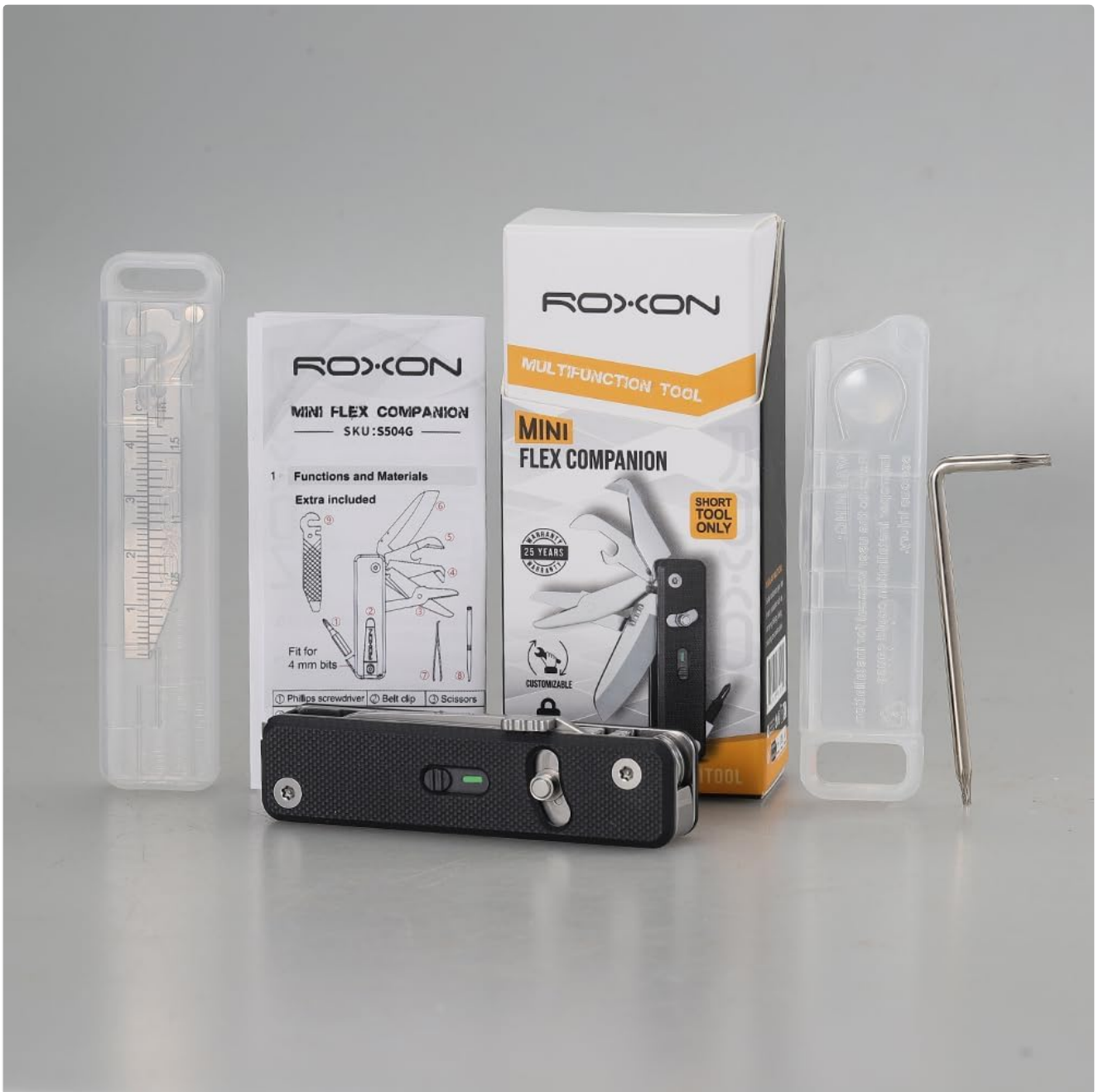
Figure 3: Included components in the ROXON S504G Mini Flex Companion package.