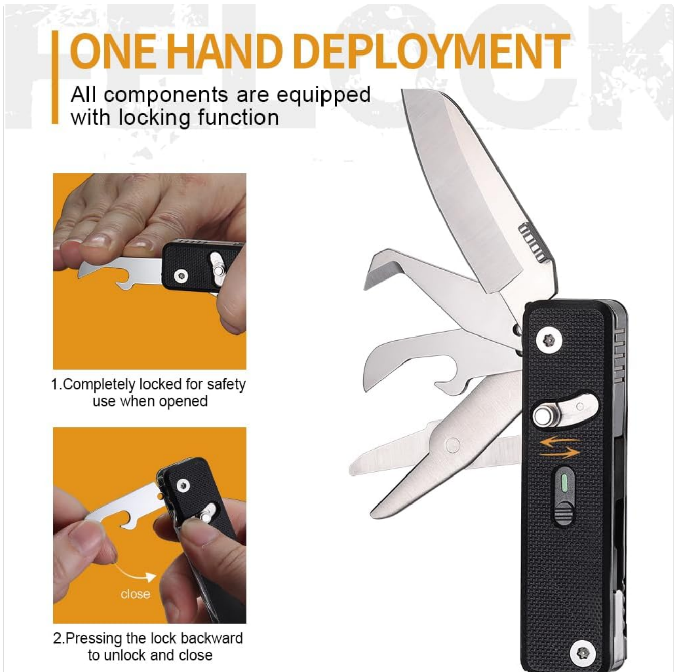
Figure 4: One-hand deployment and locking mechanism for tools.

To close a tool, press the lock backward (as indicated by the arrow on the lock mechanism) and fold the tool back into the body of the multitool.