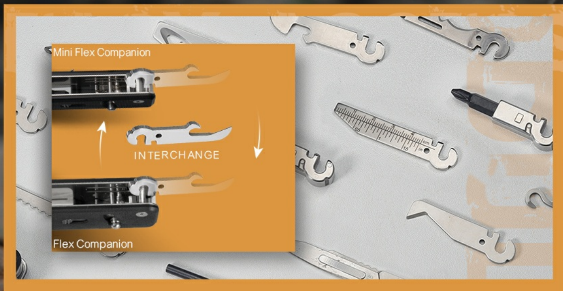
Figure 9: Modular design and tool compatibility.

With the exception of the 4mm Bit Adaptor(Magnetic), all small implements are fully compatible with the Flex Companion, allowing for seamless integration and customization.