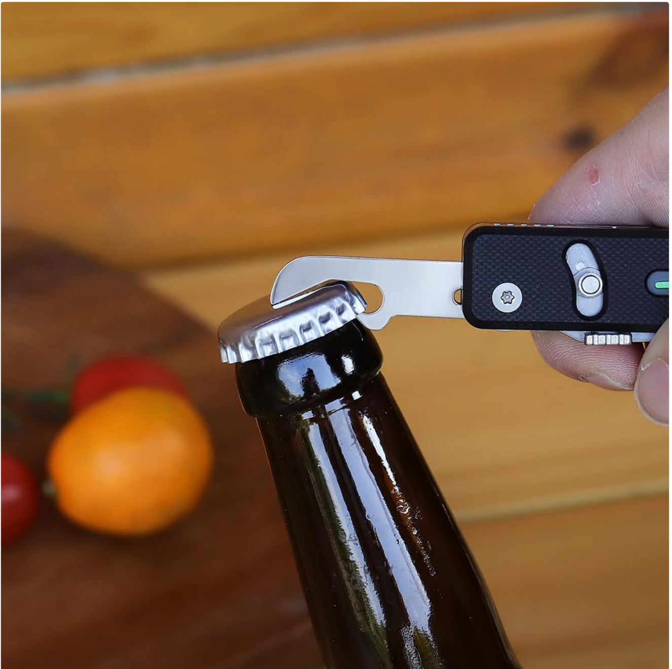
Figure 7: Using the bottle opener.