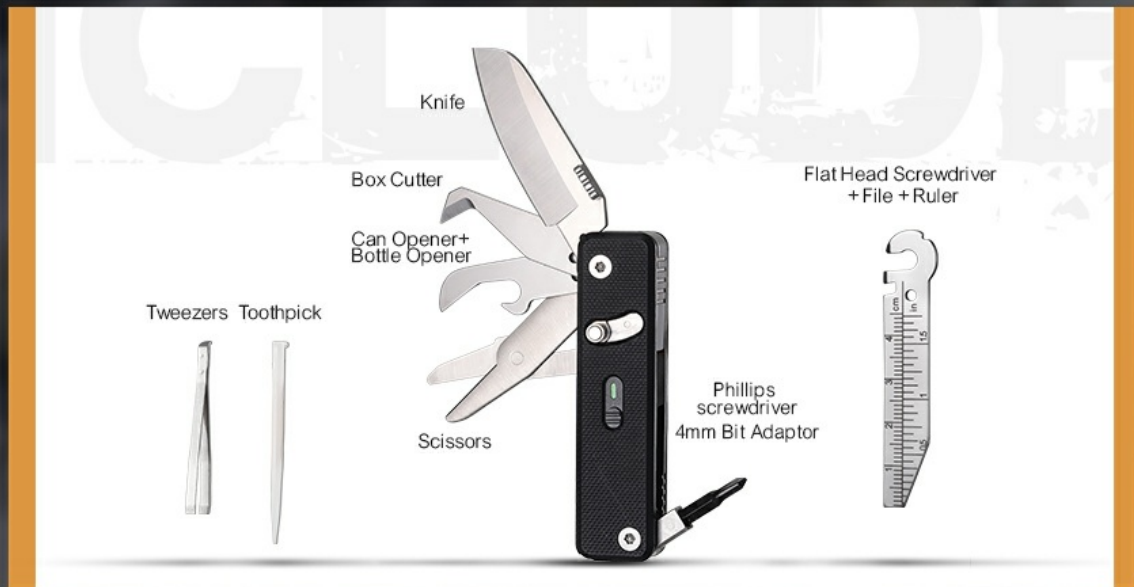
Figure 5: Overview of pre-installed and bonus tools.

Comes with 7 pre-installed tools and 1 additional tool, giving you even more versatility right out of the box. (4mm Bit Adaptor can not be replaced, bit and other tools are changeable.)