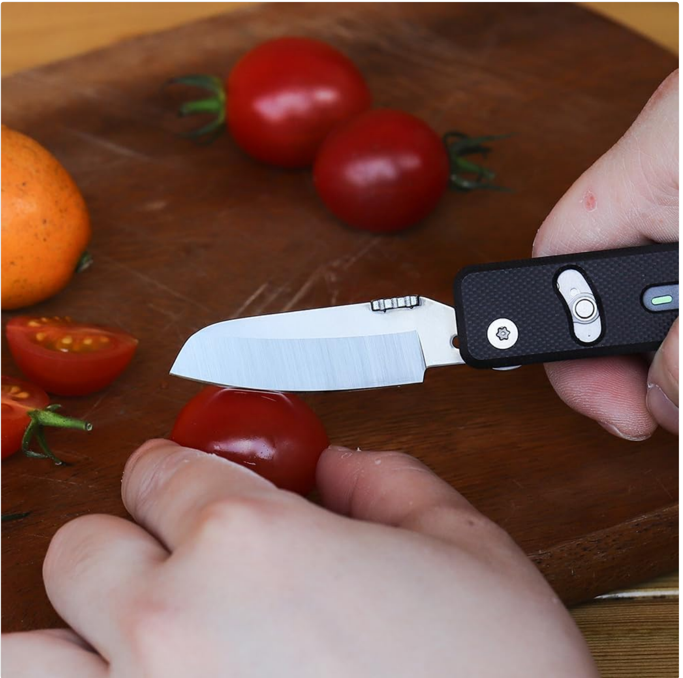
Figure 6: Using the sheepfoot blade for cutting.