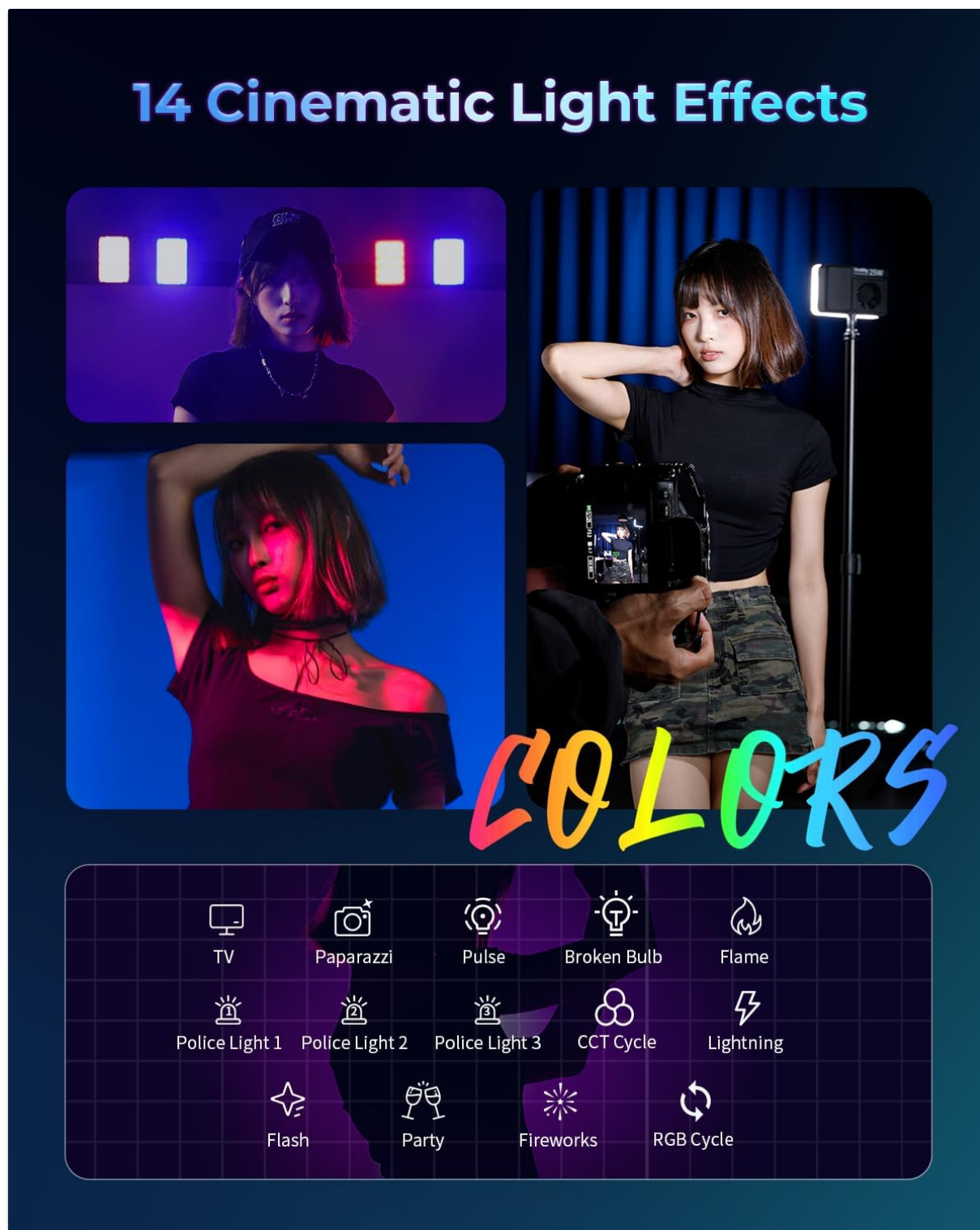
Image: Examples of the 14 cinematic lighting effects available on the RM 25C, including TV, Paparazzi, Pulse, Broken Bulb, Flame, Police Light, CCT Cycle, Lightning, Flash, Party, Fireworks, and RGB Cycle.

effects. Press the knob to confirm selection or adjust effect parameters if available.