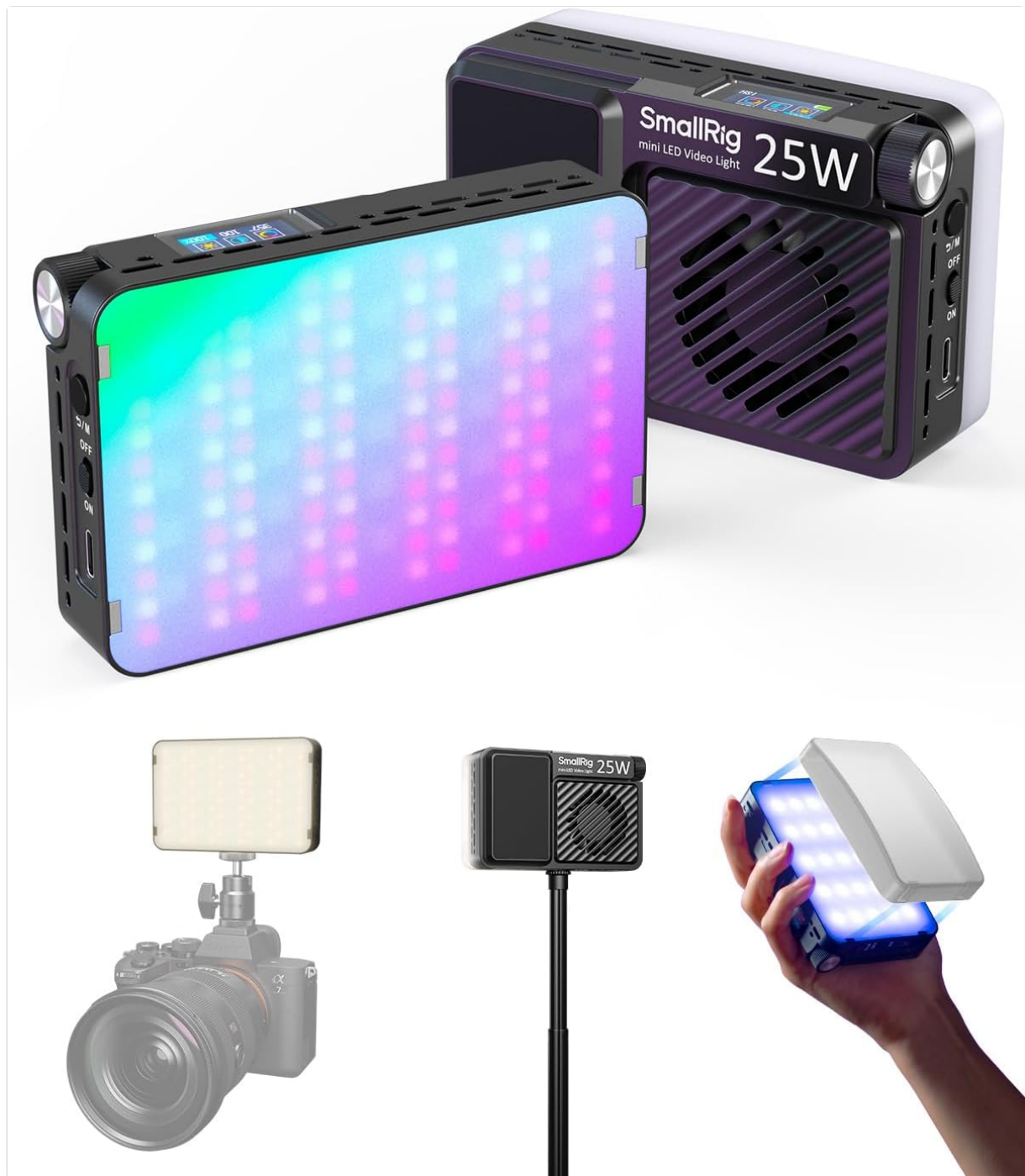
Image: The SmallRig RM 25C Mini LED RGB Video Light shown with its magnetic diffuser and examples of camera and stand mounting.