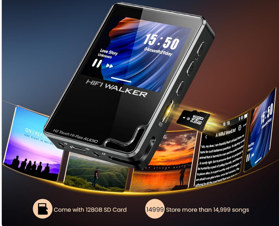
Image: The HIFI WALKER H2 Touch displaying its expandable storage capability, showing a microSD card being inserted into the slot, supporting up to 512GB.

Built-in Micro SD card Slot allows you to expand storage at will