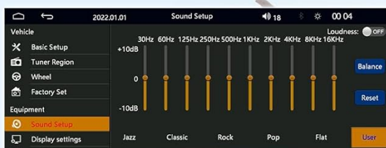
Image: Displays the Bluetooth 5.2 interface on the CAMECHO Car Radio, showing connection status and options for music playback. Also includes visuals for FM Radio and EQ settings.