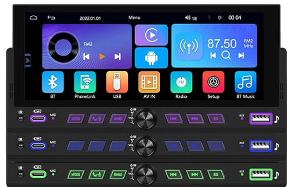
Image: Displays the 'Colorful Lantern' feature of the CAMECHO Car Radio, showing a spectrum of colors available for the unit's LED lighting and how it appears on the main menu.