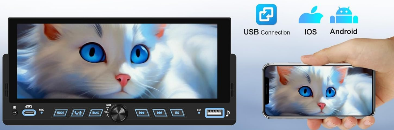
Image: Illustrates the Mirror Link feature for both iOS and Android devices, showing a smartphone screen mirrored onto the car radio display via USB connection.