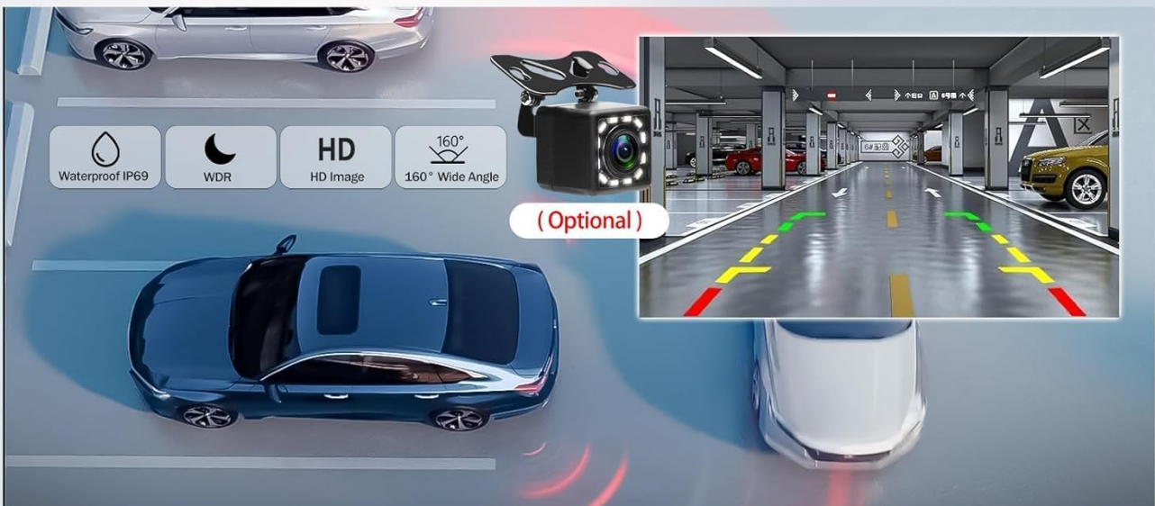
Image: Illustrates the back-up camera input feature, showing a simulated view from a rear camera on the car radio display with parking guidelines. It indicates that the camera is optional.