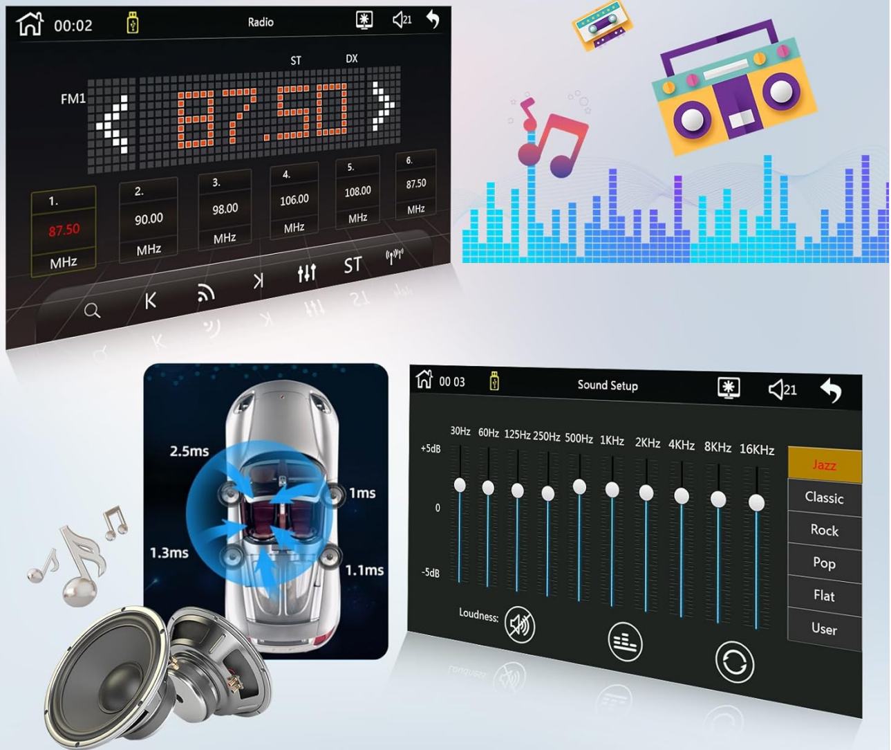
Image: Displays the EQ (Equalizer) settings interface on the CAMECHO Car Radio, showing adjustable frequency bands and various sound presets like Jazz, Classic, Rock, Pop, Flat, and User.