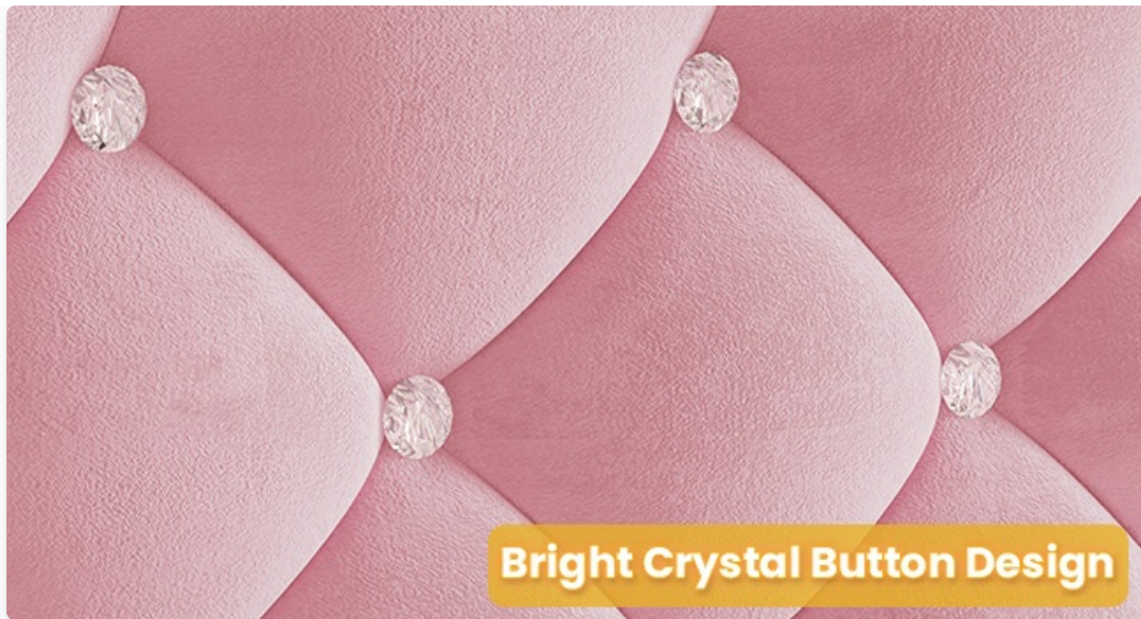
Image: Close-up of the soft velvet fabric and crystal button design on the headboard, emphasizing the material's texture.