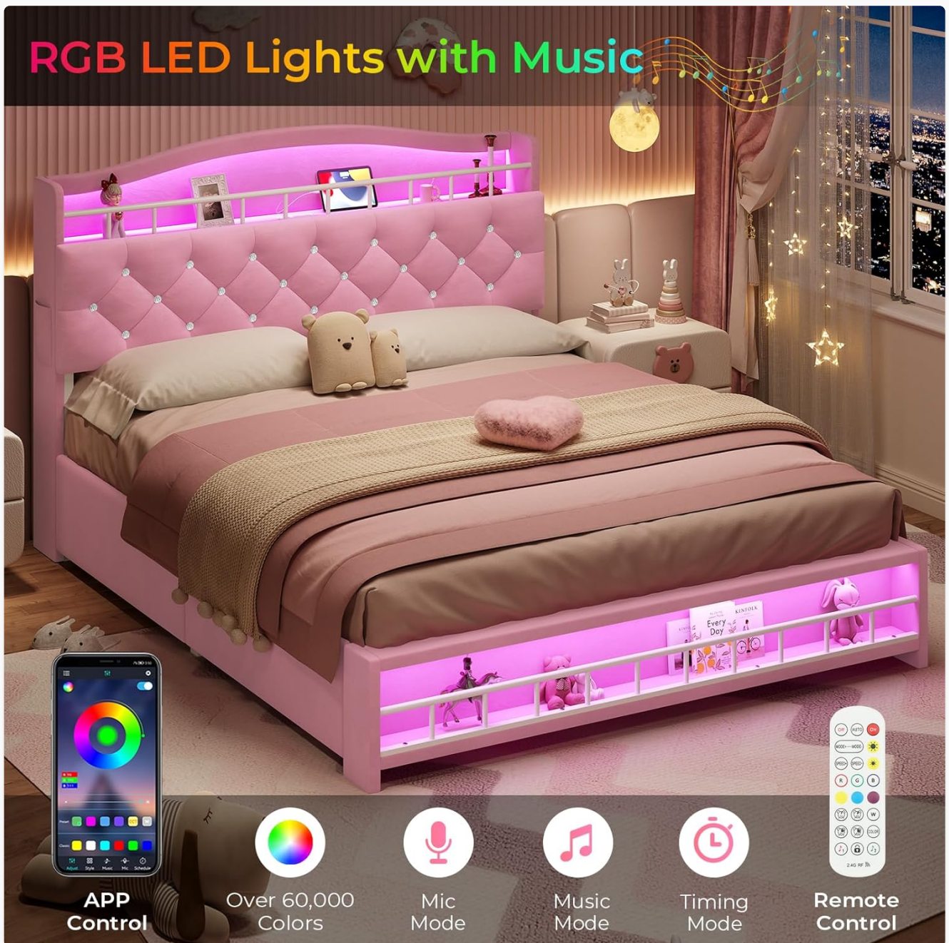
Image: The bed frame illuminated by RGB LED lights, with icons indicating APP control, remote control, various colors, mic mode, music mode, and timing mode.