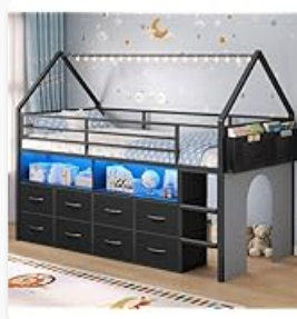
Image: Diagram highlighting the 9 load-bearing legs and 12 heavy-duty metal slats for optimal support and force