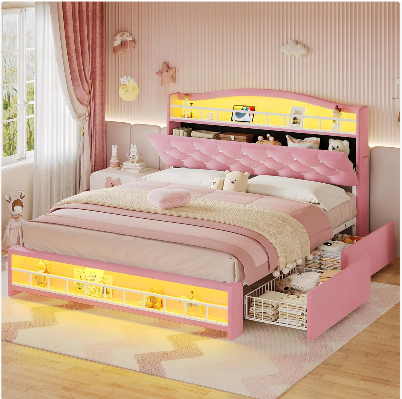
Image: The BTHFST Full Bed Frame in pink, showcasing the storage headboard, LED lights, and under-bed drawers.