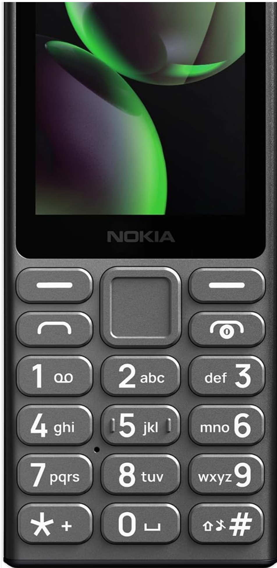
Image: Front view of the Nokia 110 4G, highlighting the screen and physical keypad for navigation.