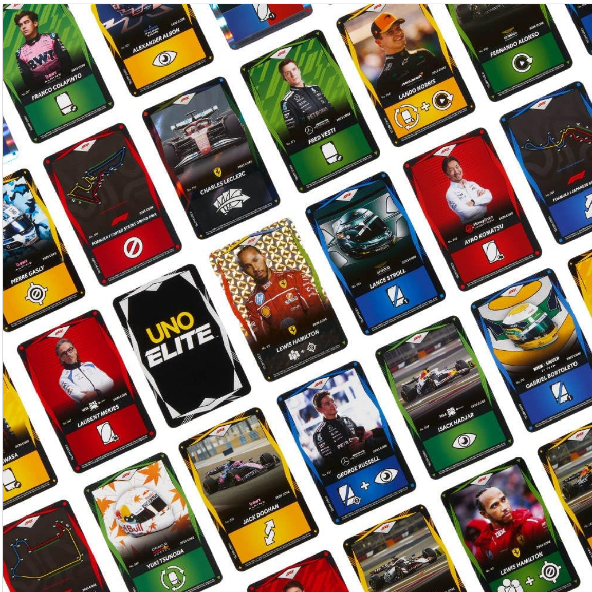
An overhead view of multiple Elite Action Cards spread out, illustrating the variety of Formula 1 themed designs including drivers, vehicles, and track layouts.