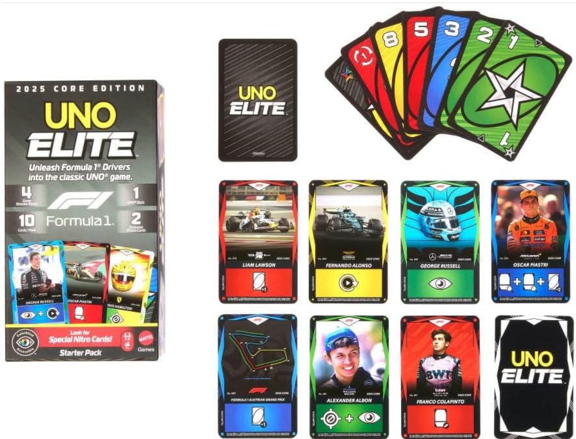
A visual representation of the game components, including the game box, a hand of classic UNO cards, and several Elite Action Cards featuring Formula 1 drivers and cars.