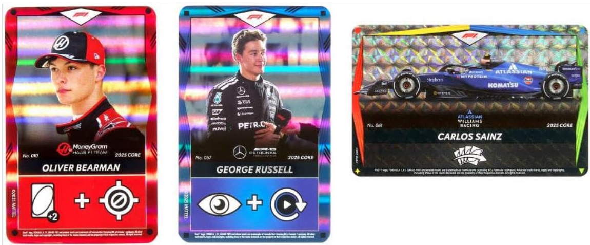
Close-up view of three Elite Action Cards, showcasing detailed artwork of Formula 1 drivers and a racing car, each with unique game icons.