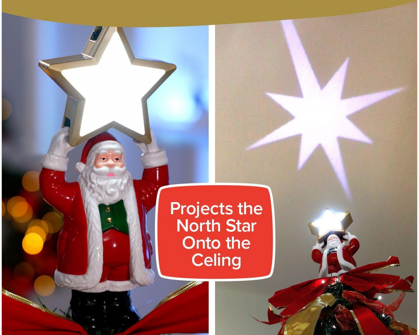
Image: Close-up of the Santa tree topper with a star projector, casting a star pattern onto the ceiling.

Your browser does not support the video tag.