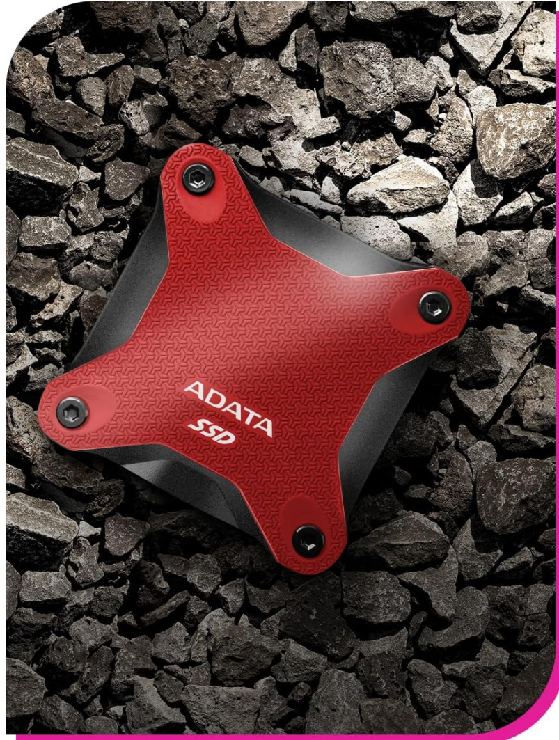
Image 2.1: The ADATA SD620 External SSD, included with your desktop.