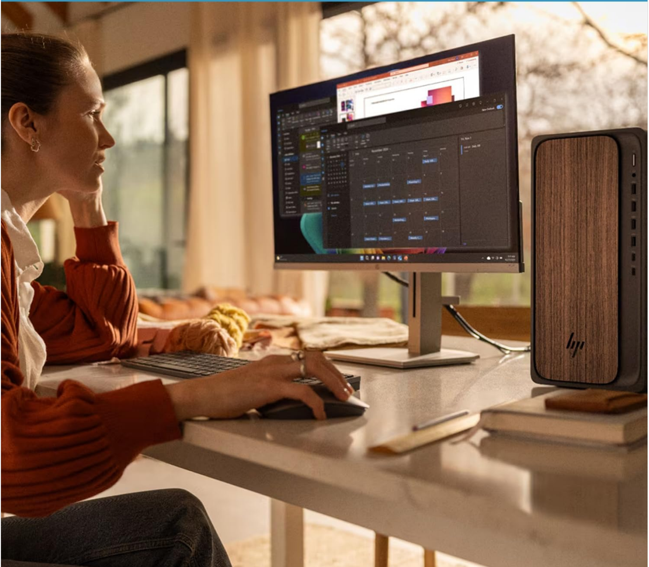
Image 4.1: User interacting with the HP OmniDesk M03-0000t Desktop PC.