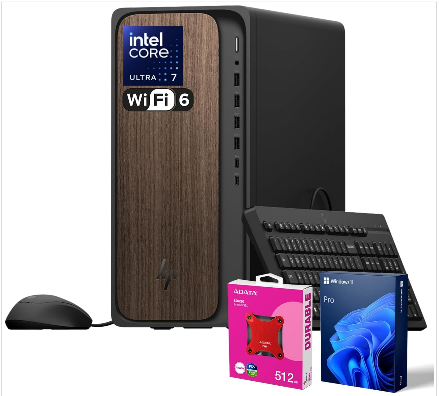
Image: The HP OmniDesk M03 Desktop PC, shown with its wired keyboard, mouse, and the bundled ADATA 512GB external SSD. The desktop features a sleek black chassis with a wood-grain front panel.