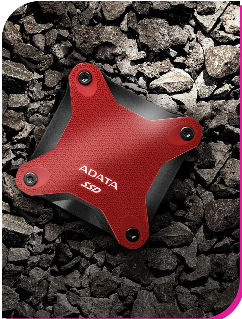
Image: The ADATA SD620 External SSD, available in red and black, emphasizing its features such as rapid data transfer, MIL-STD shock resistance, and multi-platform compatibility. This external drive is included with your HP OmniDesk M03.