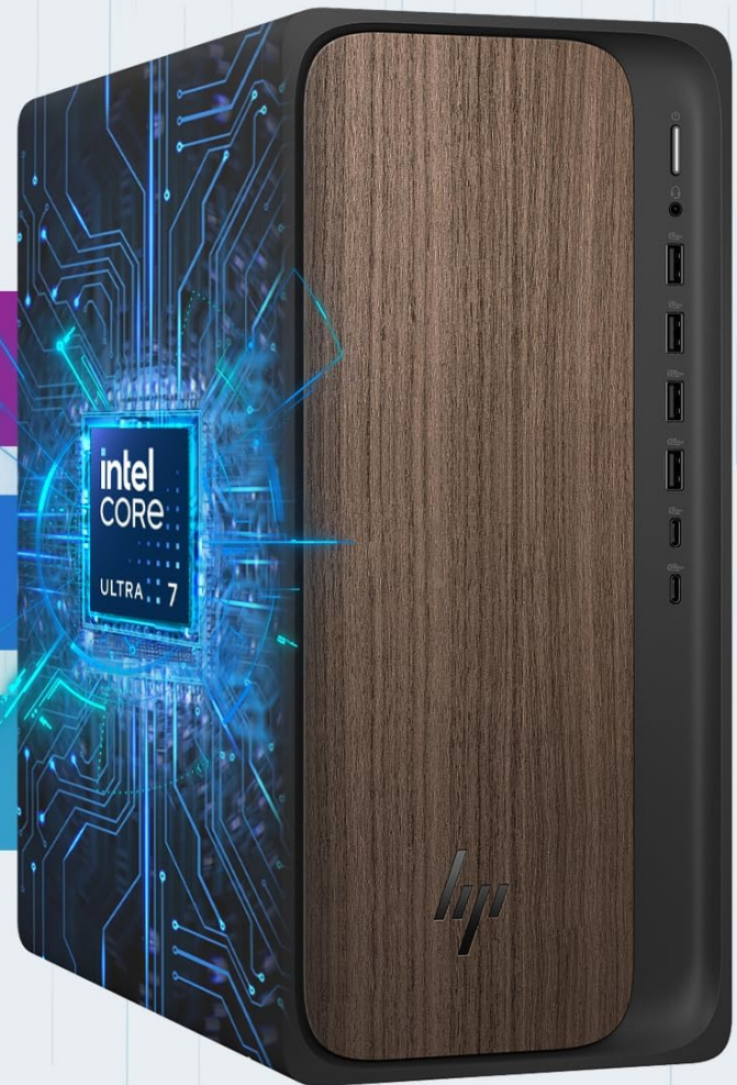
Image: A visual representation of the Intel Core Ultra 7 processor, detailing its 20 cores (8 performance, 12 efficient), 20 threads, 30 MB L3 Cache, and a maximum turbo frequency of 5.3 GHz, emphasizing its built-in AI capabilities.