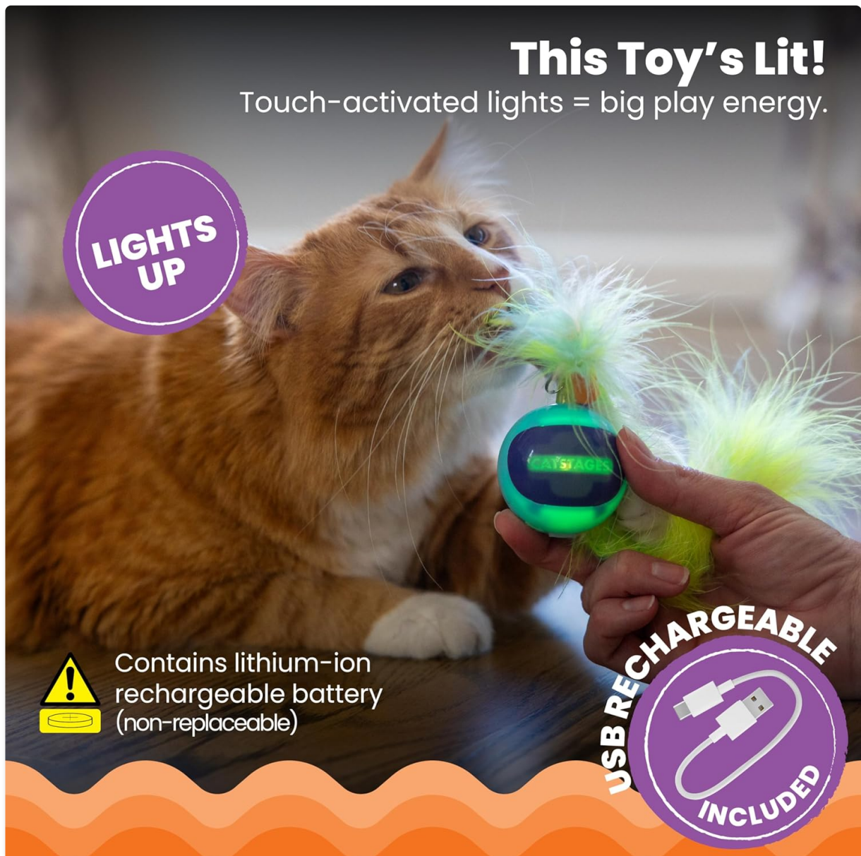
Image: A hand holding the Catstages Roll & Chase Robot Toy, which is lit up with green LEDs, next to a USB charging cable. This illustrates the toy's rechargeable nature.