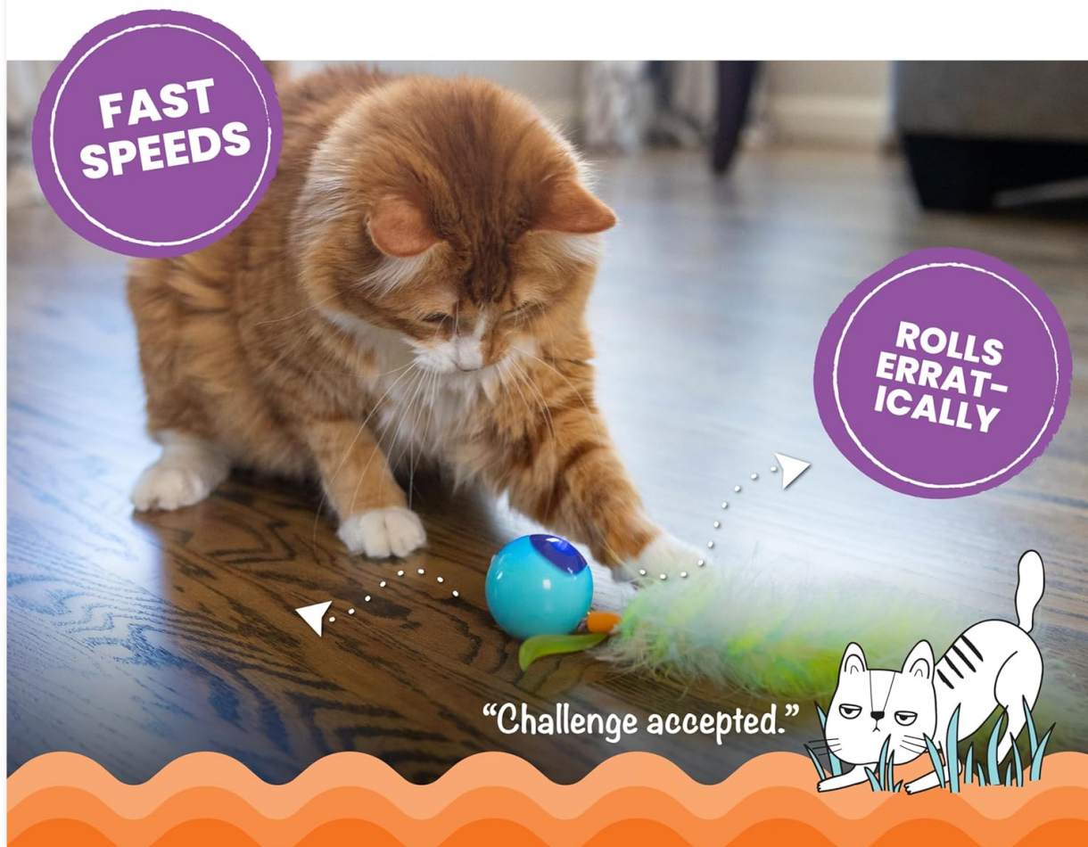
Image: An orange cat intently watching the Catstages Roll & Chase Robot Toy as it moves across a wooden floor, illustrating its erratic motion.

Rolls, stops, switches directions, rolls again.