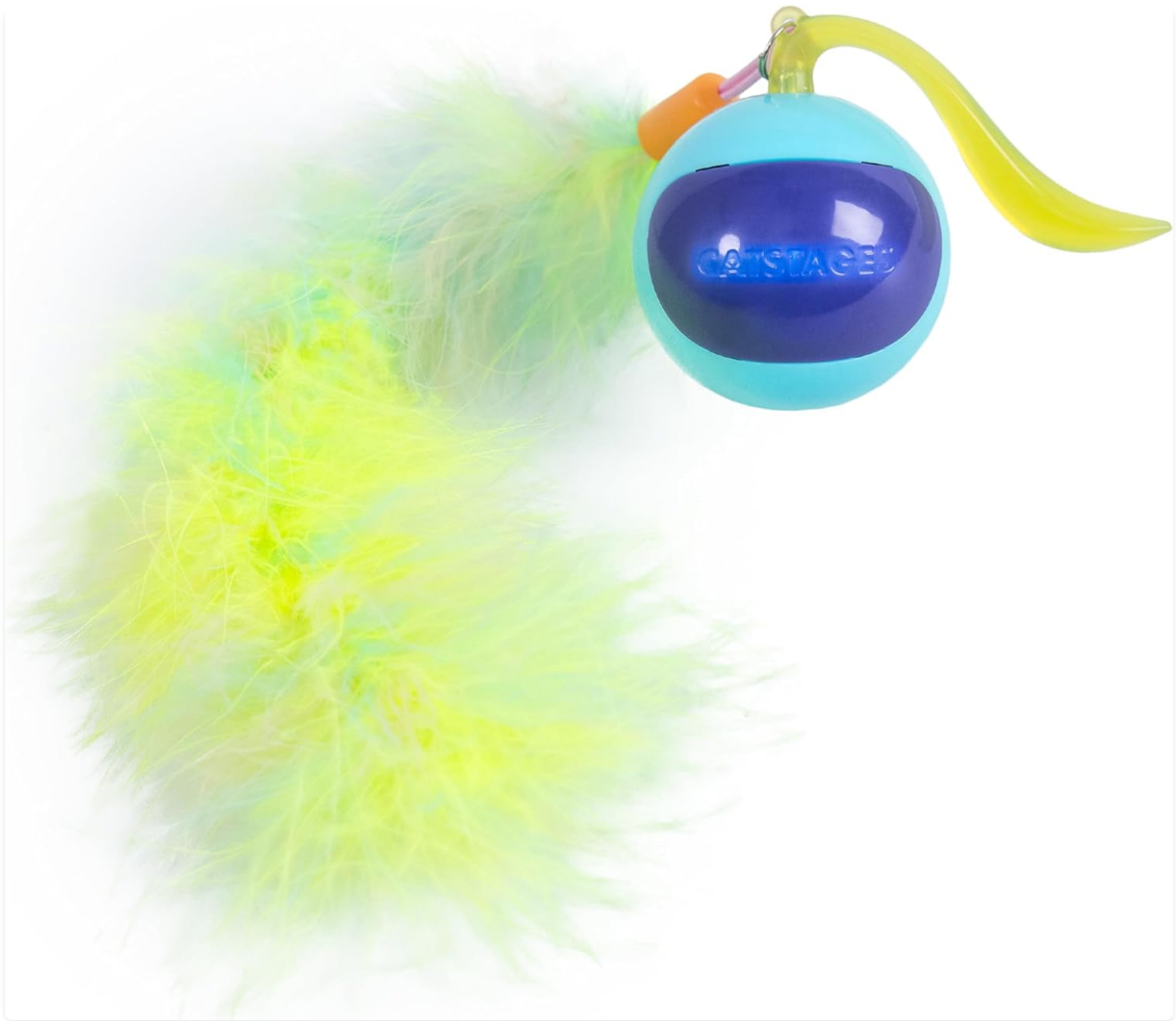
Image: The Catstages Roll & Chase Robot Toy, a blue and purple spherical robot with a long, fluffy yellow-green feather tail attached.