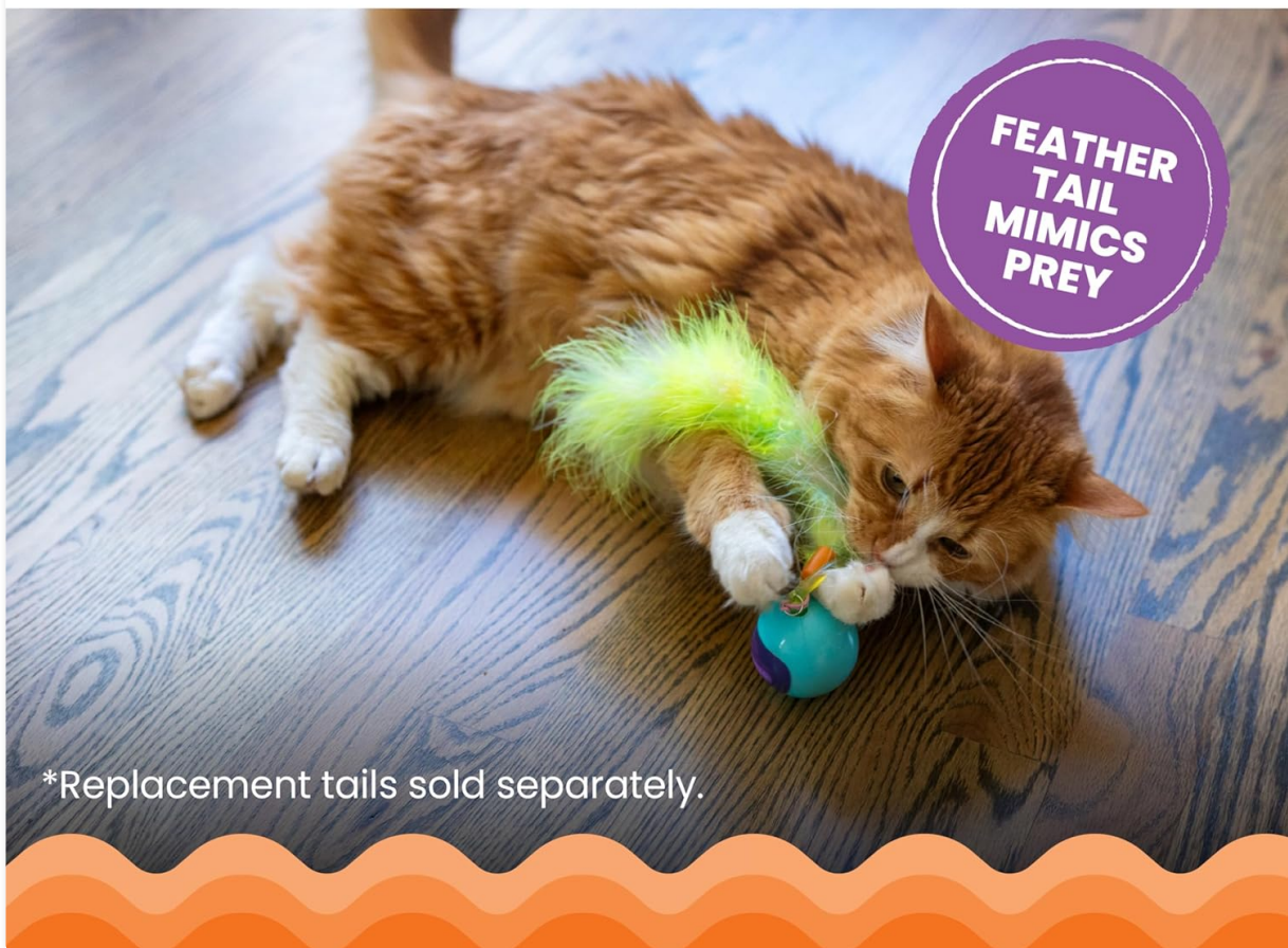
Image: An orange cat batting at the feather tail of the Catstages Roll & Chase Robot Toy on a wooden floor, highlighting the feather's role in attracting play.

Satisfies their wild side—no birds required.