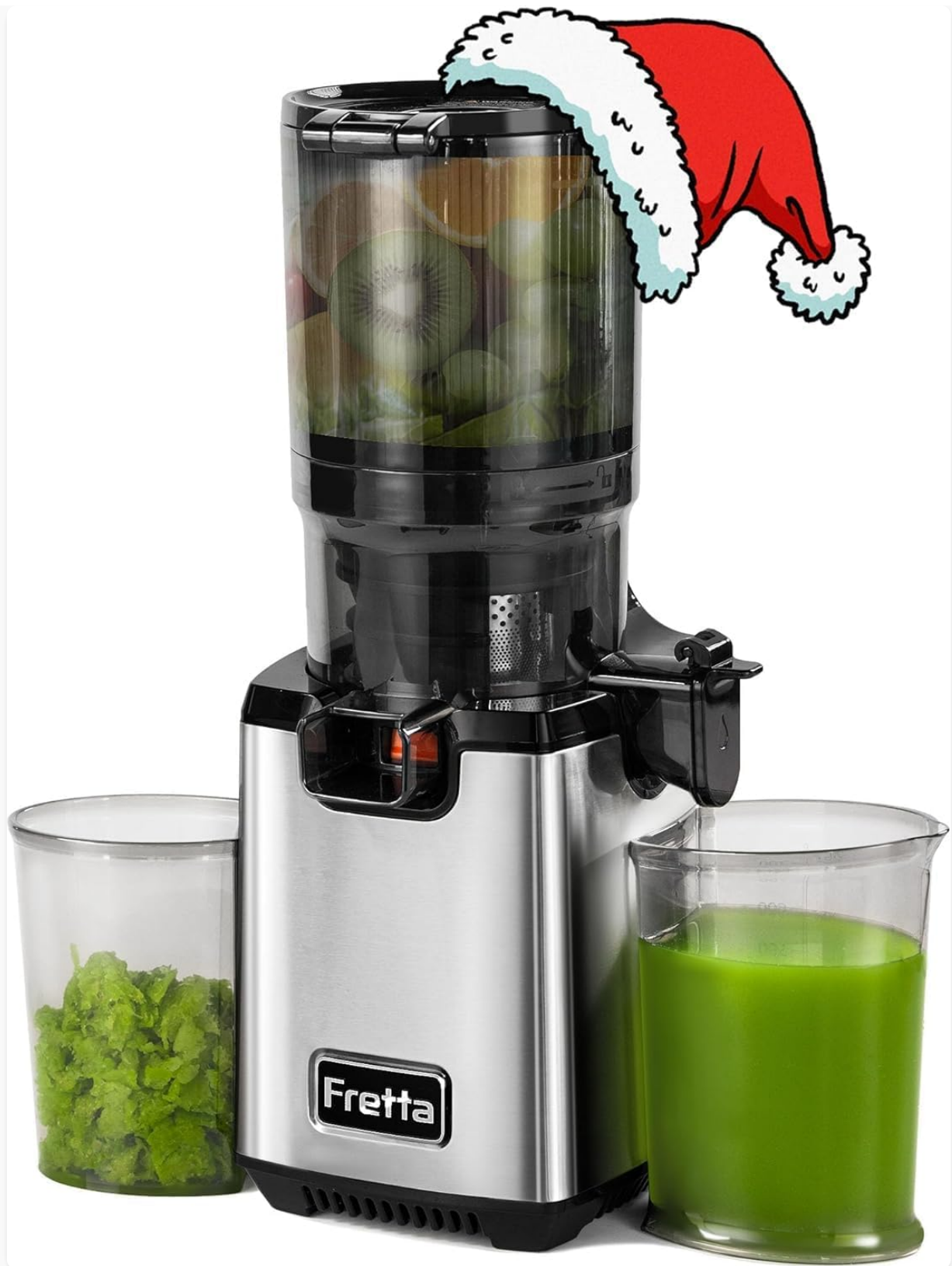
The Fretta F6000 Cold Press Juicer, ready for use.