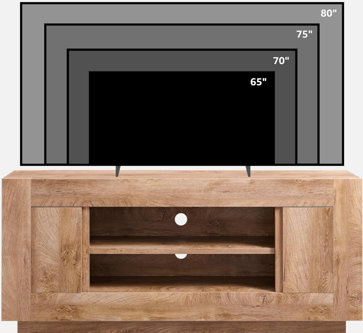
Image: A visual representation indicating that the TV stand is suitable for televisions up to 80 inches, with outlines for 65", 70", 75", and 80" TV sizes.