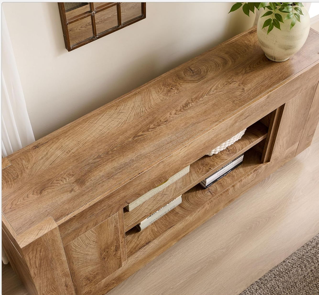
Image: A top-down view of the TV stand's 70"W x 16"D tabletop, highlighting its rustic wood finish and ample space for a television and decorative elements.