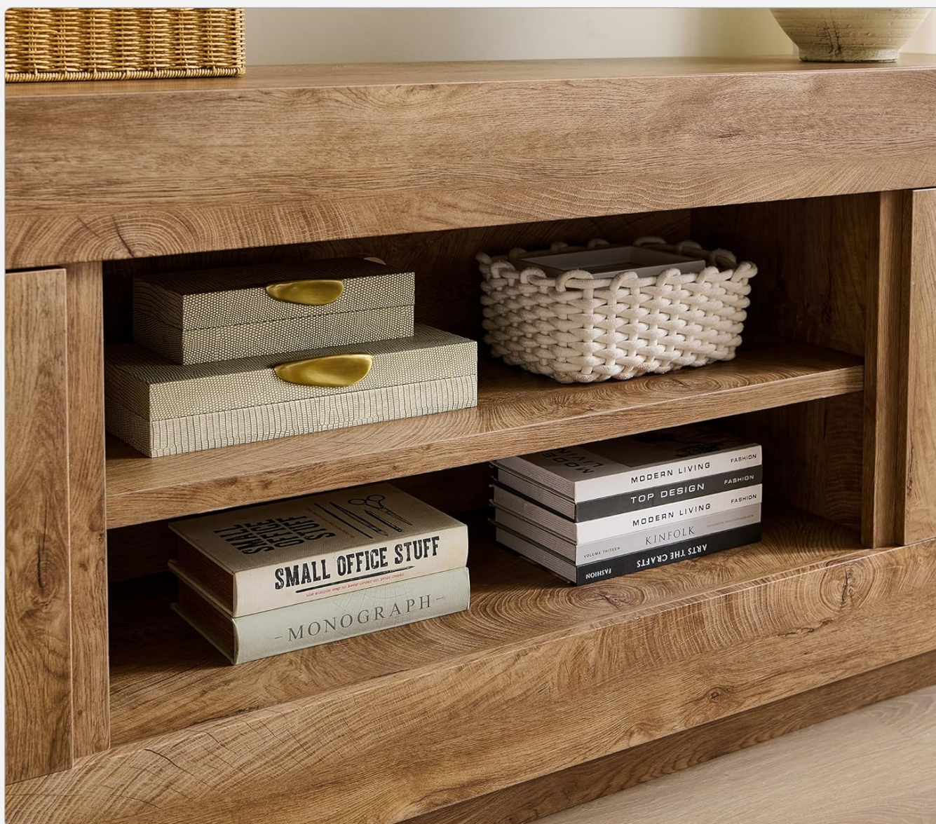
Image: A close-up view of the TV stand's hidden side cabinets with adjustable shelves, providing storage for media accessories and other items. The image highlights the functionality of the doors and internal space.

Ideal for consoles, center speakers, storage bins, or decor