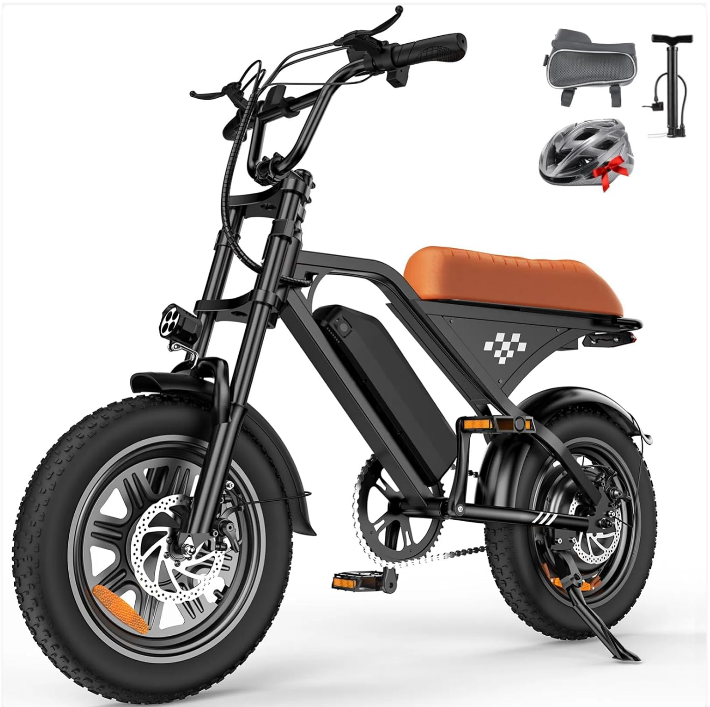
Figure 1: CYCROWN EB5 Mini Electric Dirt Bike - Black Standard model.