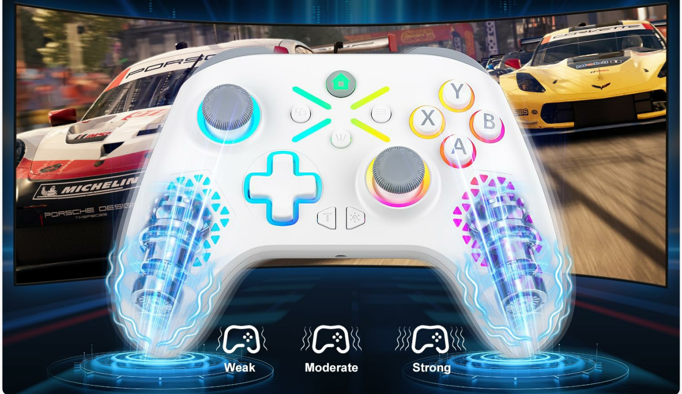
Image depicting the Gamrombo controller with visual effects indicating dual-vibration motors, showing 'Weak', 'Moderate', and 'Strong' vibration levels, set against a background of racing game scenes.

built-in dual motors shock provide excellent vibration effect