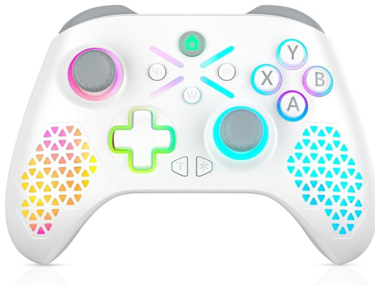
Image showing the Gamrombo controller with text overlay instructing users to upgrade the controller if connection issues occur, providing a download link and video tutorial link.

It will continue to be compatible with Xbox devices after upgrading, and the upgrade can only be done on Windows PC. Upgrading is easy and only takes 2-3 minutes.