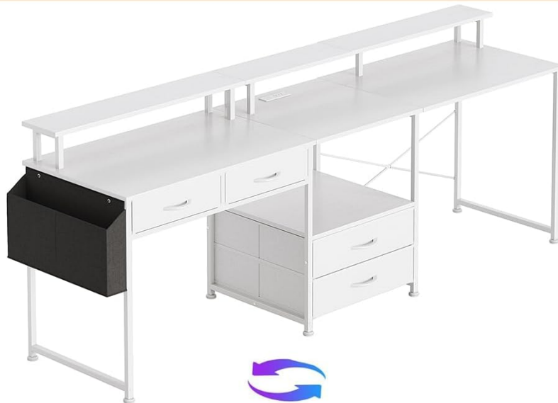
Figure 2: Multiple installation modes for the desk, including L-shaped and straight configurations.