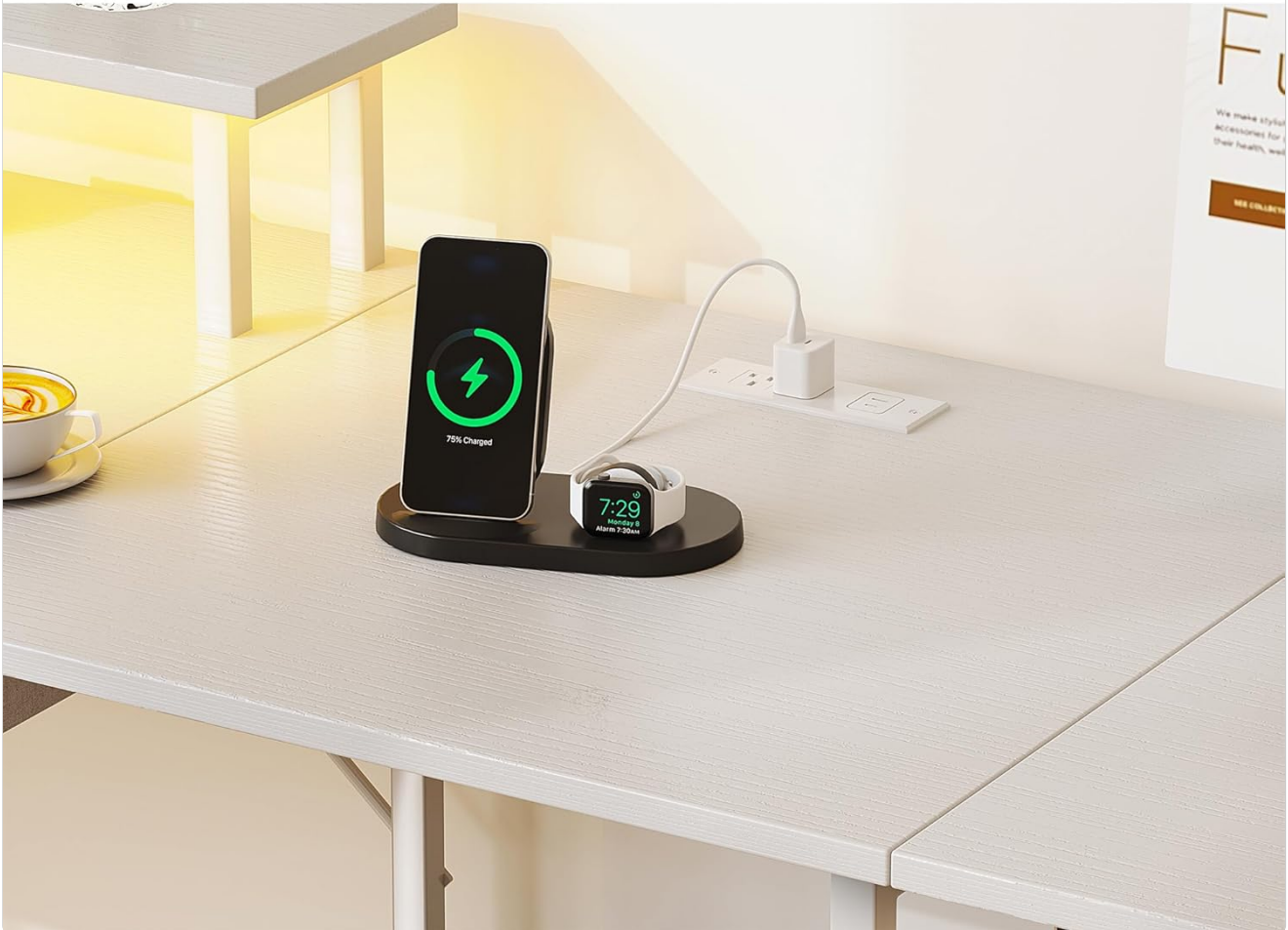
Figure 5: Detail of the 3 AC outlets, 1 USB-A port, and 1 Type-C port for device charging.