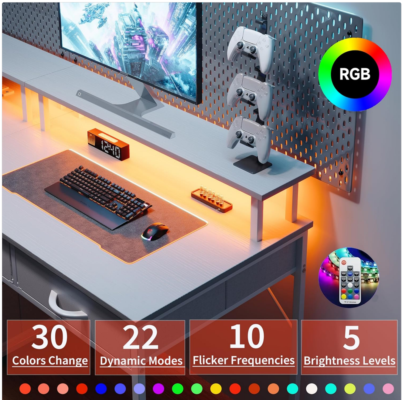
Figure 6: The LED light strip illuminating the monitor stand, with remote control and color options displayed.