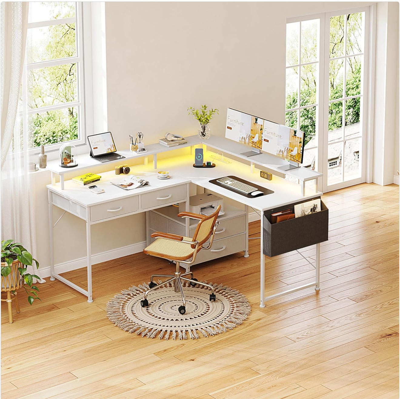
Figure 1: Overview of the Flrrtenv L-Shaped Desk in an office environment.