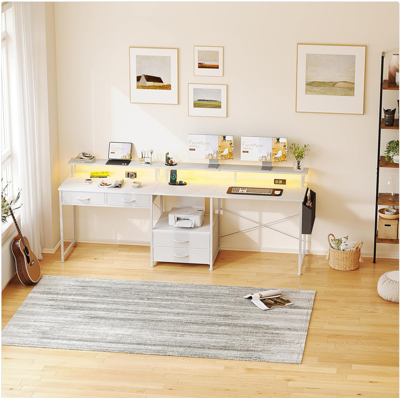
Figure 3: The desk configured as a long straight unit, suitable for larger spaces or specific layouts.