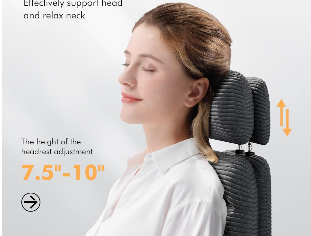
Image: Demonstrates the adjustable headrest, supporting the user's head and neck.