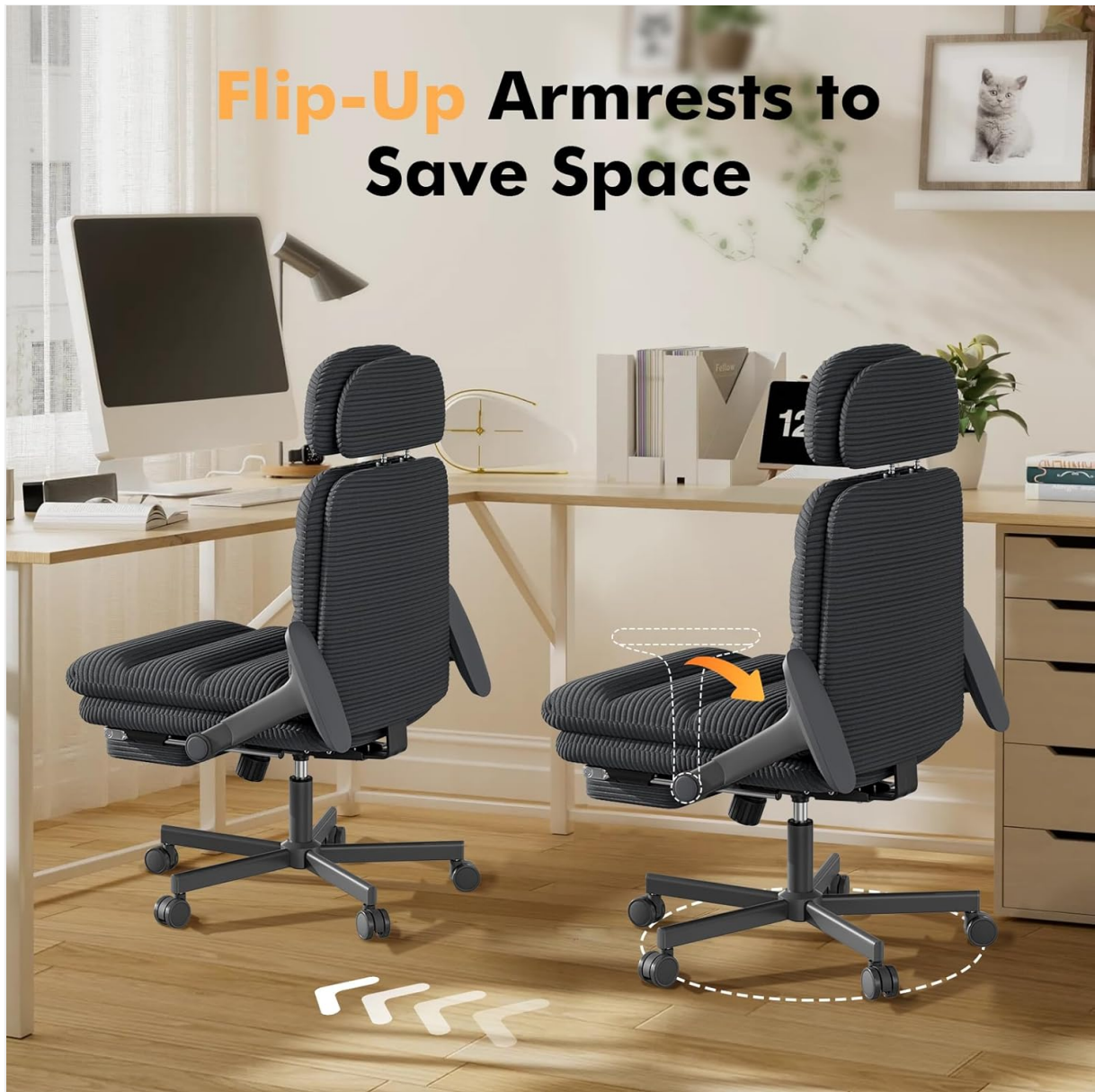
Image: Demonstrates flip-up armrests to save space, showing armrests in both down and up positions.