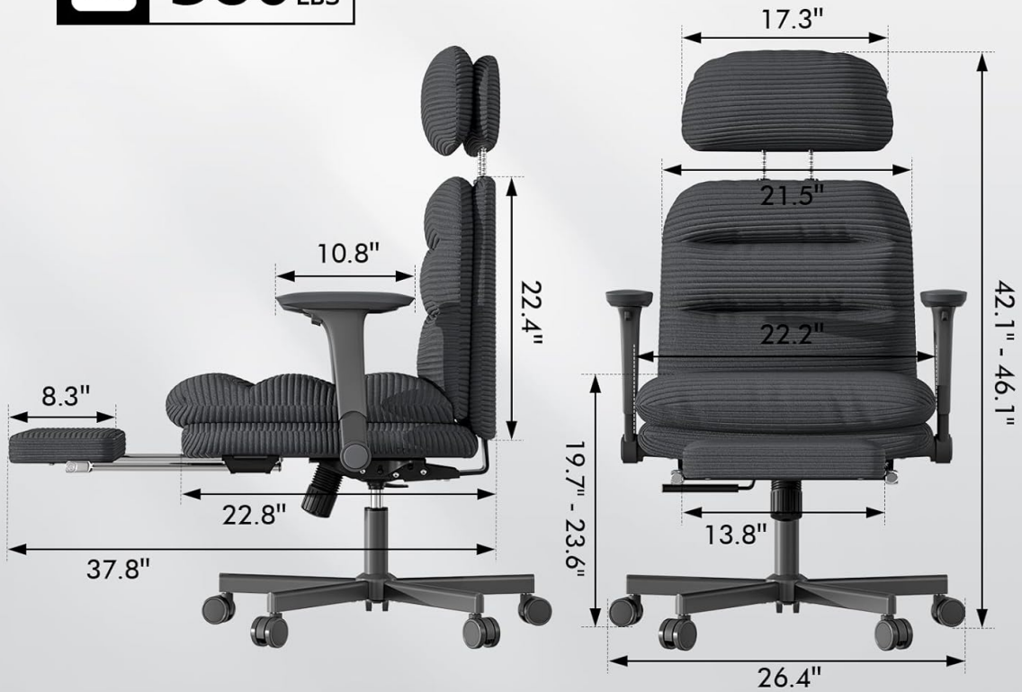
Image: Product dimensions and weight capacity of 380 lbs.