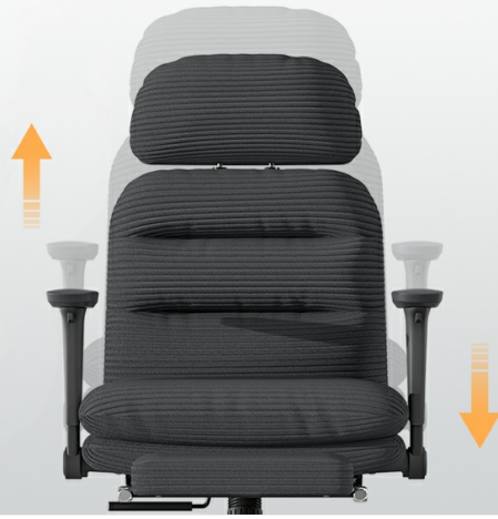
Image: Illustration of the 3.94-inch height adjustment range.