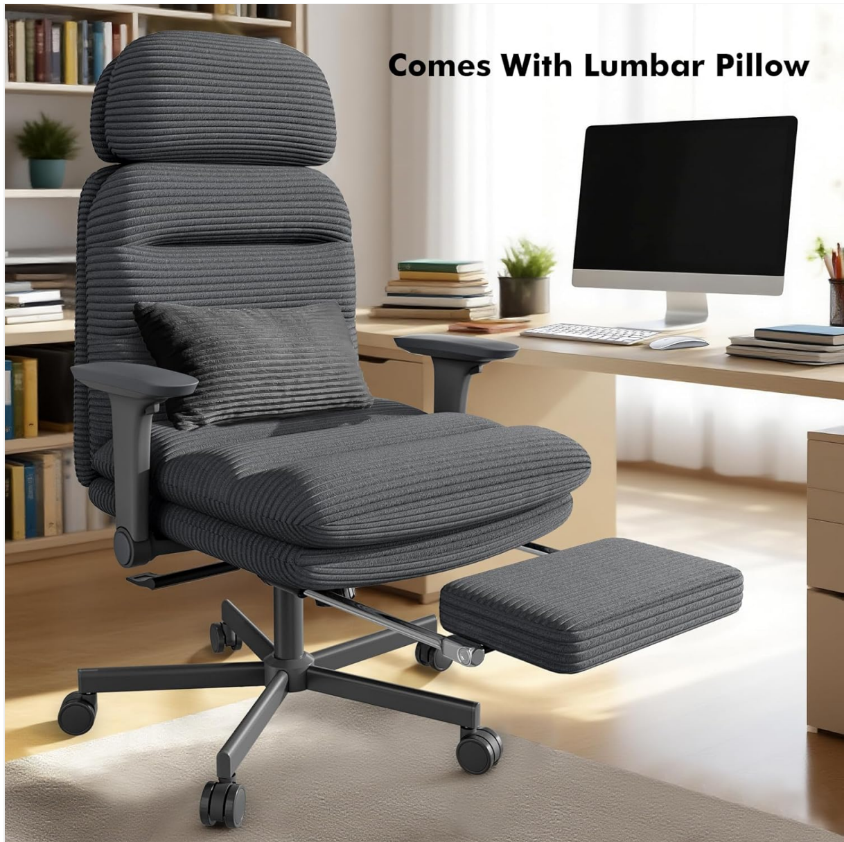
Image: Chair with lumbar pillow and footrest extended, ready for use.

The integrated footrest allows you to stretch out and relax. To deploy the footrest, pull it out from underneath the seat. To retract, push it back in until it is fully stowed.