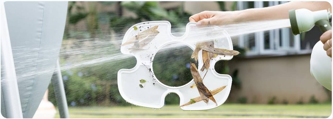
Image 9: Steps for removing, rinsing, and reinstalling the filter basket.