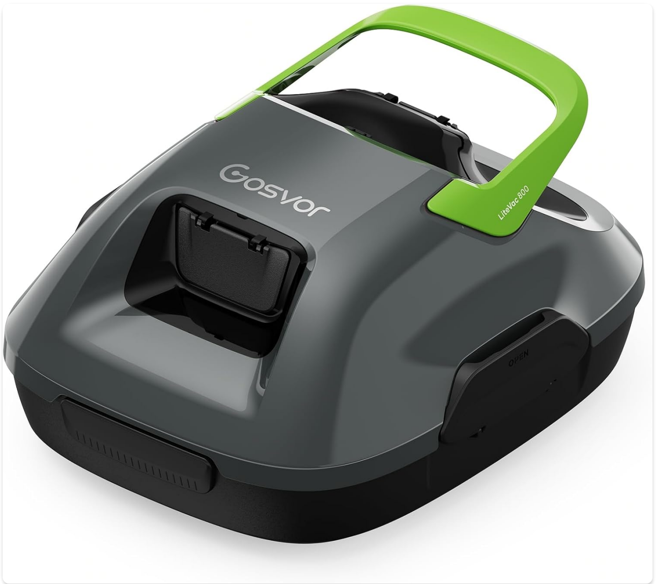
Image 1: The Gosvor LiteVac 800 Cordless Robotic Pool Cleaner, featuring a sleek design and a green handle.