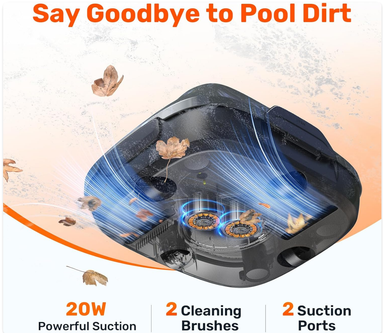
Image 6: Illustration of the cleaner's powerful suction capturing debris.