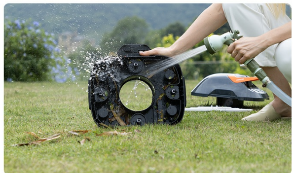
Image 10: Demonstrating the ease of cleaning the filter and the main unit.