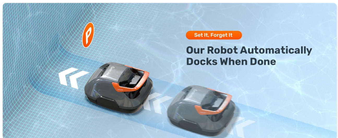
Image 7: The cleaner automatically docking itself at the pool edge.