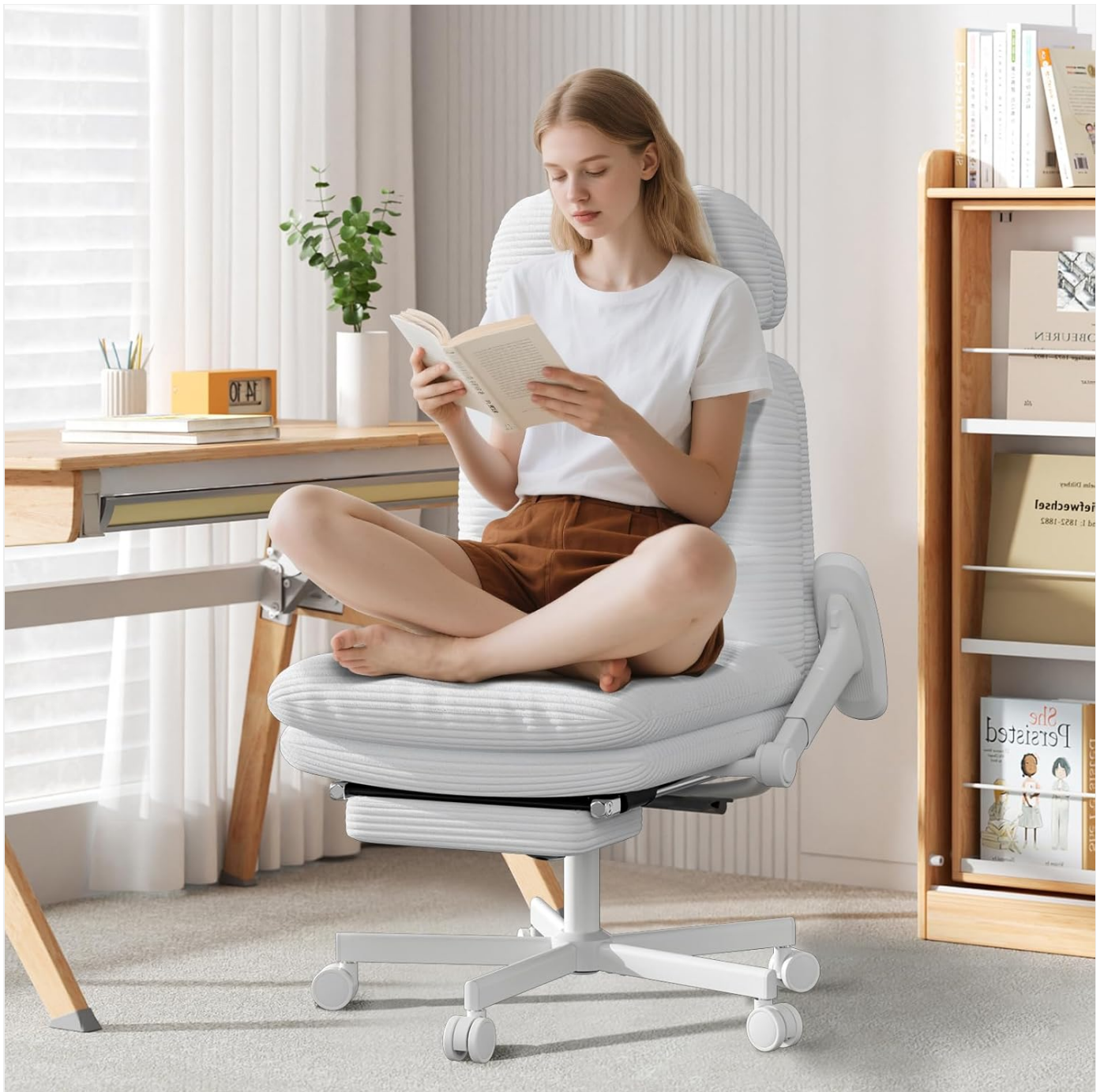
Image 2.1: GXJ Criss Cross Office Chair in use, highlighting its spacious design for various sitting postures.