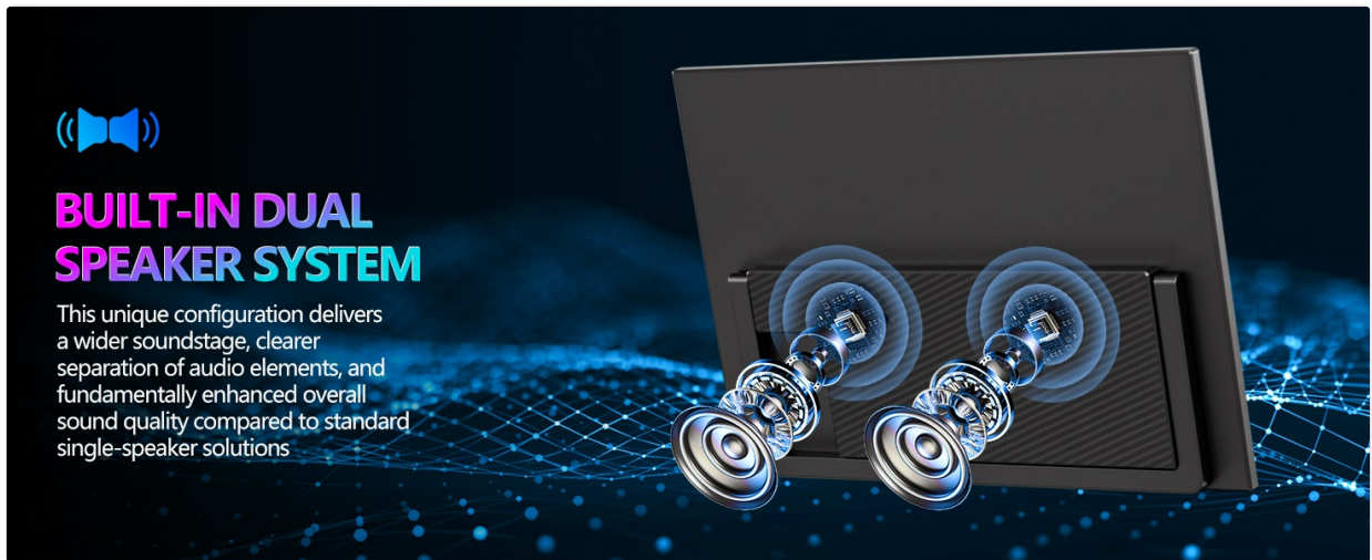
Image: Illustration of the monitor's built-in dual speaker system.

The monitor includes built-in dual speakers. Adjust the volume through the OSD menu or your connected device.