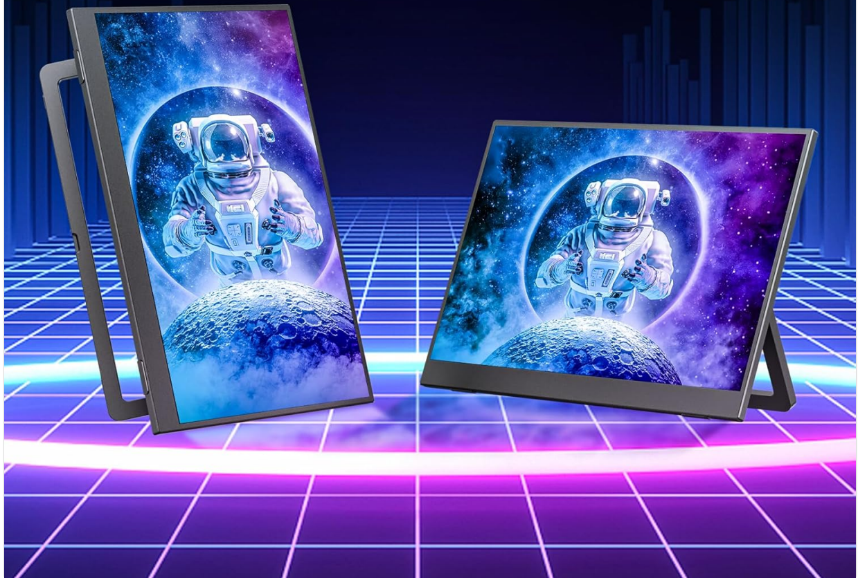
Image: The monitor in both landscape and portrait orientations.

Easily install the portable monitor, freely adjust the screen orientation landscape or portrait to meet work demands, and significantly enhance work efficiency