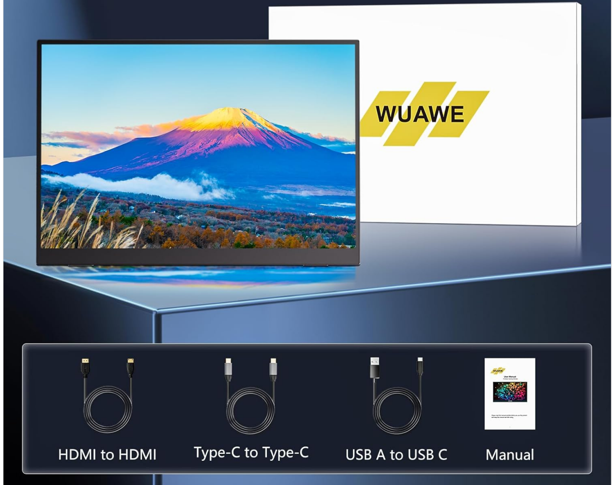
Image: The WUAWE portable monitor and its included accessories.