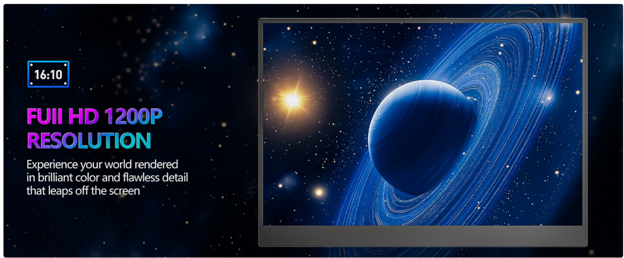
Image: The monitor showcasing its FHD 1200P resolution with a space-themed image.