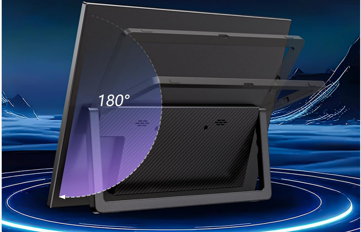
Image: The monitor's adjustable stand in use.