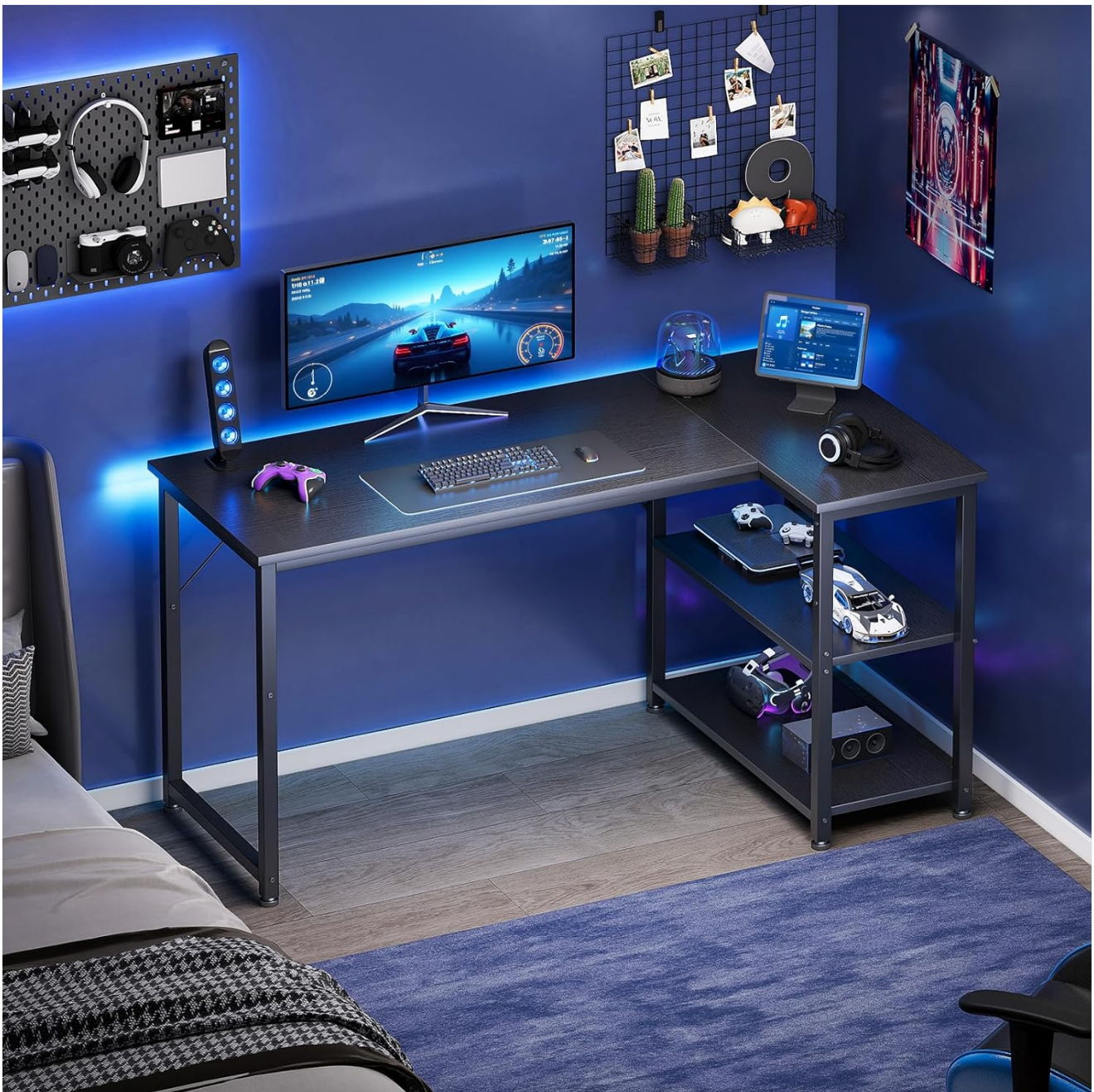
Image 1: The Coleshome L-shaped gaming desk configured for a gaming setup, showcasing its spacious surface and integrated storage shelves. The desk is positioned in a room with blue ambient lighting, highlighting its aesthetic appeal and functionality.