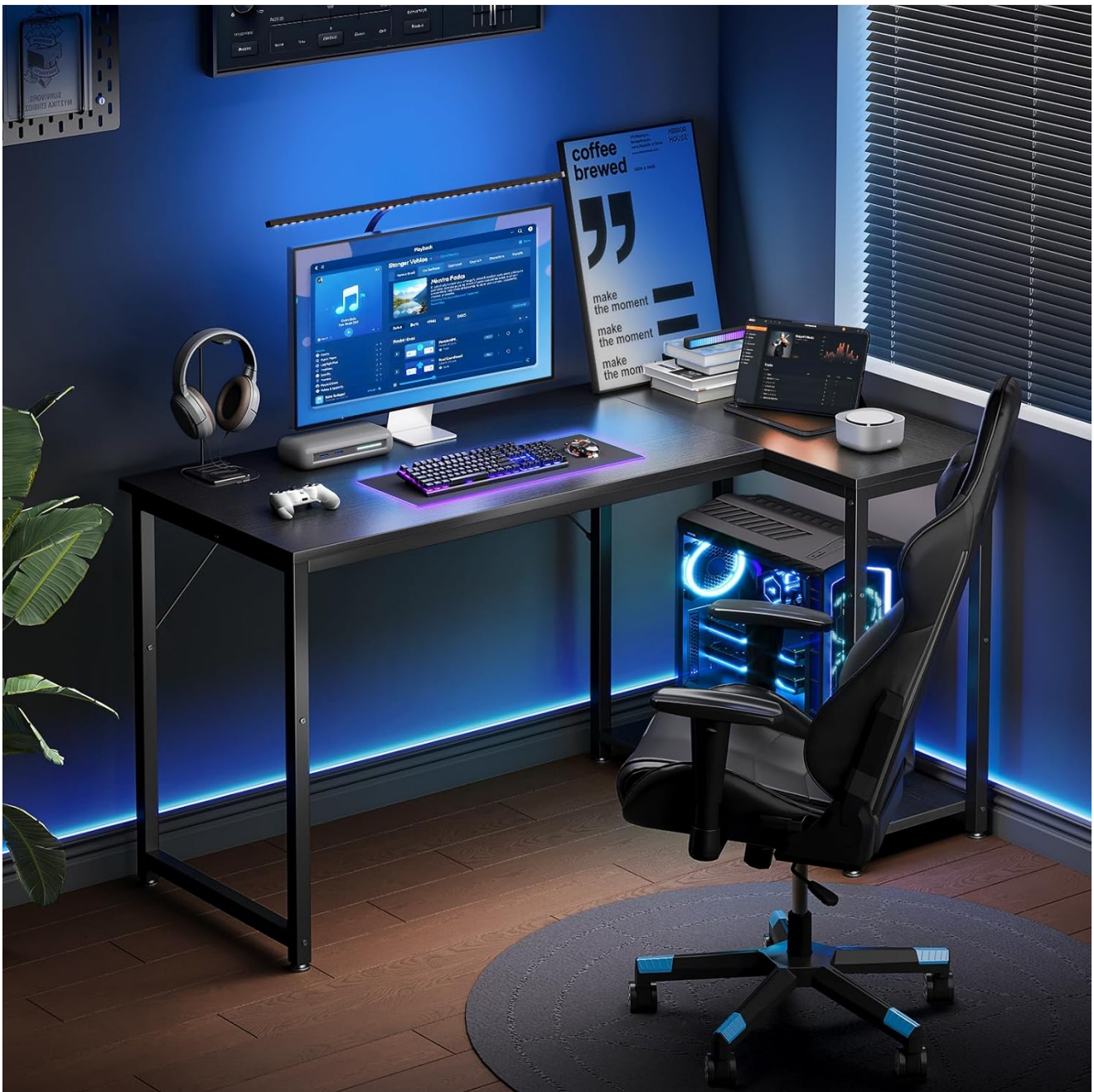
Image 4: This image presents the Coleshome L-shaped desk in a home office setting, demonstrating its versatility. The L-shape can be assembled with the shorter return on either the left or right side, adapting to different room layouts and user preferences. It features a monitor, laptop, and other office essentials.