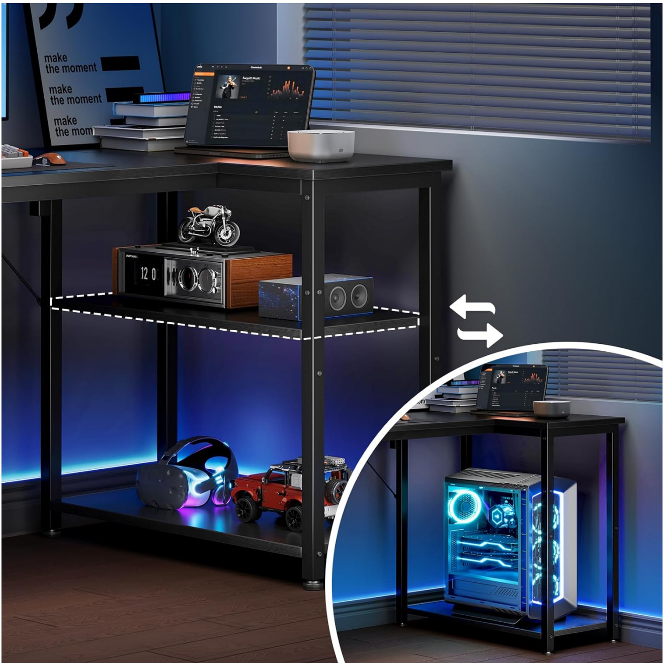
Image 5: This image illustrates the adjustable nature of the storage shelves on the Coleshome desk. The dashed lines indicate that the middle shelf can be removed or repositioned to accommodate items of various heights, such as a computer tower or larger storage boxes.