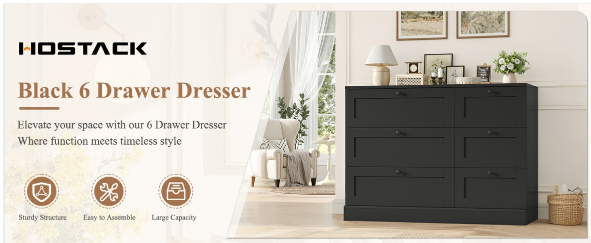
Figure 2: The HOSTACK 6-Drawer Dresser, illustrating its overall design and drawer configuration.

The HOSTACK 6-Drawer Dresser is designed for versatile storage in various rooms. It features six drawers in two different sizes, providing organized storage solutions. The dresser is constructed from high-grade manufactured wood with robust metal hardware, ensuring durability and stability.