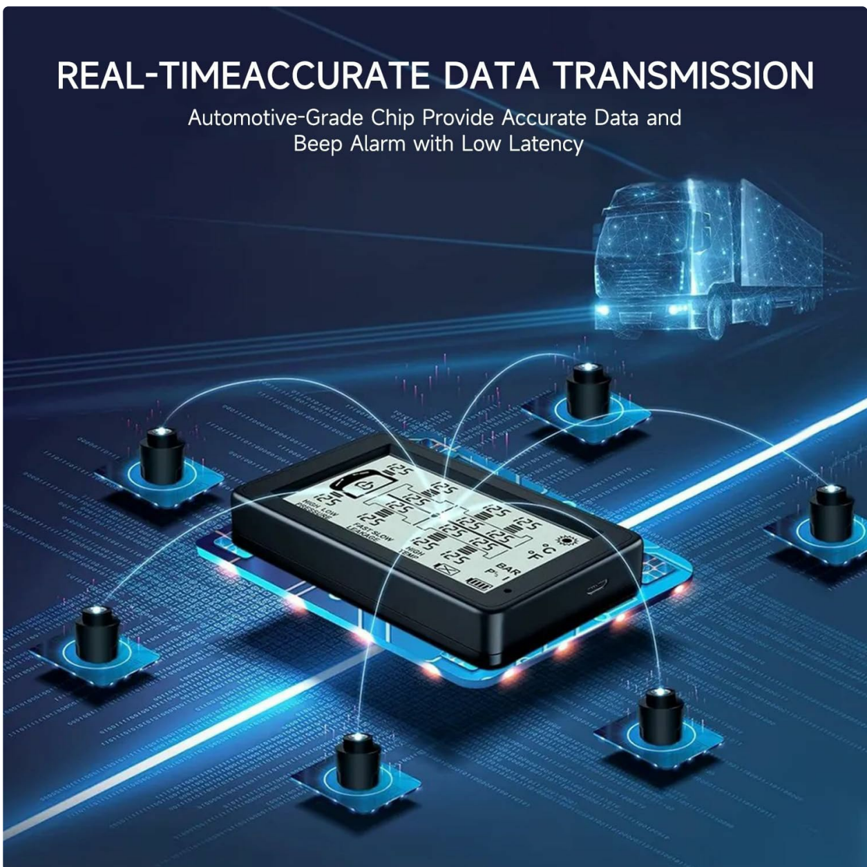
The system ensures real-time and accurate data transmission from each tire sensor to the main monitor unit.