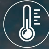
High Tempera- -Ture Alarm