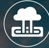
Fast Leak Alarm