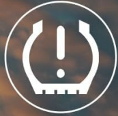
Sensor Low Voltage Alarm