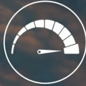
High Pressure Alarm