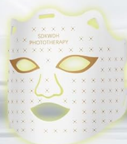
Yellow Light 590nm