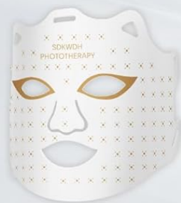
White Light 1410nm

Image: Detailed diagram illustrating the various components of the LED face mask, including LED lamp beads, bandage connection lock, medical grade pads, VPS material, and charging port.