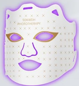
Purple Light 1050nm