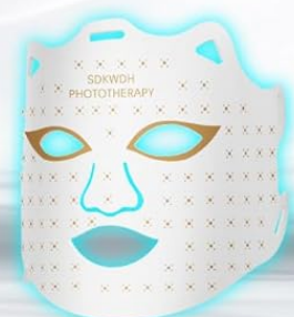
Cyan Light 470nm