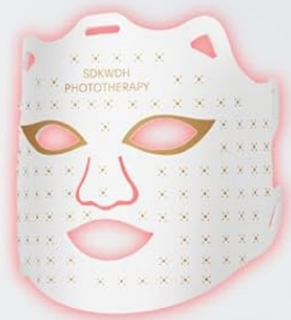
Red Light 630nm