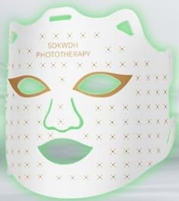
Green Light 534nm