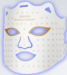
Blue Light 415nm