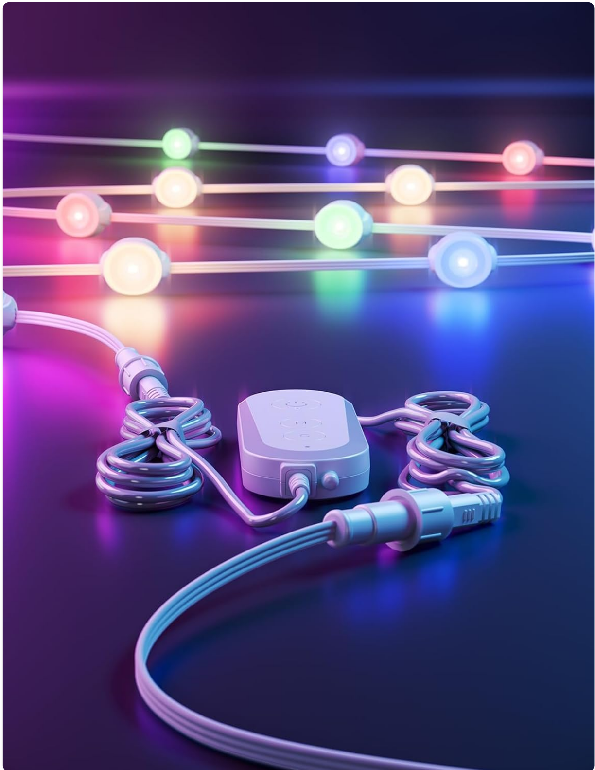
Image: The main components of the CINOTON Permanent Outdoor Lights Pro 100ft, including the string lights, control box, power adapter, and remote control, laid out on a surface.