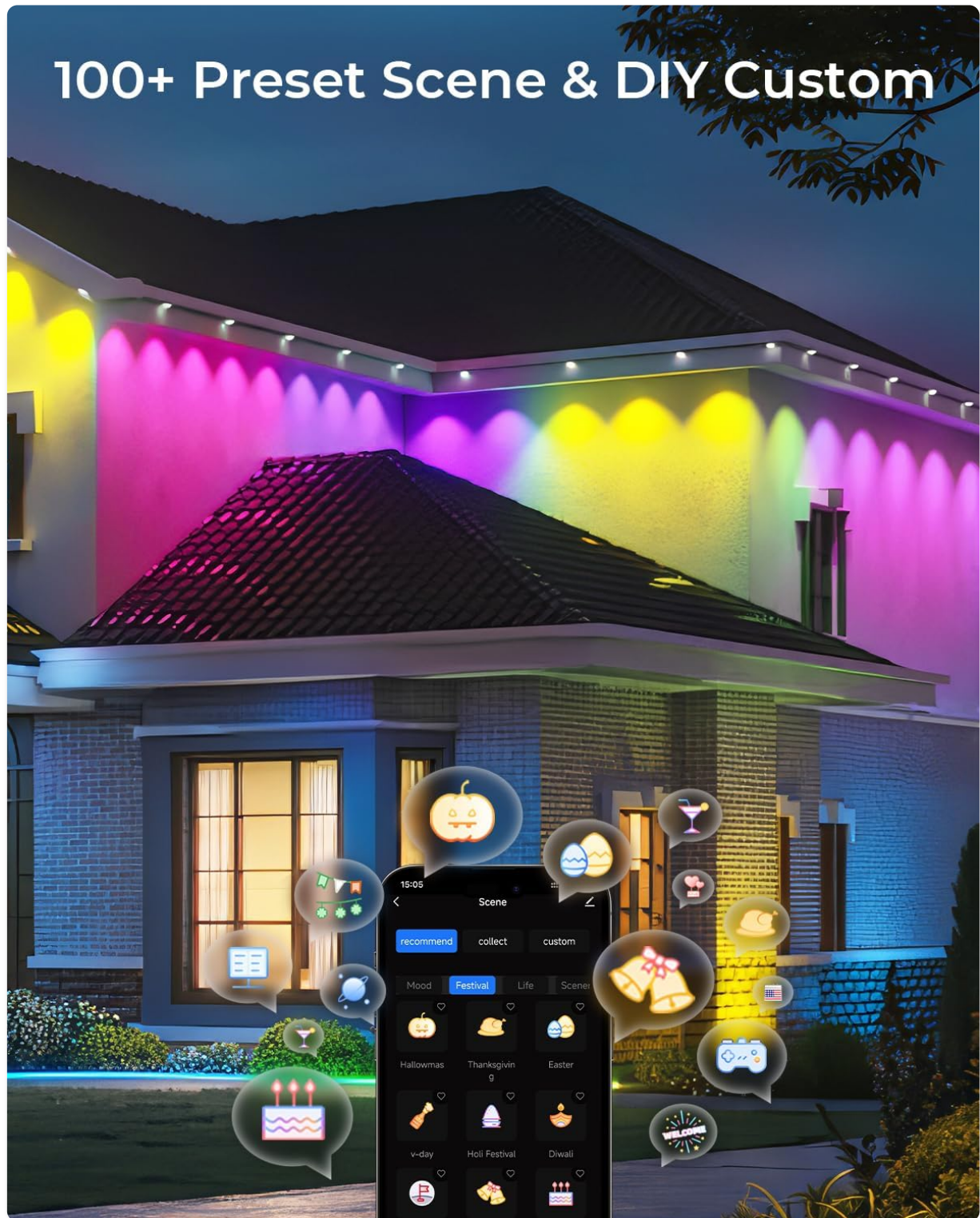
Image: A house illuminated with various colorful lighting patterns, with a smartphone displaying the Smart Life app's "Scene" menu, showcasing over 100 preset and DIY custom modes for different occasions.

Lights, showing Wi-Fi and local connection options, color selection, and scene modes.