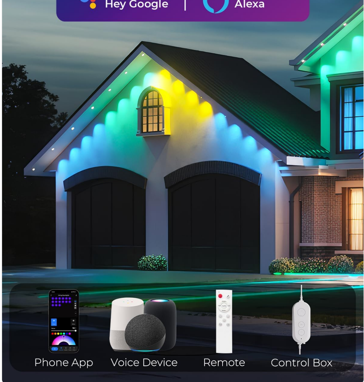
Image: A visual representation of the multiple control methods available for the CINOTON Permanent Outdoor Lights, including phone app, voice devices (Alexa, Google Home), remote control, and the physical control box.