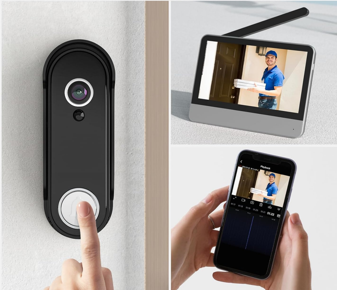
Figure 5: Demonstrates the two-way audio capability, allowing communication with visitors through both the indoor monitor and a connected mobile phone.

Enable to talk with visitors via monitor or mobile phone