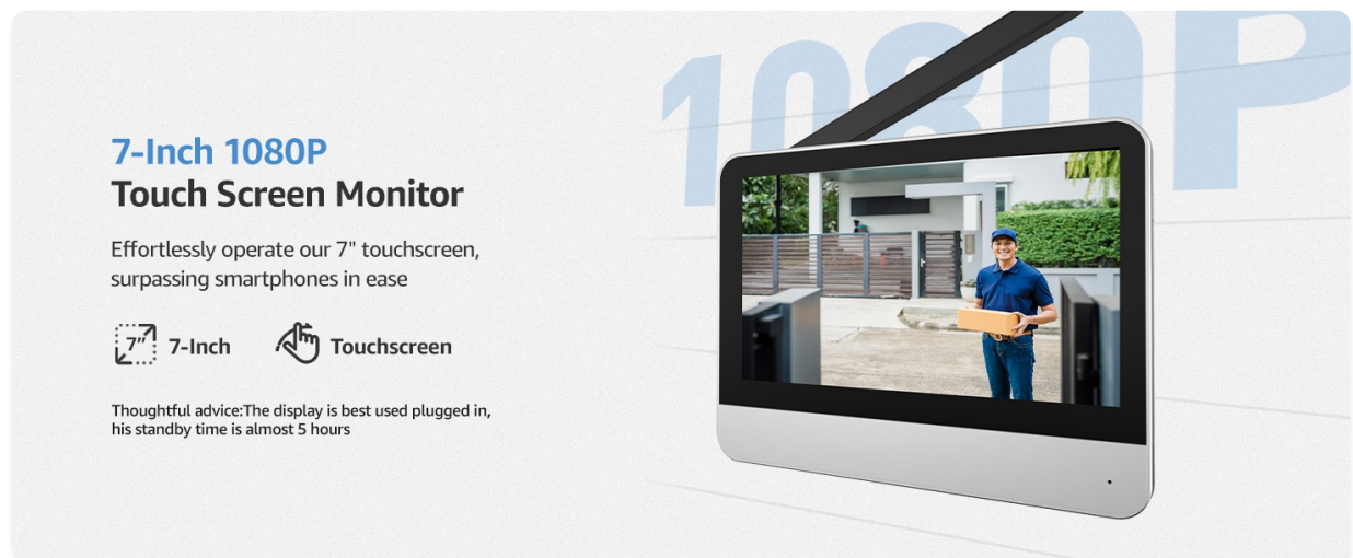
Figure 4: The 7-inch 1080P touchscreen monitor, showcasing its clear display and user-friendly operation for viewing visitors.

The 7-inch touchscreen monitor serves as your primary interface for the doorbell system. All essential functions, including answering calls, unlocking compatible doors (with optional electronic lock integration), and monitoring, are integrated directly into the monitor. Its intuitive interface is designed for ease of use, similar to a smartphone.