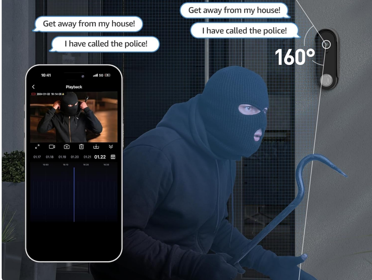
Figure 6: Illustrates the smart PIR motion detection feature, showing an alert on a smartphone when movement is detected near the doorbell.

Once movement is detected, you'll receive an alert on your cell phone and indoor monitor.