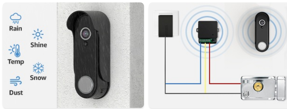
Figure 9: Left: The doorbell unit's battery being charged. Right: The doorbell unit's weather resistance, indicating its ability to withstand rain, shine, temperature changes, snow, and dust.