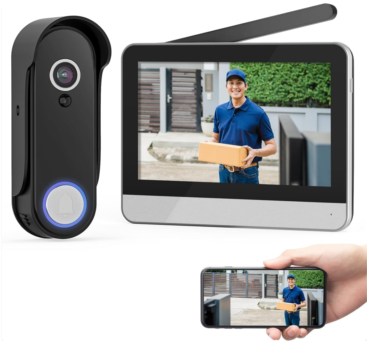
Figure 1: The Wireless Smart Video Doorbell System, showing the outdoor doorbell unit, the 7-inch indoor touchscreen monitor, and a smartphone displaying the live feed.