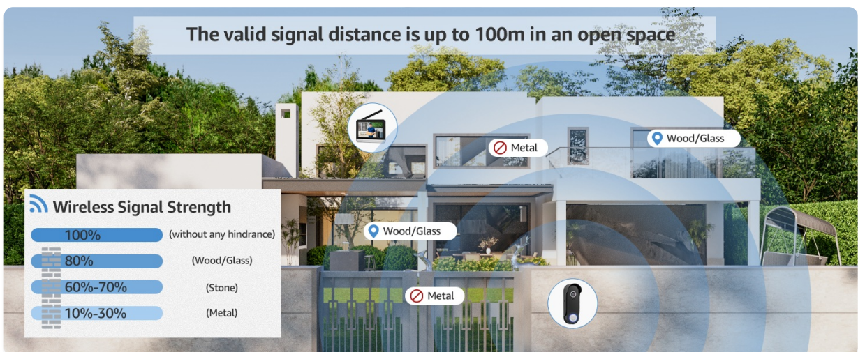
Figure 3: Illustration of the doorbell's wireless signal strength, demonstrating its ability to penetrate various materials like wood/glass, stone, and metal, with an effective range of up to 100m in open spaces.