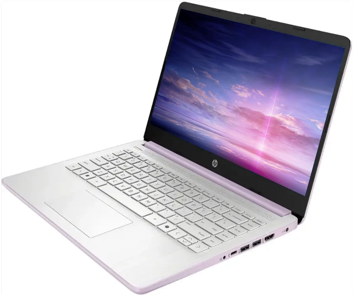
Figure 3: Angled view of the HP 14-inch Laptop, showcasing the keyboard and touchpad.

The laptop features a full-size keyboard and a multi-touch gesture-enabled touchpad. Refer to the Windows operating system documentation for detailed information on touchpad gestures.