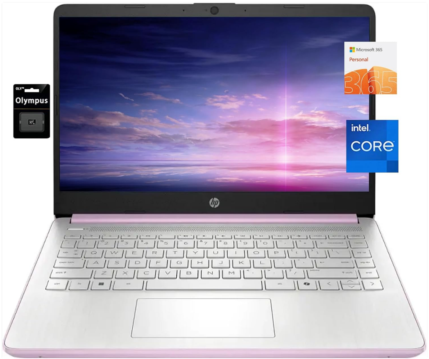
Figure 1: Front view of the HP 14-inch Laptop with the screen open.