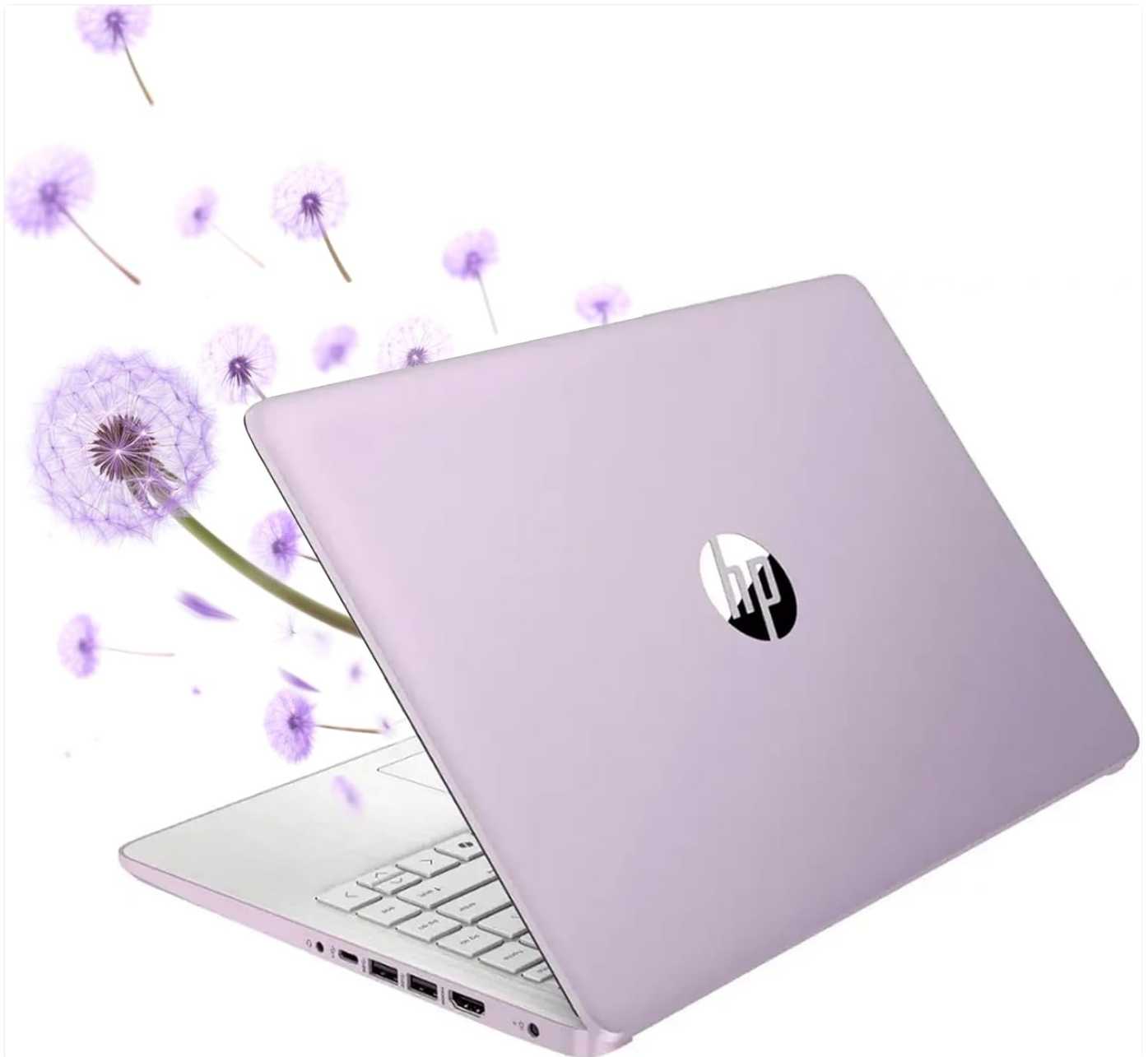
Figure 2: Top view of the HP 14-inch Laptop in Honey Lavender color, with the lid closed.