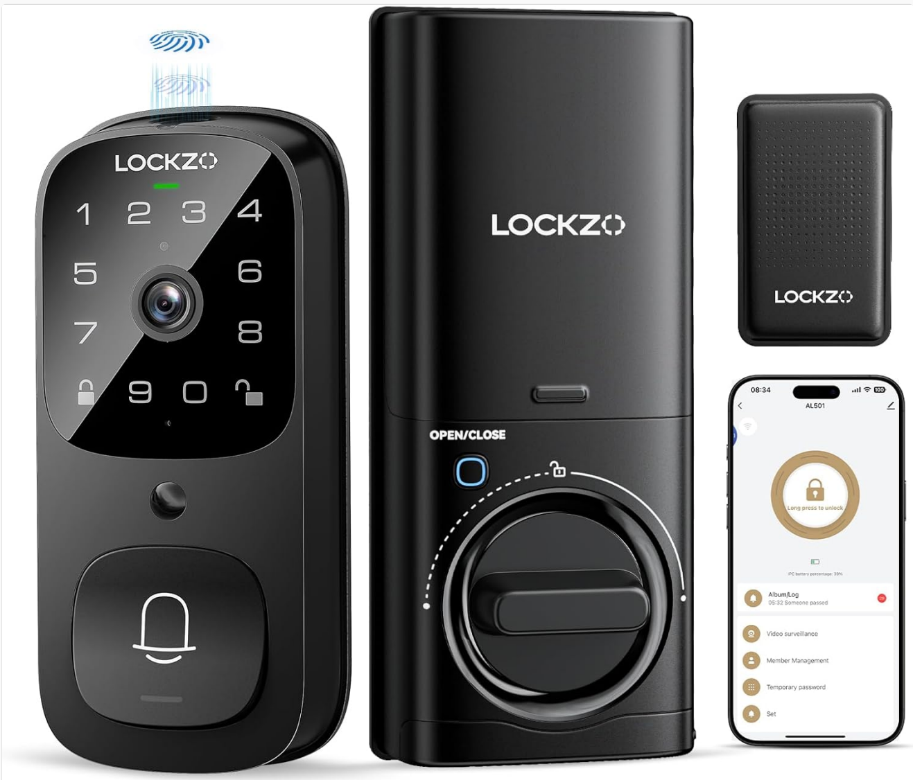
Figure 3.1: Overview of Lockzo AL501 Smart Lock components. The image displays the exterior unit with keypad and camera, the interior unit with a thumb turn, a separate battery pack, and a smartphone screen showing the lock's app interface.