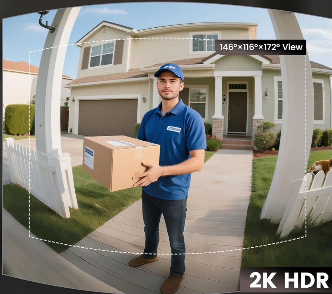
Figure 8.2: Illustrates the 2K camera capabilities of the Lockzo AL501 Smart Lock, highlighting its wide 180-degree viewing angle. The image shows a clear view of a person delivering a package at a doorstep.