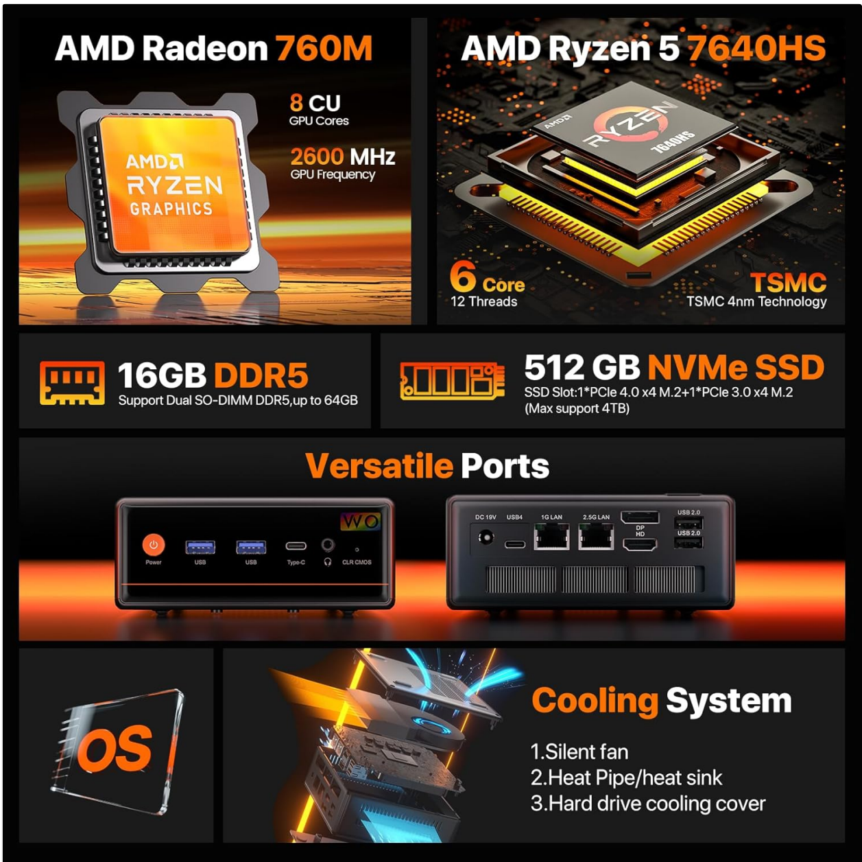
Image: Overview of the PELADN Mini PC WO4 7640HS, showcasing its AMD Ryzen 5 7640HS CPU, Radeon 760M GPU, 16GB DDR5 RAM, 512GB NVMe SSD, versatile ports, and cooling system.