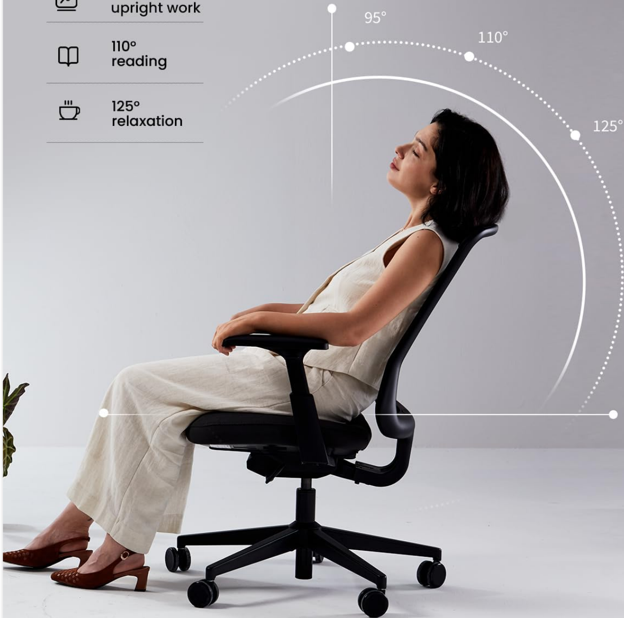
Image Description: A visual representation of the chair's recline functionality, showing different angles for various activities like working, reading, and relaxing.

Your browser does not support the video tag.