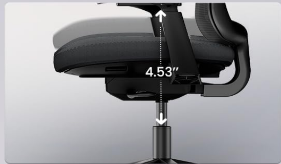
Image Description: A comprehensive diagram displaying the various dimensions of the ProtoArc Flexer chair, including seat height range, backrest height, and overall footprint.