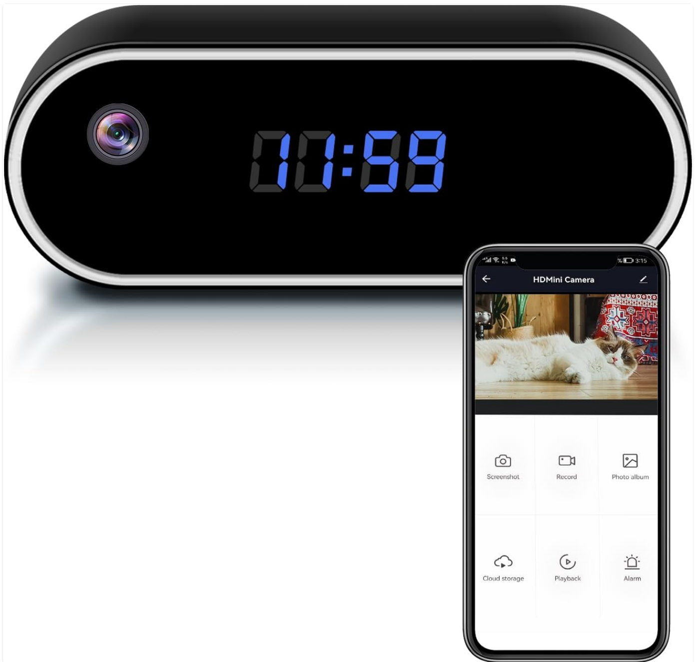
Image: The TONGCAM WiFi Hidden Camera Clock, a sleek black device with a blue LED display, shown alongside a smartphone displaying its live camera feed and control options.