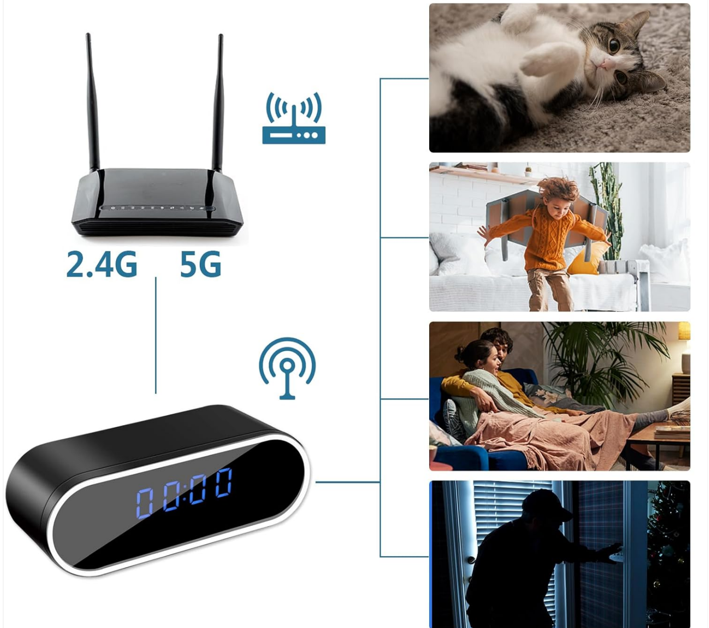
Image: A diagram illustrating the connectivity of the hidden camera clock to a 2.4GHz WiFi router, enabling remote monitoring via a smartphone app. Various scenarios like monitoring pets, children, or home security are depicted.

Keep an eye on what you care about most, no matter where you are or what you' re doing.