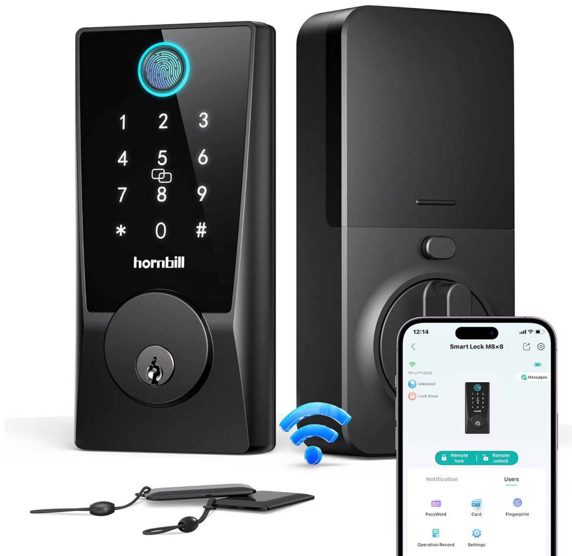
Image: All components of the Hornbill M8 WiFi Smart Lock, including the exterior keypad, interior unit, keys, and a smartphone displaying the control app.