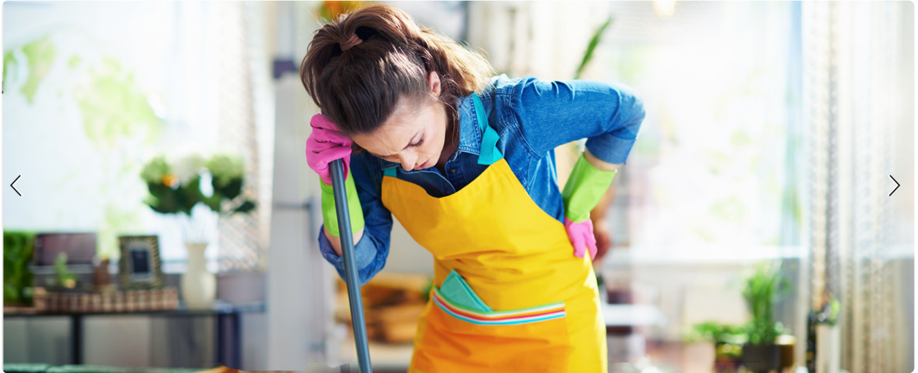
Image: "About AUVON" section, highlighting the brand's commitment to improving lives and its history in healthcare.

AUVON has been a trusted brand in pain management for over 7 years, serving millions of customers. We are dedicated to helping people live better lives.