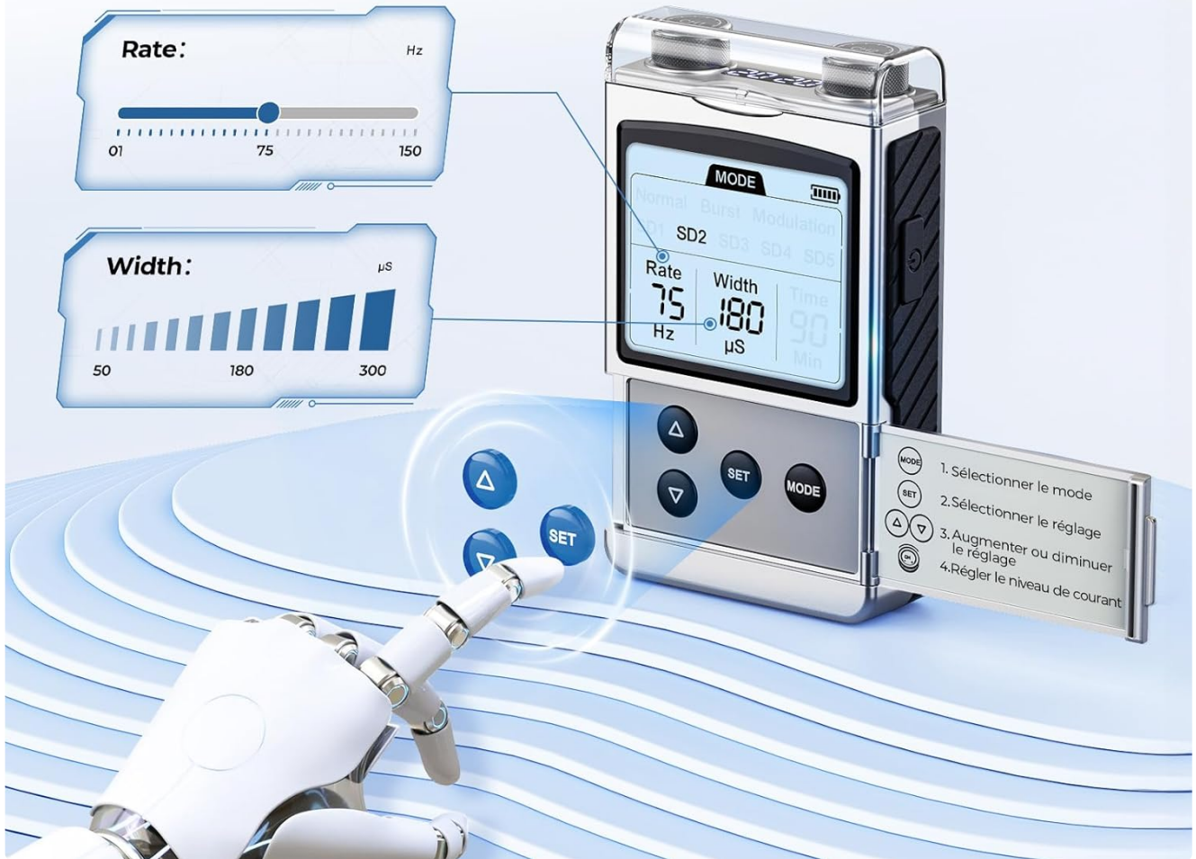
Image: Detailed view of the device's display, illustrating customizable pulse rate and pulse width for personalized pain relief.

Professional and adjustable rate and pulse width for personalized pain relief.