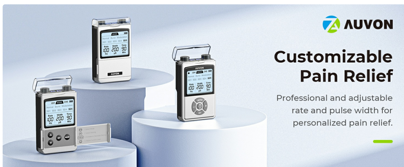
Image: AUVON TENS Machine providing a new choice for pain relief, illustrating its application for shoulders, back, knees, and wrists.

The AUVON Rechargeable TENS Machine EMS Muscle Stimulator (Model CT15AB) is designed to provide temporary relief from sore and aching muscles. This digital TENS unit offers a drug-free solution for alleviating body discomfort caused by strain from exercise or daily activities. It features 8 customizable modes, 40 intensity levels, and a powerful 600 mAh battery for extended use. This manual provides essential information for the safe and effective operation of your device.