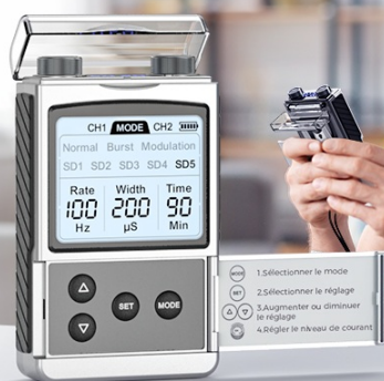
Image: Overview of the professional, rechargeable, and adjustable medical TENS unit with its core features.

An intuitive interface with clear printed guidelines ensures easy usability.