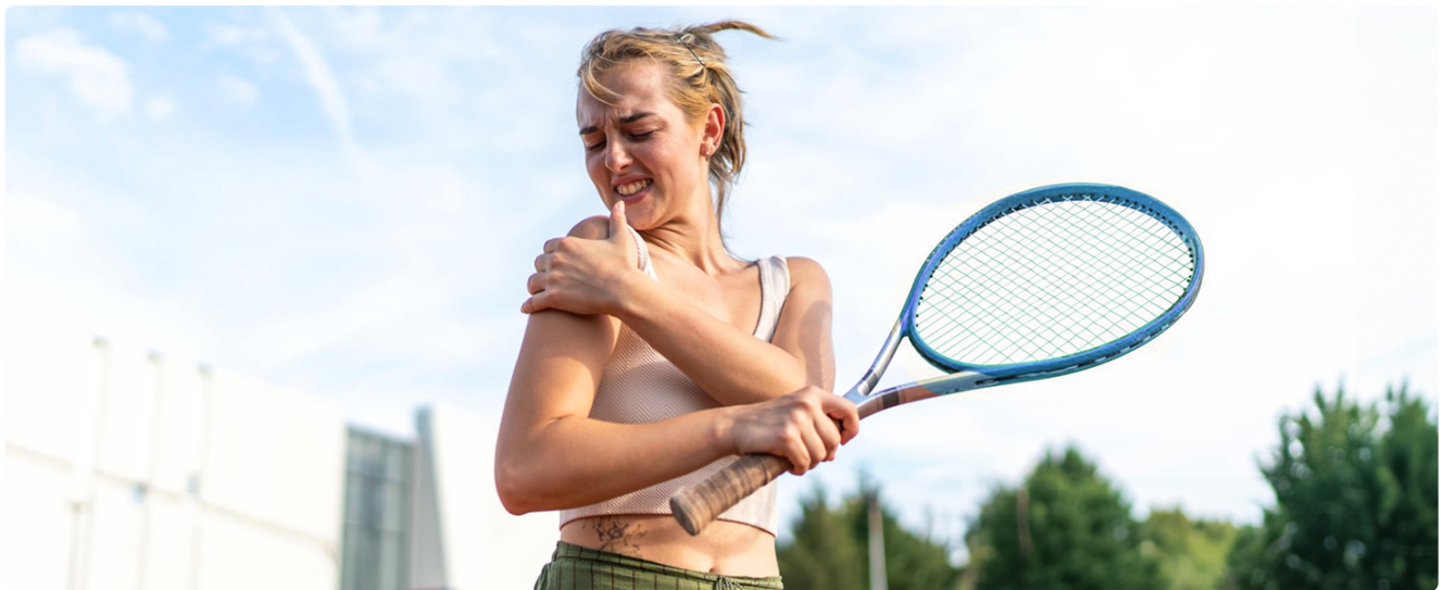
Image: Visual representation of conditions and individuals for whom the TENS unit is not suitable, emphasizing safety.

Actual product packaging and materials may contain more and different information than what is shown on our website. We recommend that you do not rely solely on the information presented and that you always read labels, warnings, and directions before using or consuming a product.