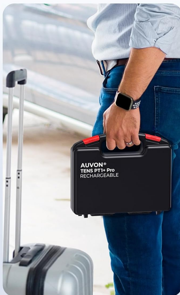
Image: The TENS unit with its belt clip for hands-free use and its compact carry case for easy transport.