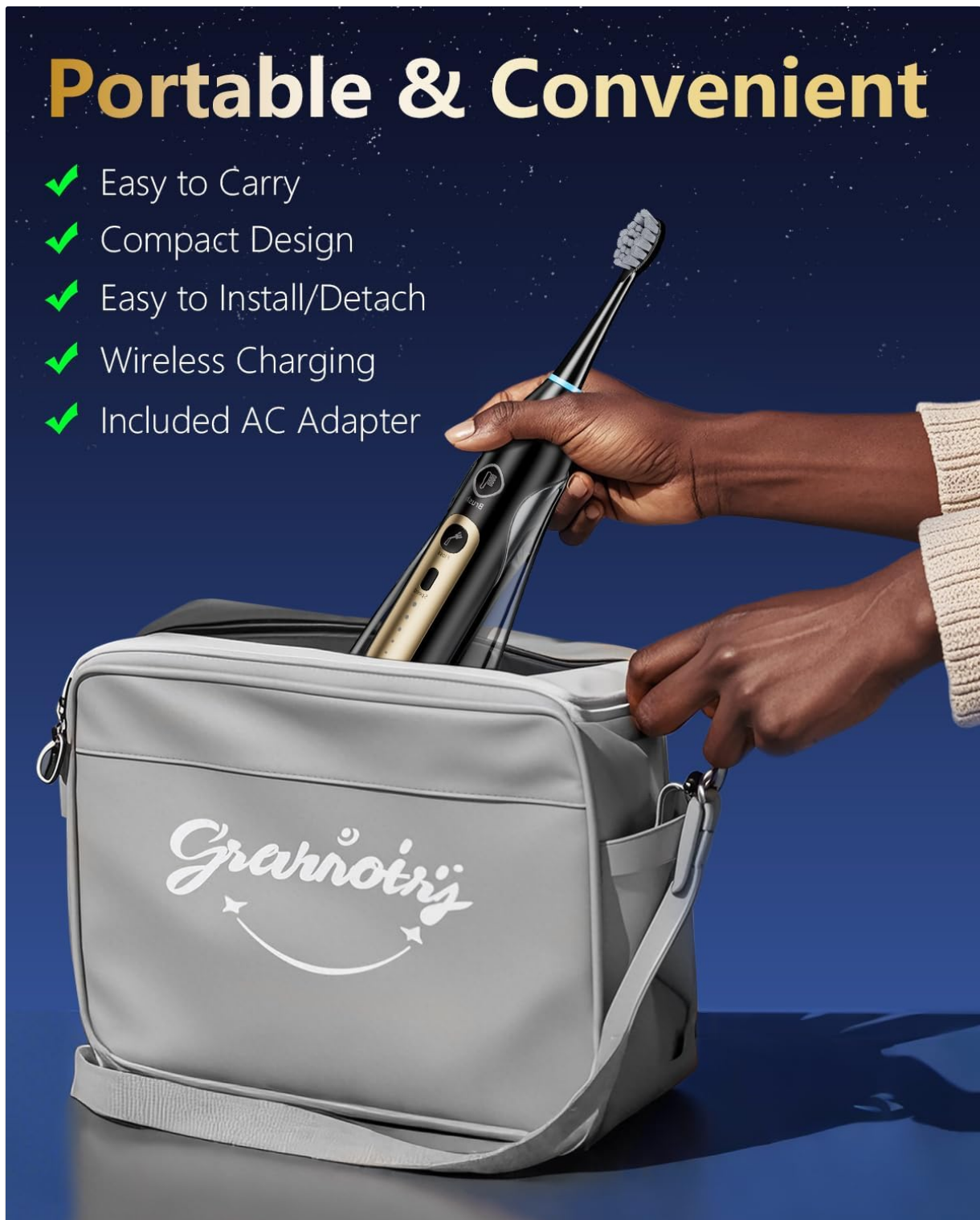
Image: The portable design of the Ducard 3-in-1 Electric Toothbrush, shown being placed into a travel bag.