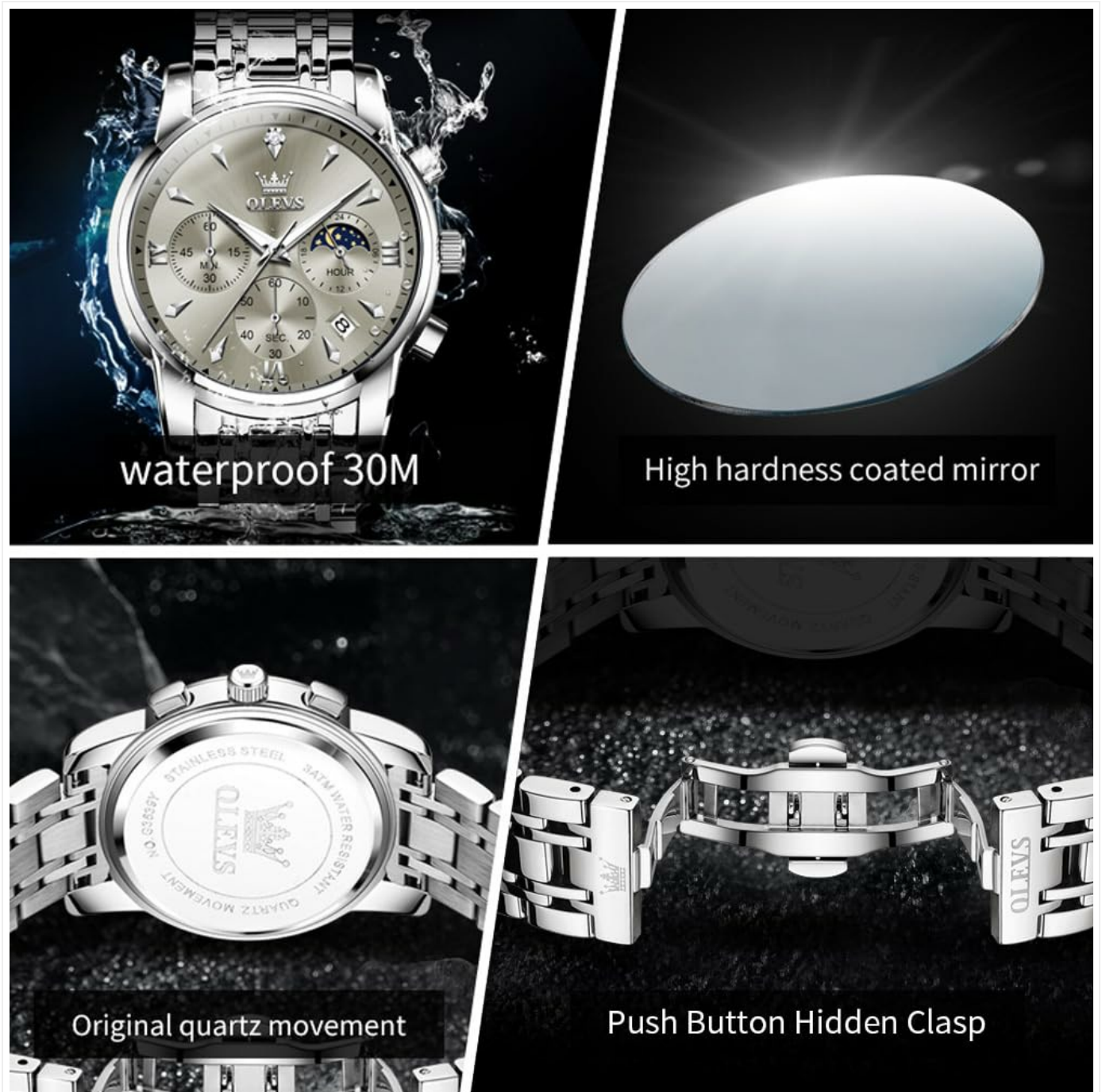
Image: Detailed view of the watch face highlighting the minute subdial, seconds subdial, and 24-hour moon phase dial.