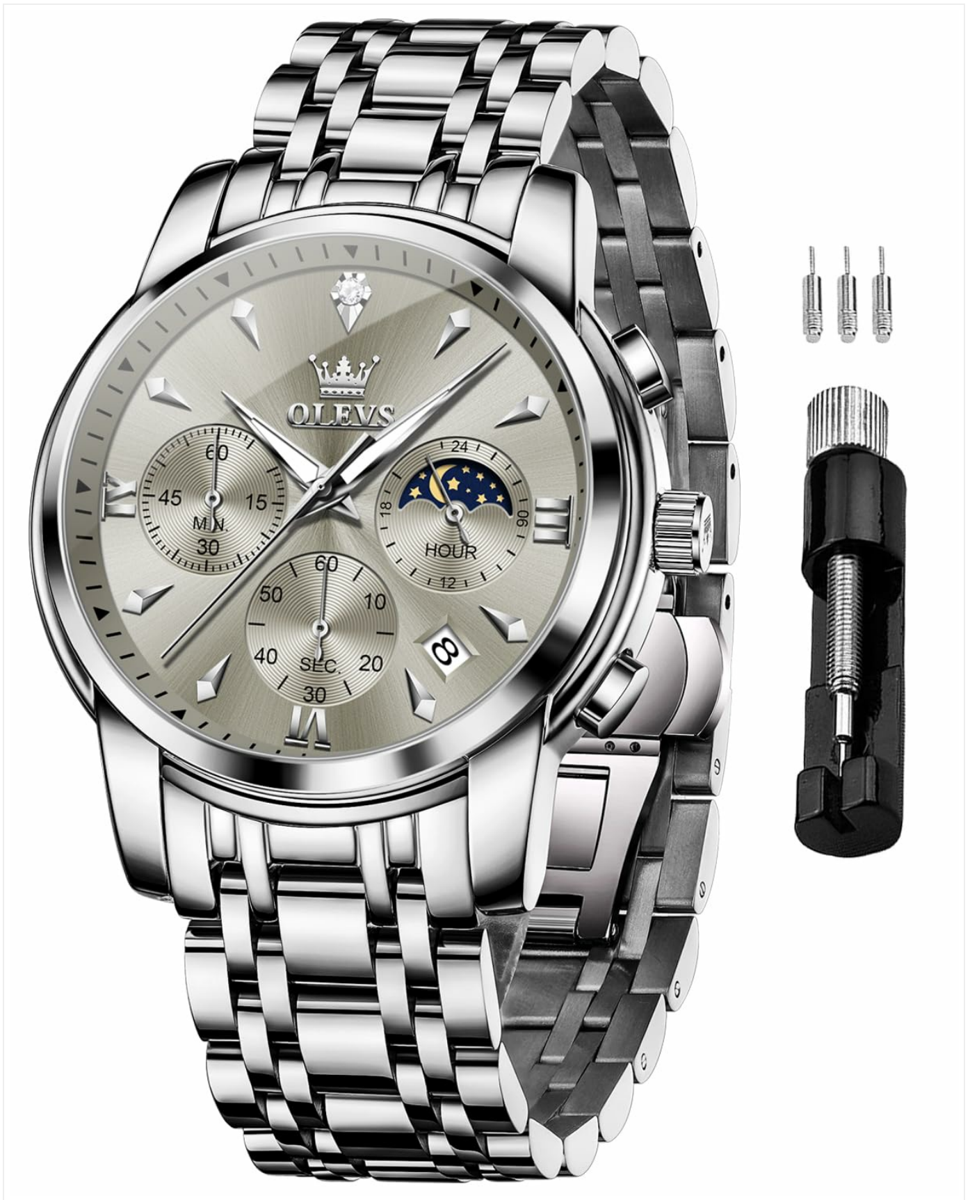
Image: The OLEVS 3639 watch with a silver-gray dial and stainless steel band, worn on a wrist.