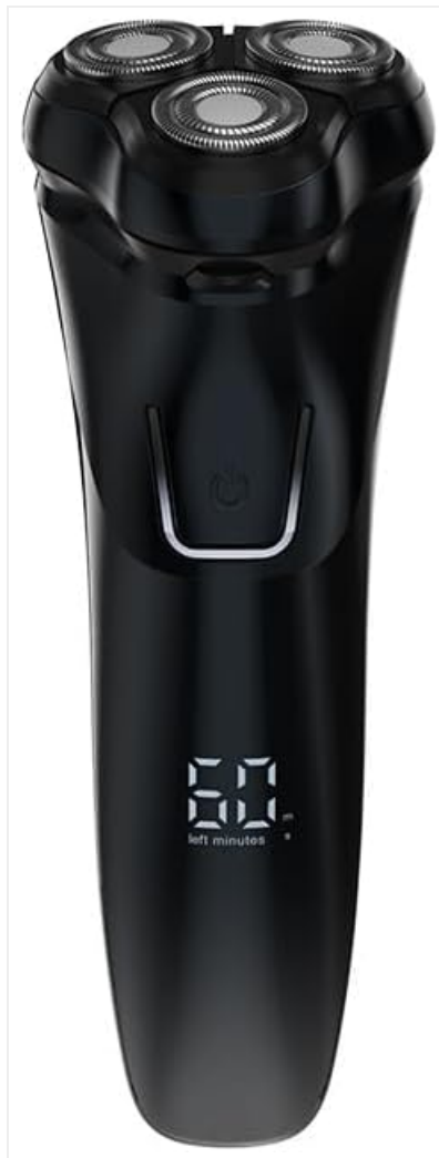
Figure 1: Oryzom V1 Pro Electric Shaver. This image shows the main unit of the shaver with its digital display indicating remaining minutes of use.