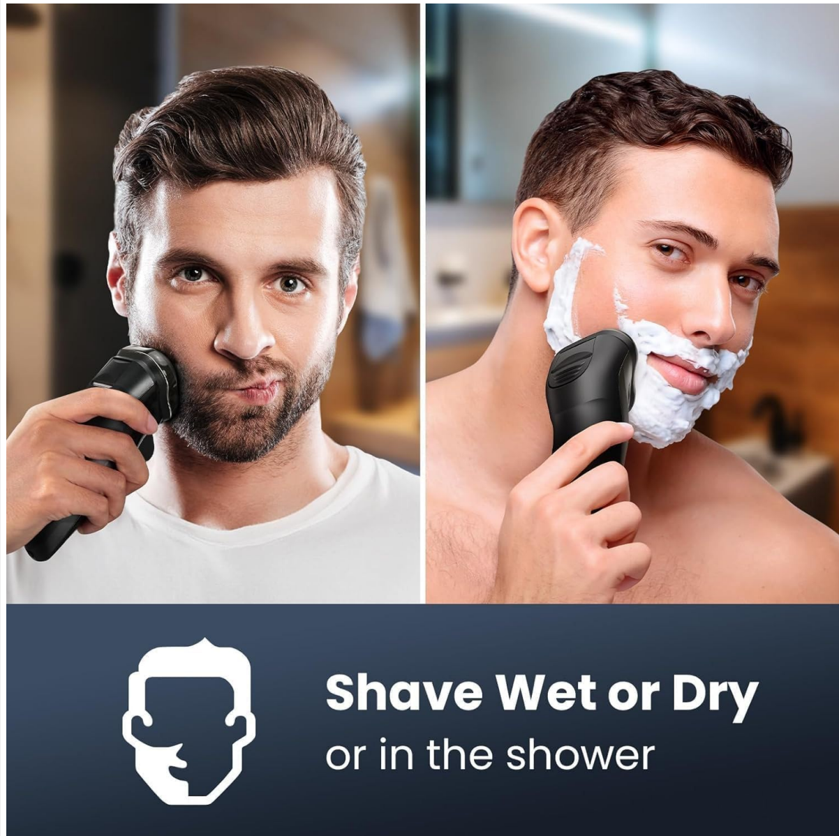
Figure 2: The Oryzom V1 Pro shaver can be used for both wet and dry shaving, offering versatility and comfort.