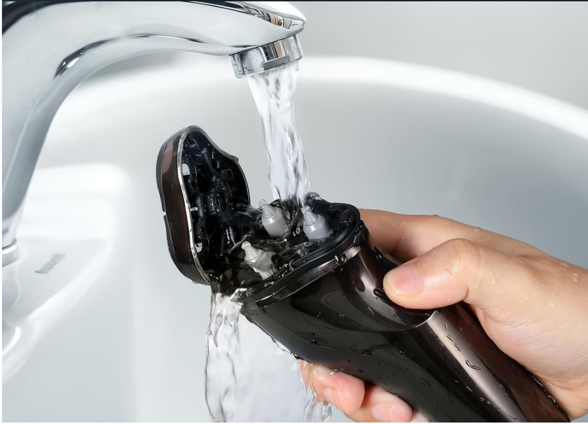
Figure 4: The shaver head is washable for easy cleaning under running water, ensuring hygiene and prolonging blade life.