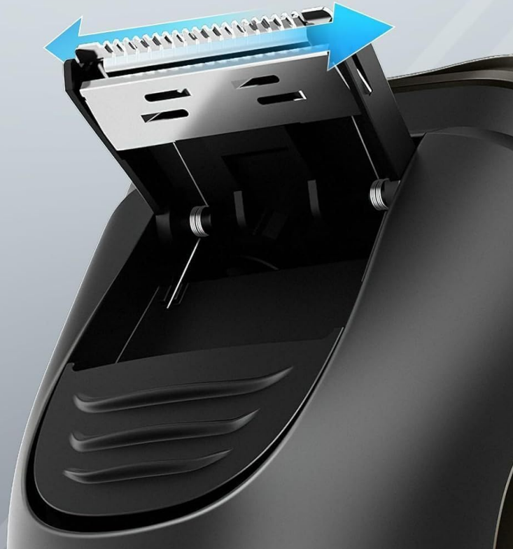
Figure 3: The integrated pop-up trimmer, with a 25mm blade width, is activated by a one-click ejection mechanism for precise grooming.