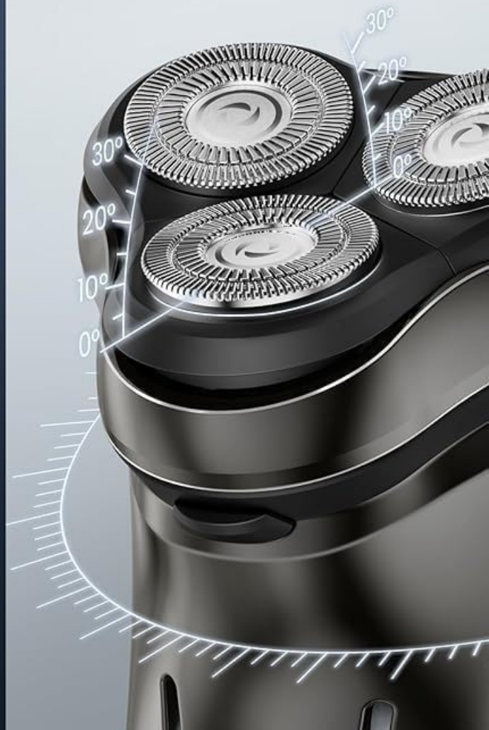
Figure 5: The 4D Flexible Floating Head system, designed to adapt to every angle and curve of your face for a close shave.