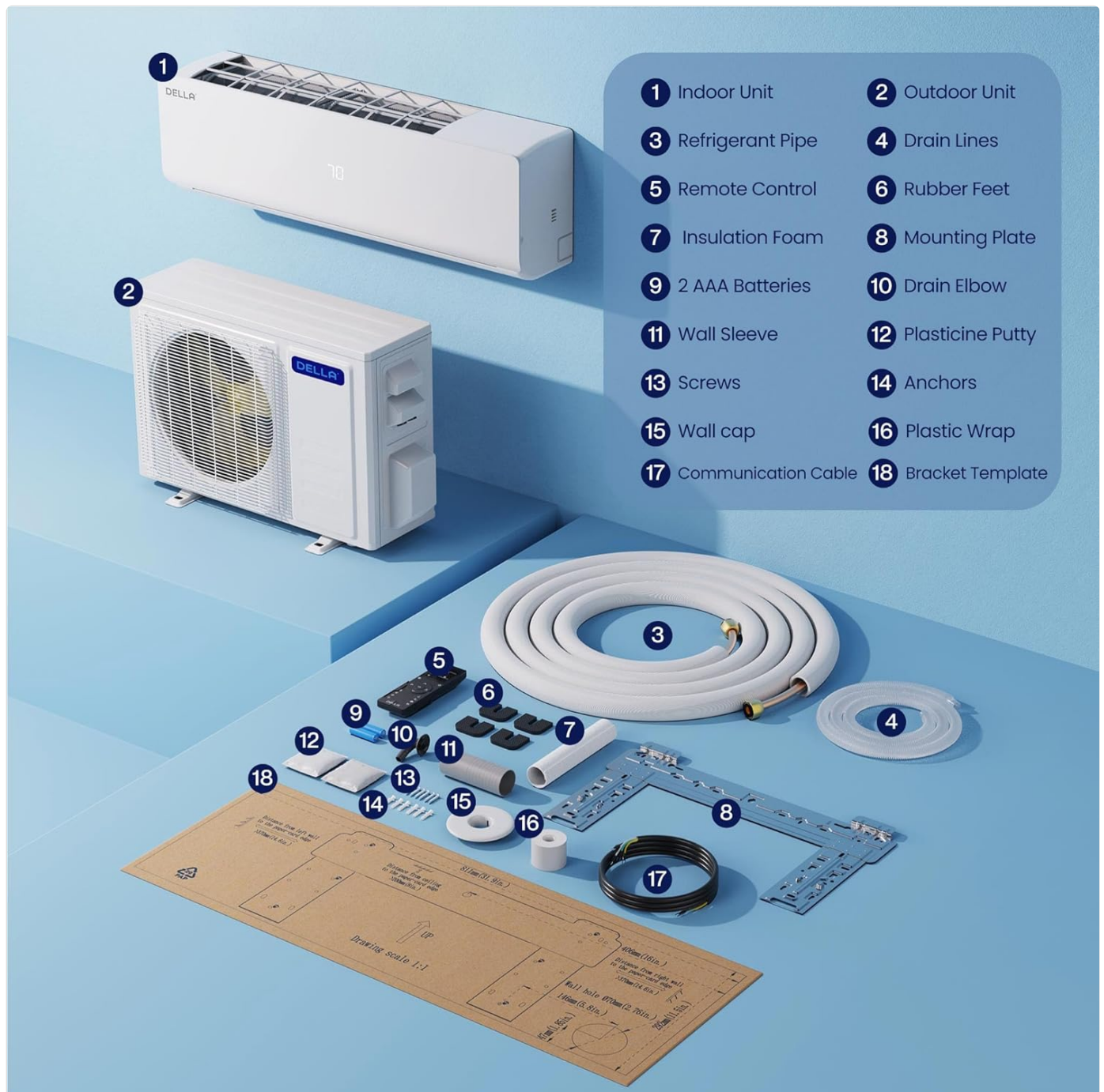
Image: Detailed diagram illustrating the various components included with the DELLA Mini Split system, such as indoor unit, outdoor unit, refrigerant pipe, remote control, and installation accessories.