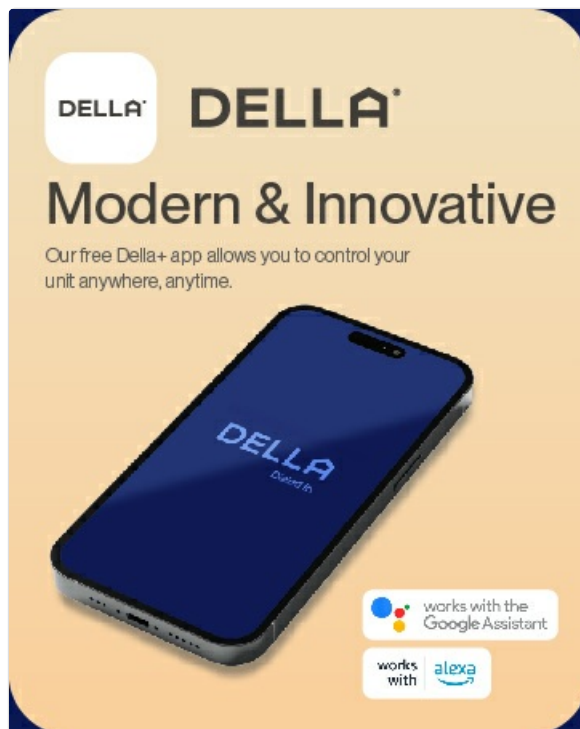
Image: A smartphone displaying the DELLA+ app interface, showing temperature control and various operational settings.

integration with smart home systems like Alexa and Google Assistant.