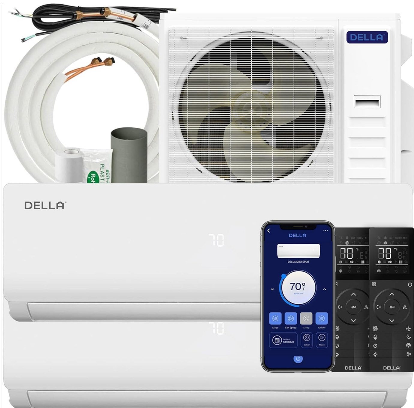
Image: The complete DELLA 36K BTU Dual Zone Mini Split system, showing the outdoor unit, two indoor units, remote controls, and installation kits.